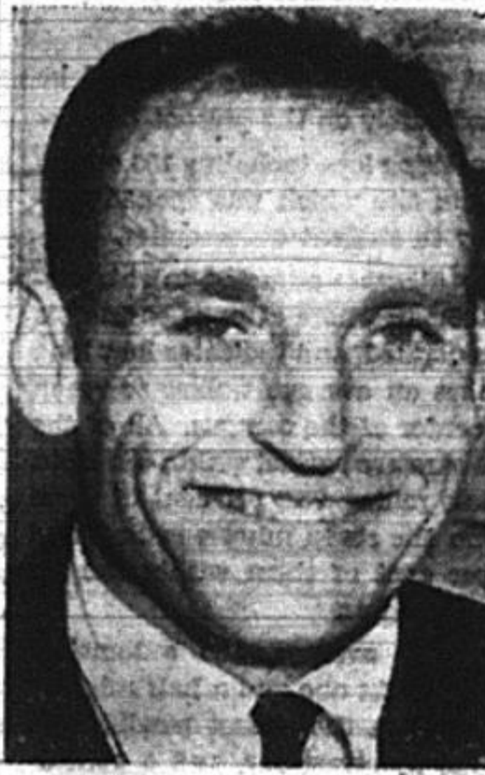
Colorful PEPPER MARTIN, former St. Louis Cardinal "gas-houser," will manage Sacramento of the Pacific Coast baseball loop this season. The Senators start practice this week.