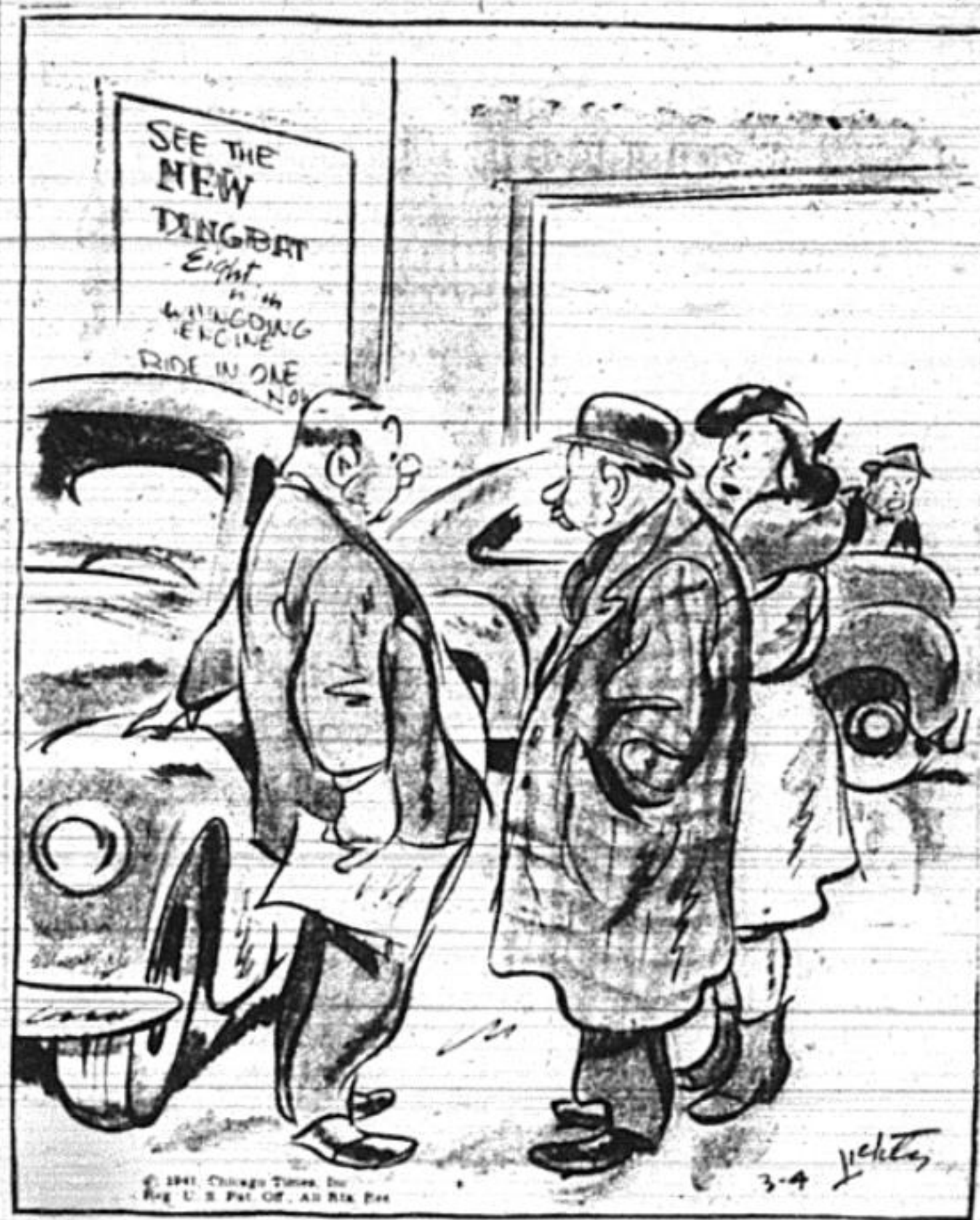
You'd better buy it now!—Next year you may have to take a twist-motored training plane instead!