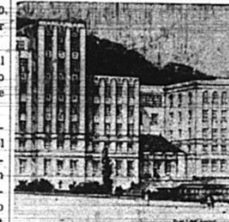
To relieve the crowded condition of students studying plant sciences, agronomy, botany, landscape gardening, truck crops, and related subjects it is proposed to construct a Plant Sciences building at Davis costing $600,000.

Additional bed facilities will not only permit the University to serve a greater number of patients, but will also enable the University to increase the amount and improve the quality of its training for medical students. It is believed that the funds derived from the patients will be sufficient to meet the out-of-pocket expenses for the hospital.