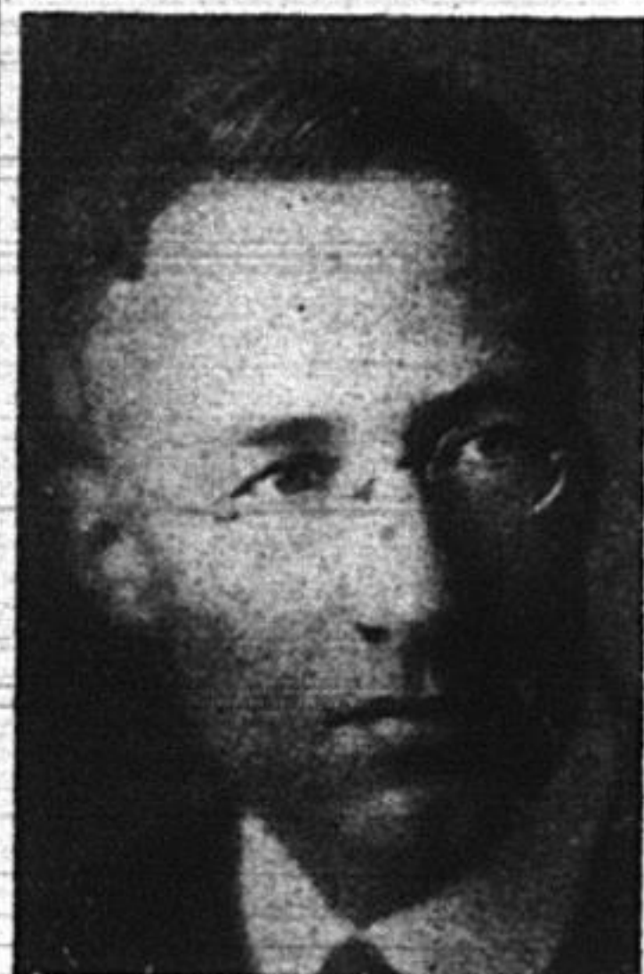
Dean Joel H. Hildebrand