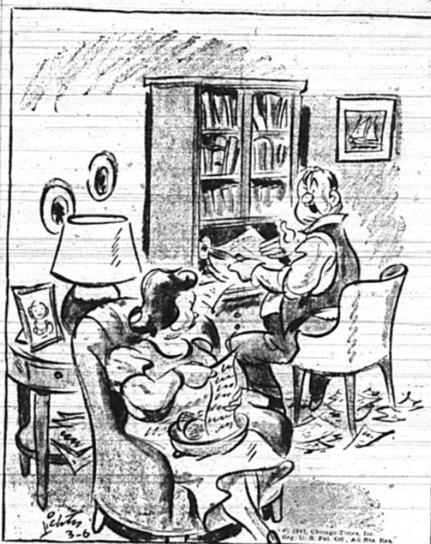
"The neighbors don't have access to my income tax returns, so I don't see why I should put down the amount of income you feel I should have earned!"