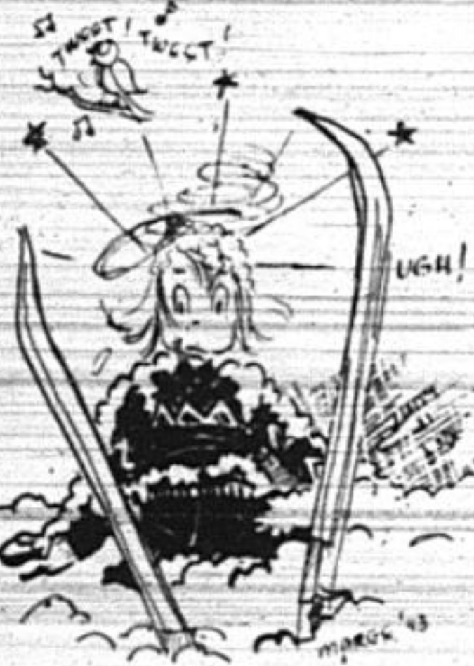
END O' THE TRAIL!