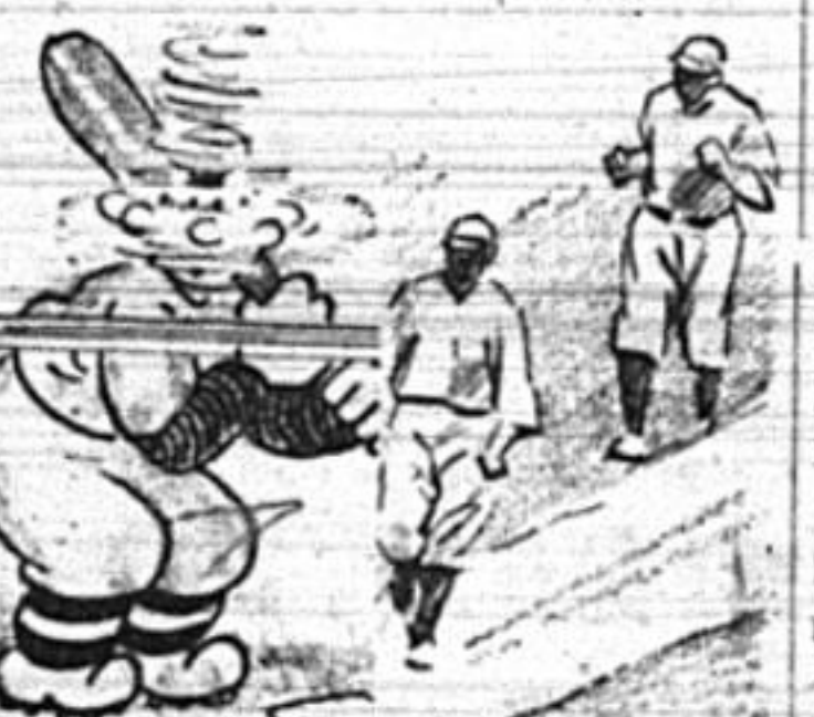
Spring is Here!

Nevertheless, we can't quite get over the feeling, call it a "hunch" if you will, that spring has turned the corner and is coming at us full blast. No, it's not because the birds are twittering, nor because the grass has doubled its length within the last 24 hours, nor because the sun has finally