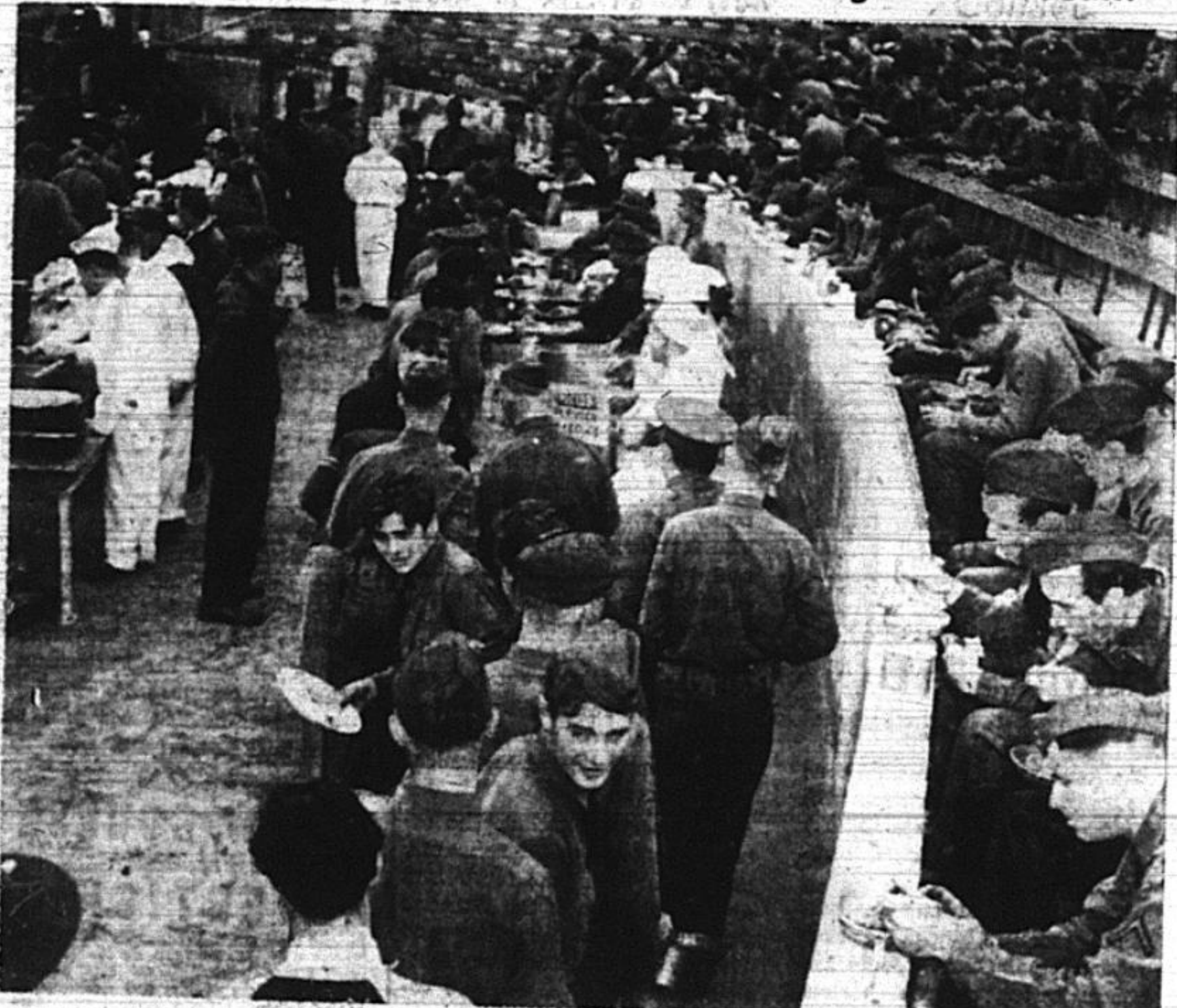
Temporary armed camp for 1200 members of the 160th Infantry, California National Guard, Los Angeles coliseum is now the scene of muskets and mess buckets instead of football or Olympic games. Here, some of the soldiers line up for a meal on the benches of the stadium. What will the gridders do this fall?