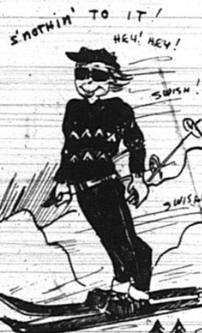
SHE FLIES THRU THE AIR