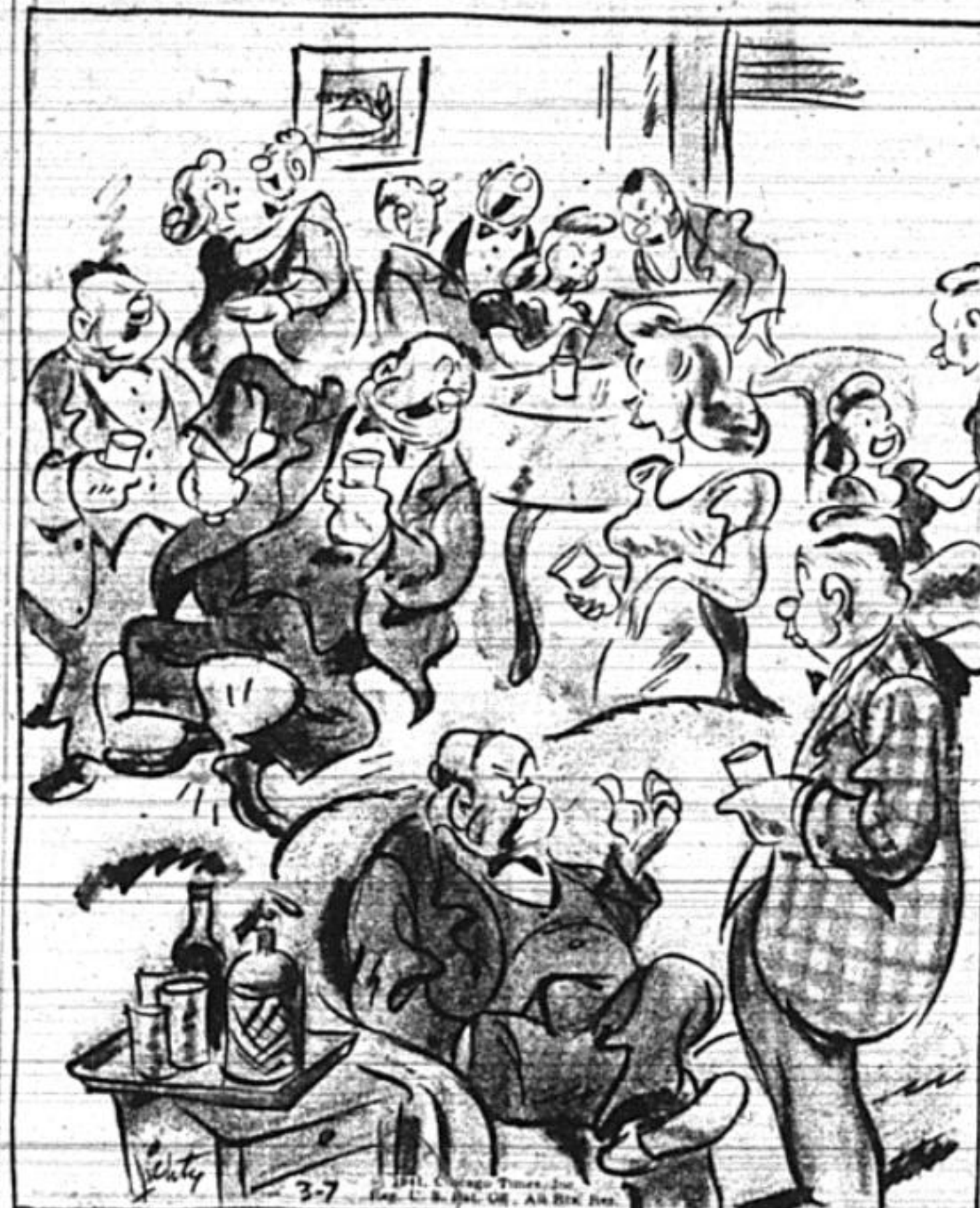
"Oh, that's the landlord—we gave this party to break our lease and now he won't hear of it!"