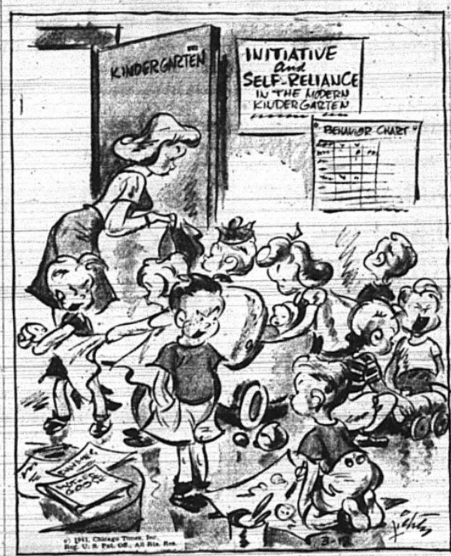
"Won't it be swell to get into first grade, where they order you around?"