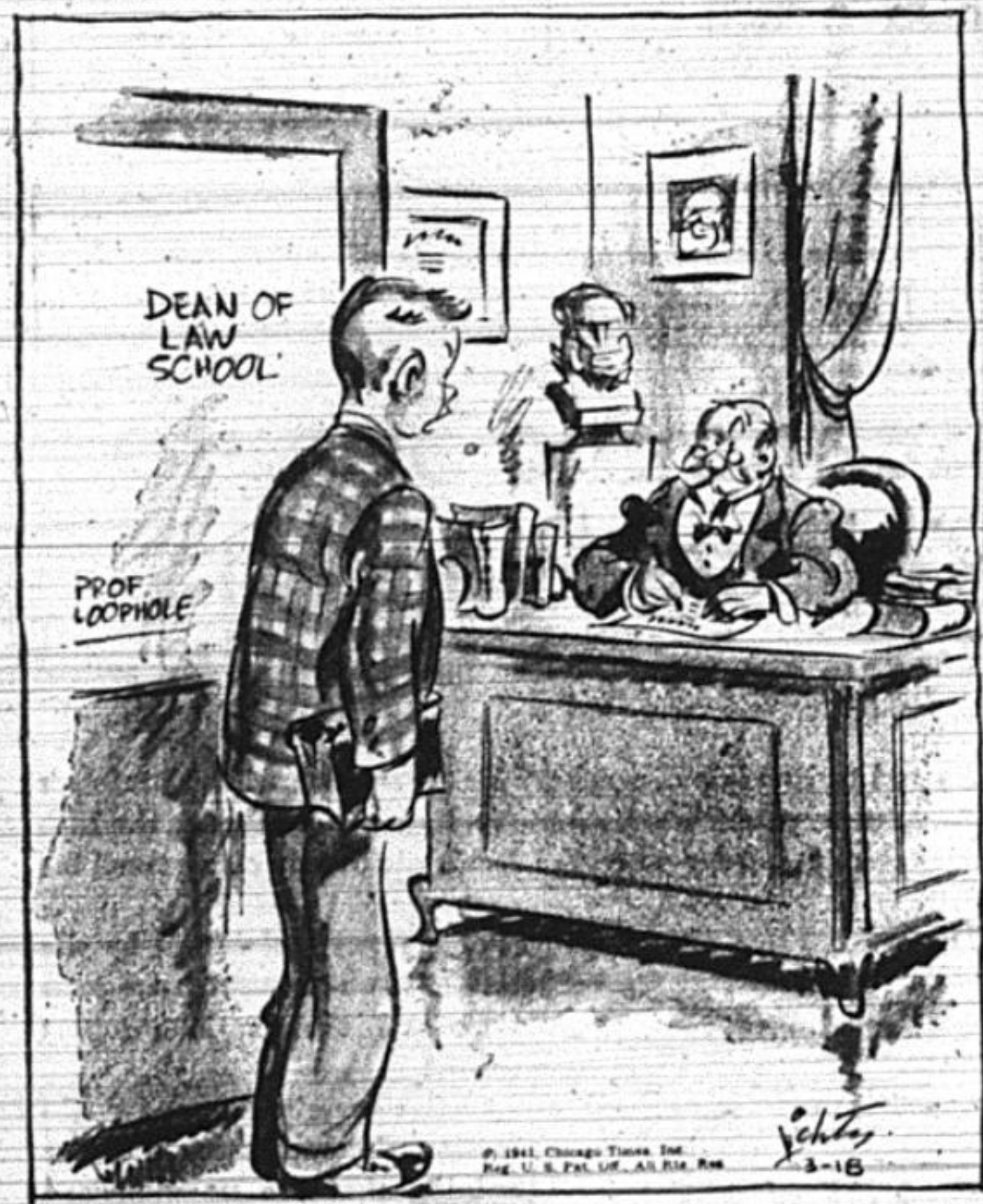
"Can I get your permission to drop international law, Dean? I'd like to take up something more practical."