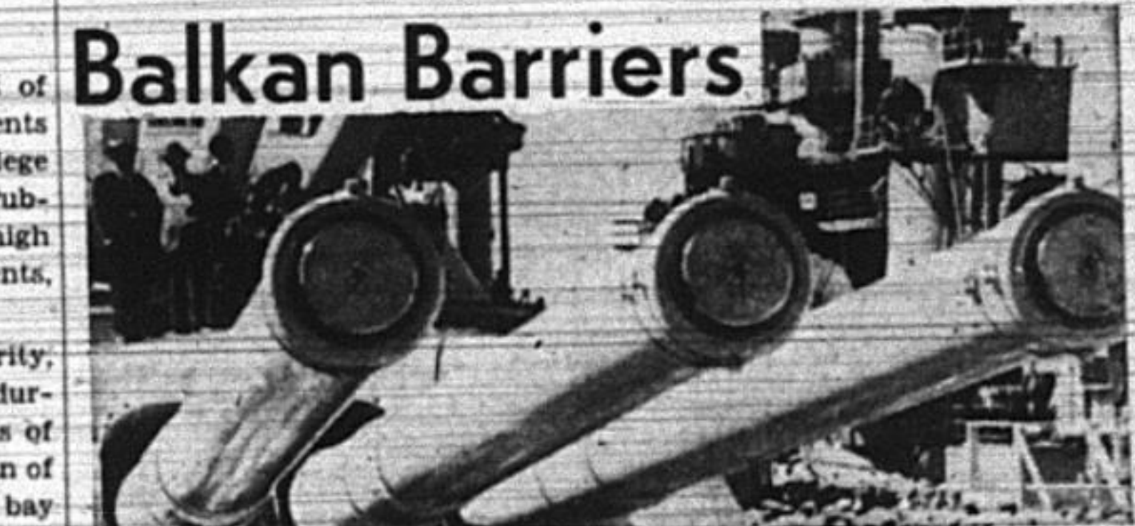
NOTES ON THE NEWS by Bill Jones '41

The course includes instruction in projection printing, orthochromatic photography, pictorial composition, negative retouching, home portraiture, and a series of field trips. Enrollment fee is $8 for 10 meetings.