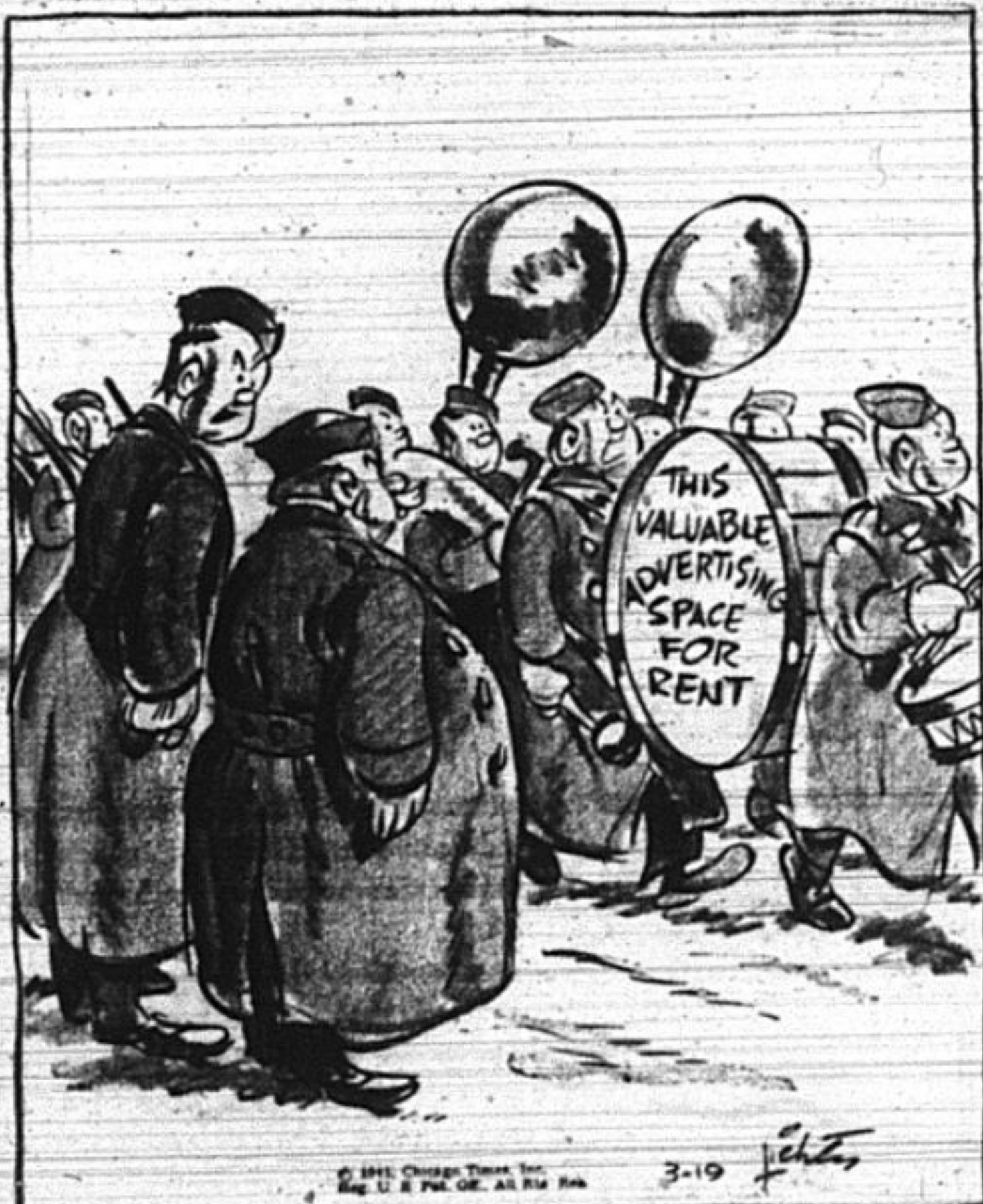
"He says he simply can't get along on $30 a month, sir!"