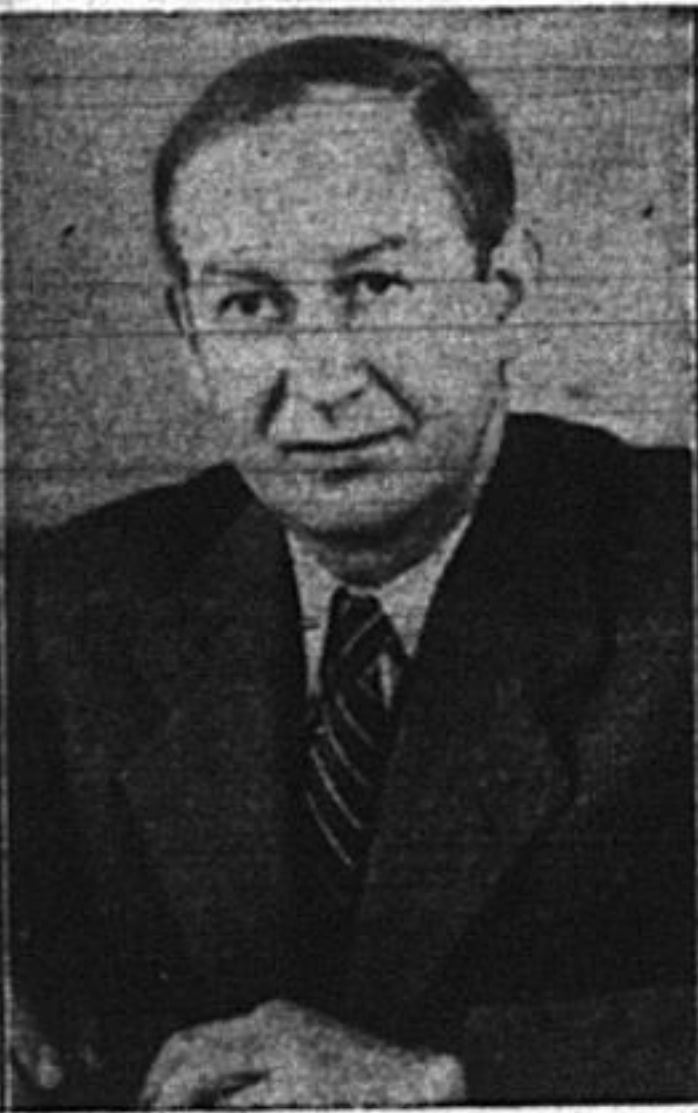
ROBERT GORDON SPROUL