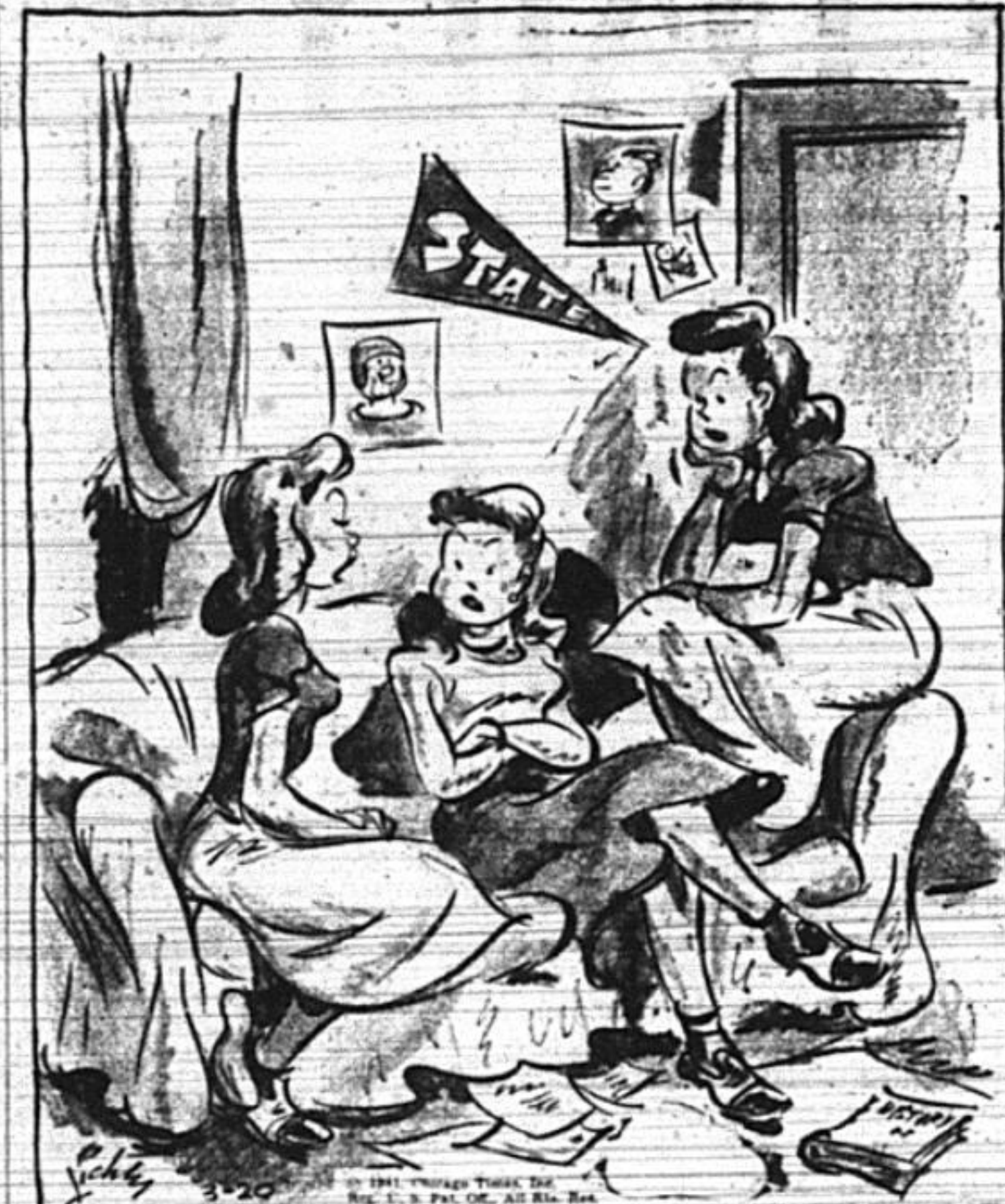
"You girls can have your careers!—I'm going to be an airplane hostess and get married as quick as I can!"