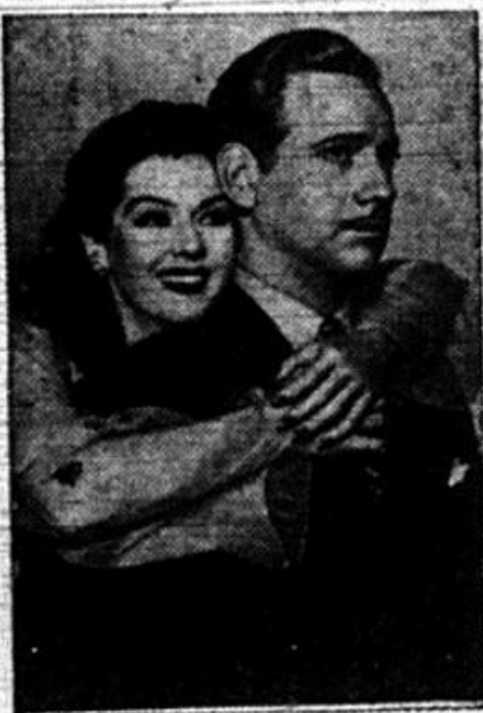
ROSALIND RUSSELL and MELVYN DOUGLAS

Friday and Saturday, the Fox UC runs the gamut from the Near East