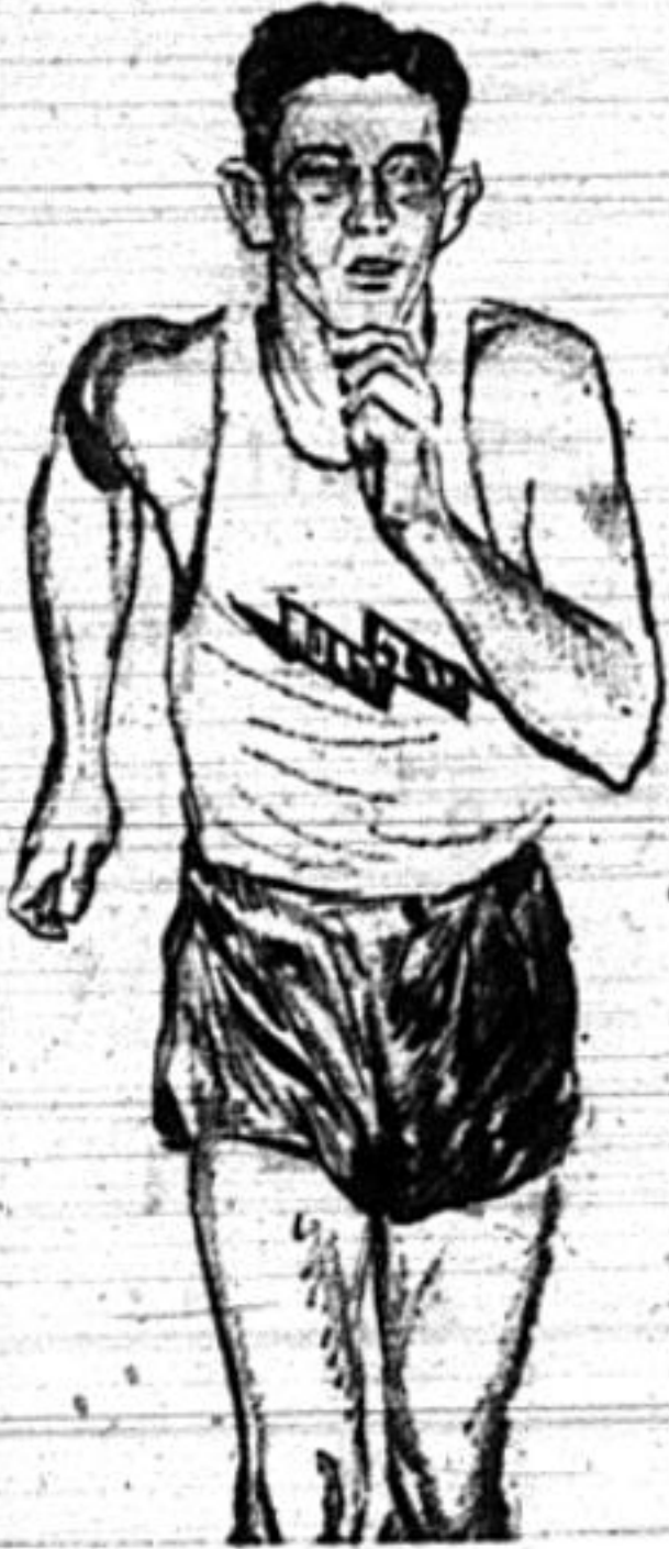
Track Season Opens