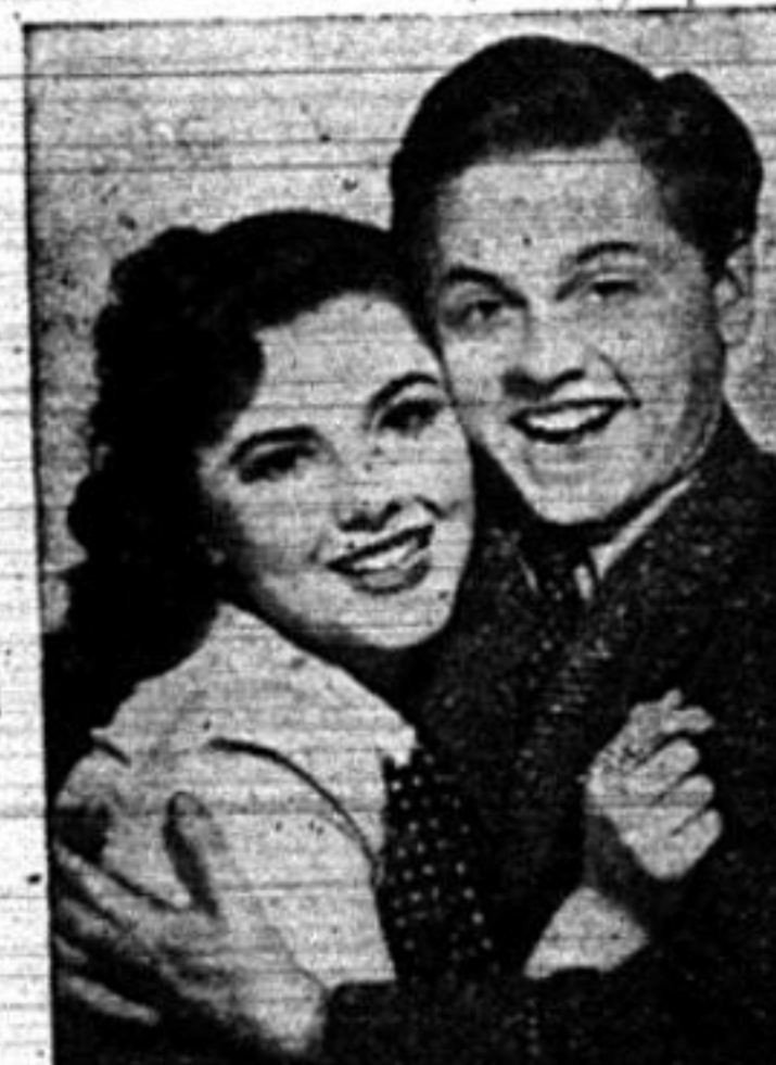
MICKY ROONEY and ANN RUTHERFORD

with "South of the Suez," starring George Brent and Brenda Marshall, to the Wild West with "Kit Carson," featuring Jon Hall.