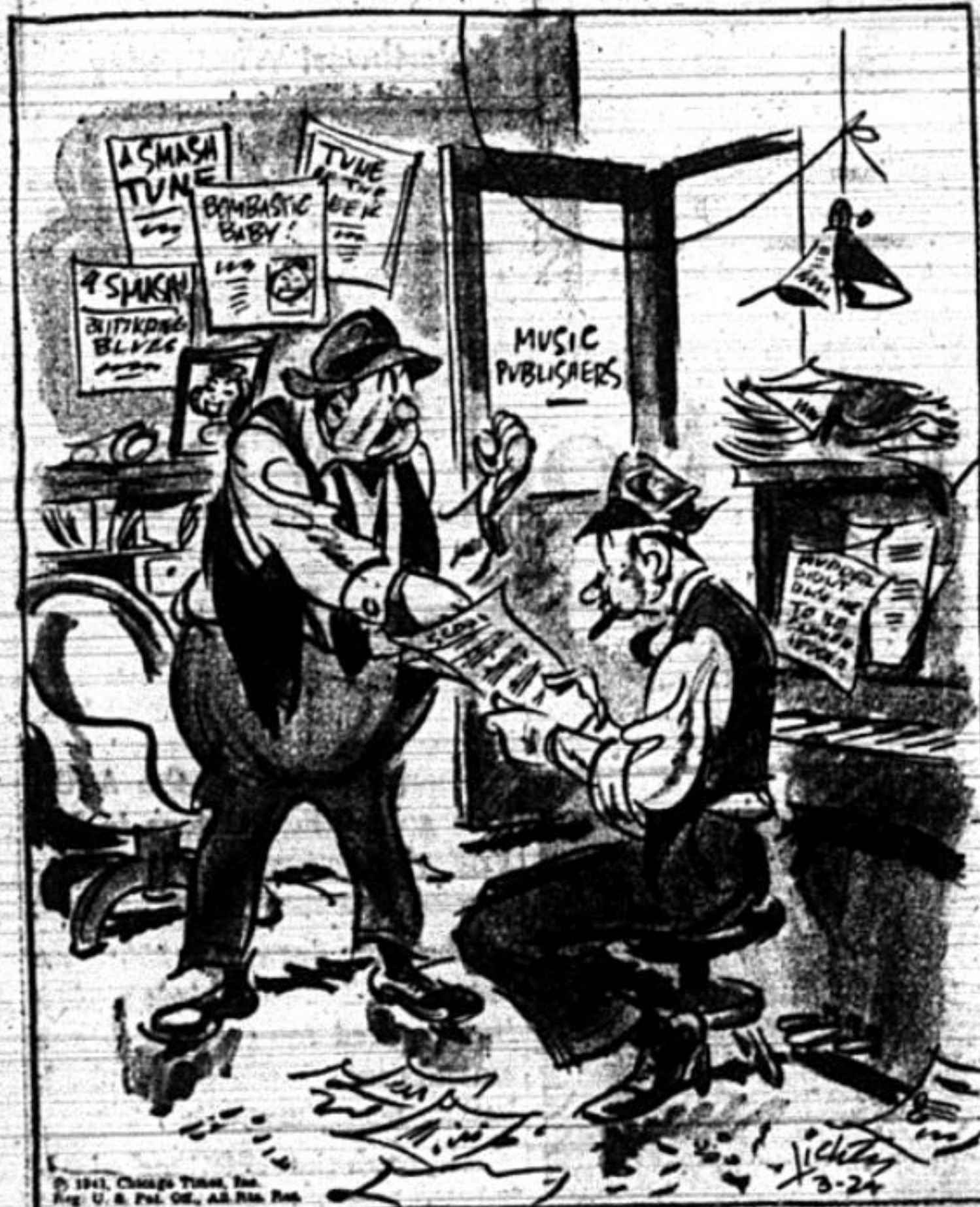
"It'll be a smash hit tune for our mechanized army—I'm calling it, 'Clank, Clank, Clank, the Boys Are Marching!'"