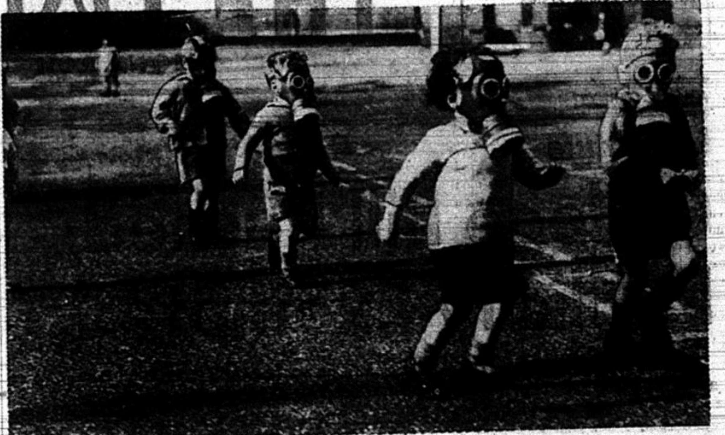
Although a new British law compelled evacuation of London of these children under 5 years of age who were suffering from the confinement of shelter life, they are not yet free from the horrors of war. The photograph shows the youngsters drilling with gas masks "just in case" on the grounds of the London County Council residential school, near Windsor, where they are undergoing treatment at the infirmary. After a period of medical attention, they will resume their normal life.