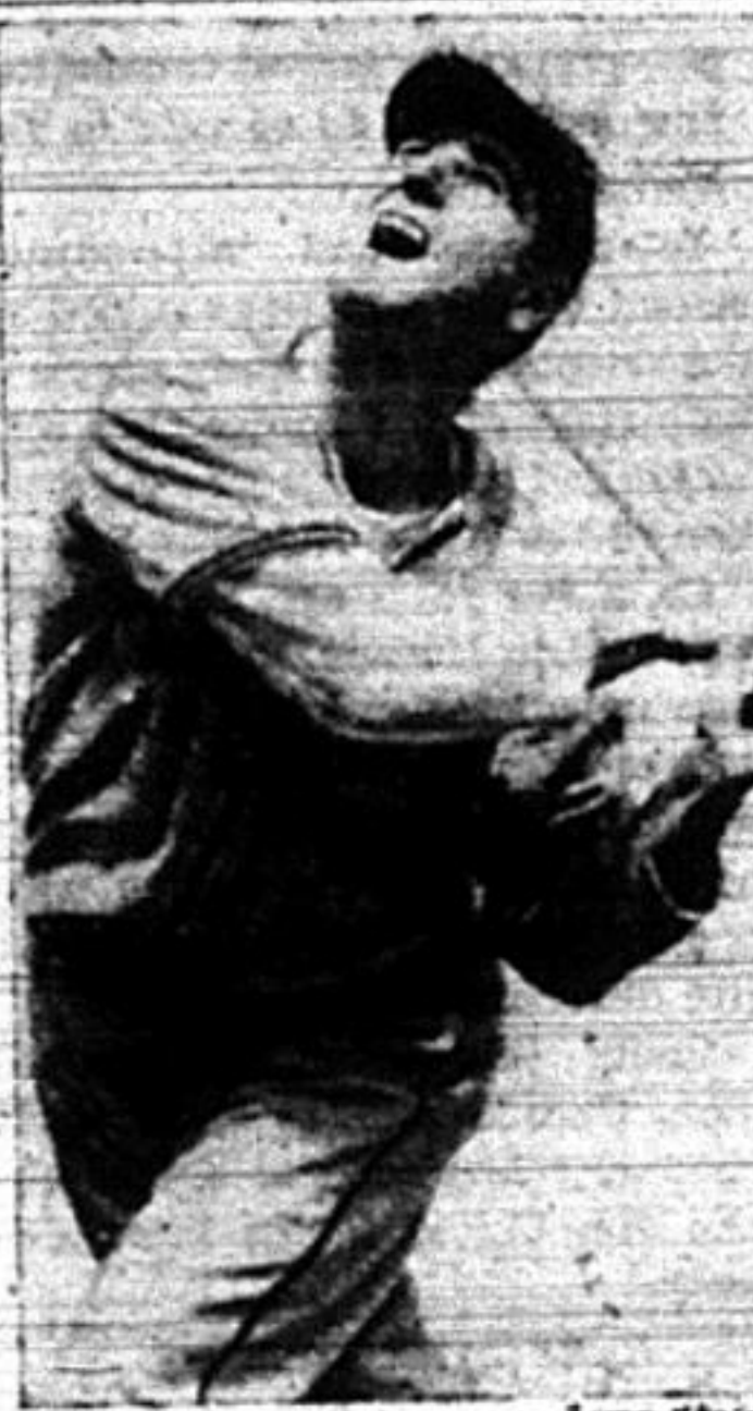
Can it be the breeze?—7

In case the Varsity loses today, they won't be entirely out of champion-