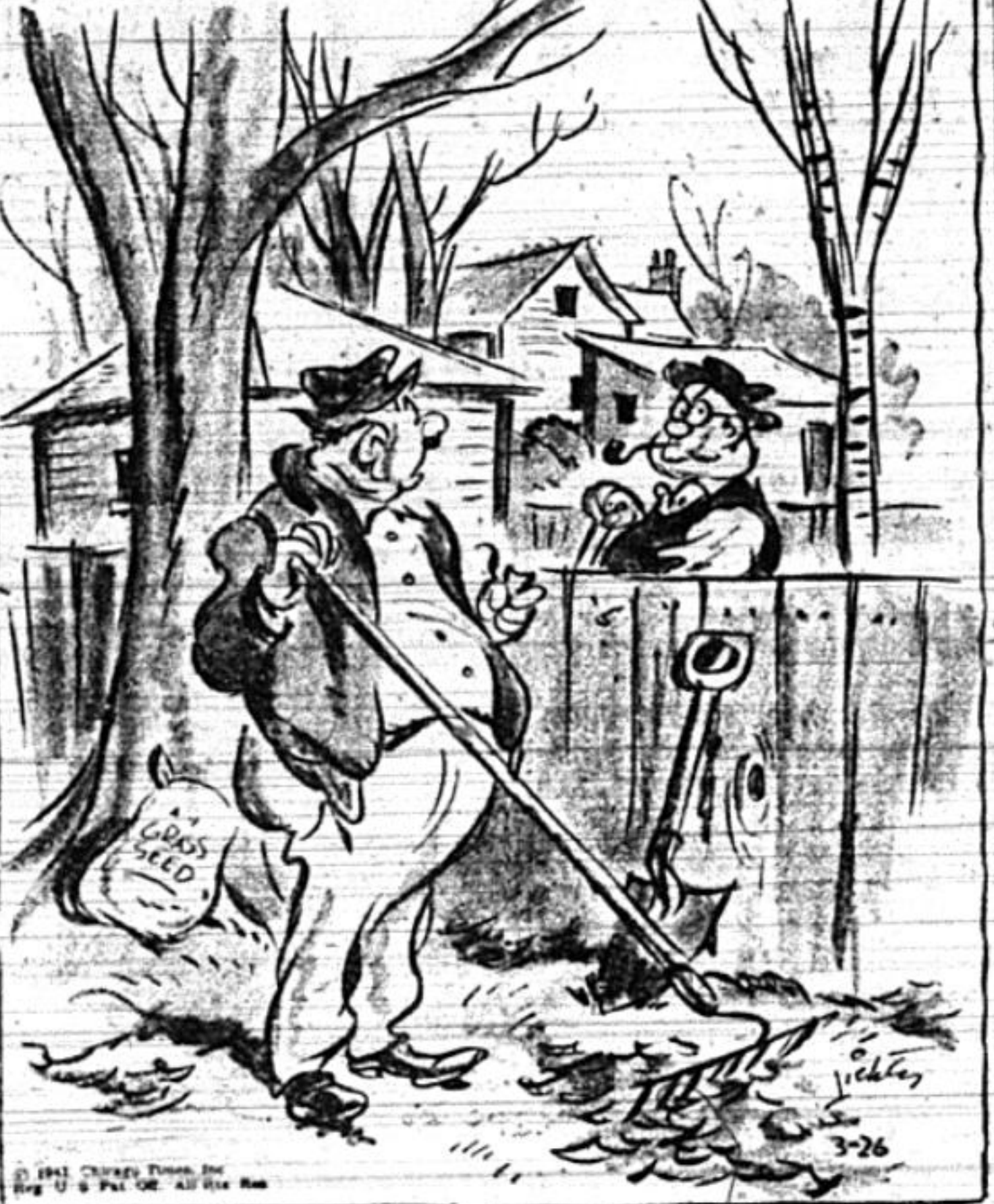
"For a man who so bitterly opposed the 'Lend-Lease Bill,' you're certainly taking your time returning my lawnmower you borrowed last September!"