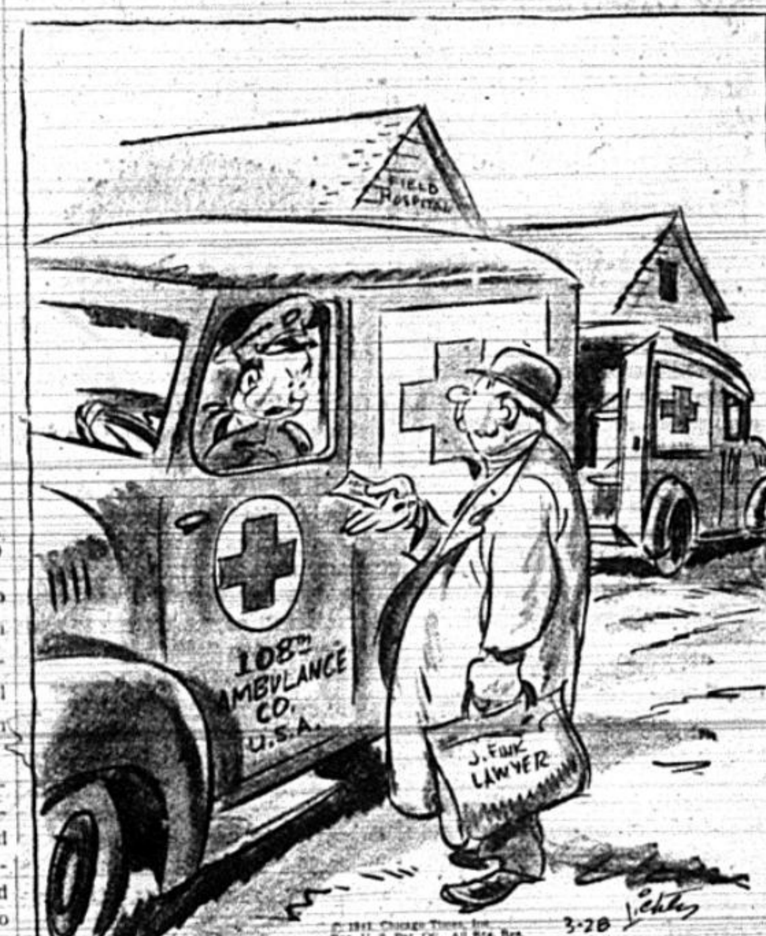
"Well, no, I ain't got a tie-up with any lawyer—why do you ask?"