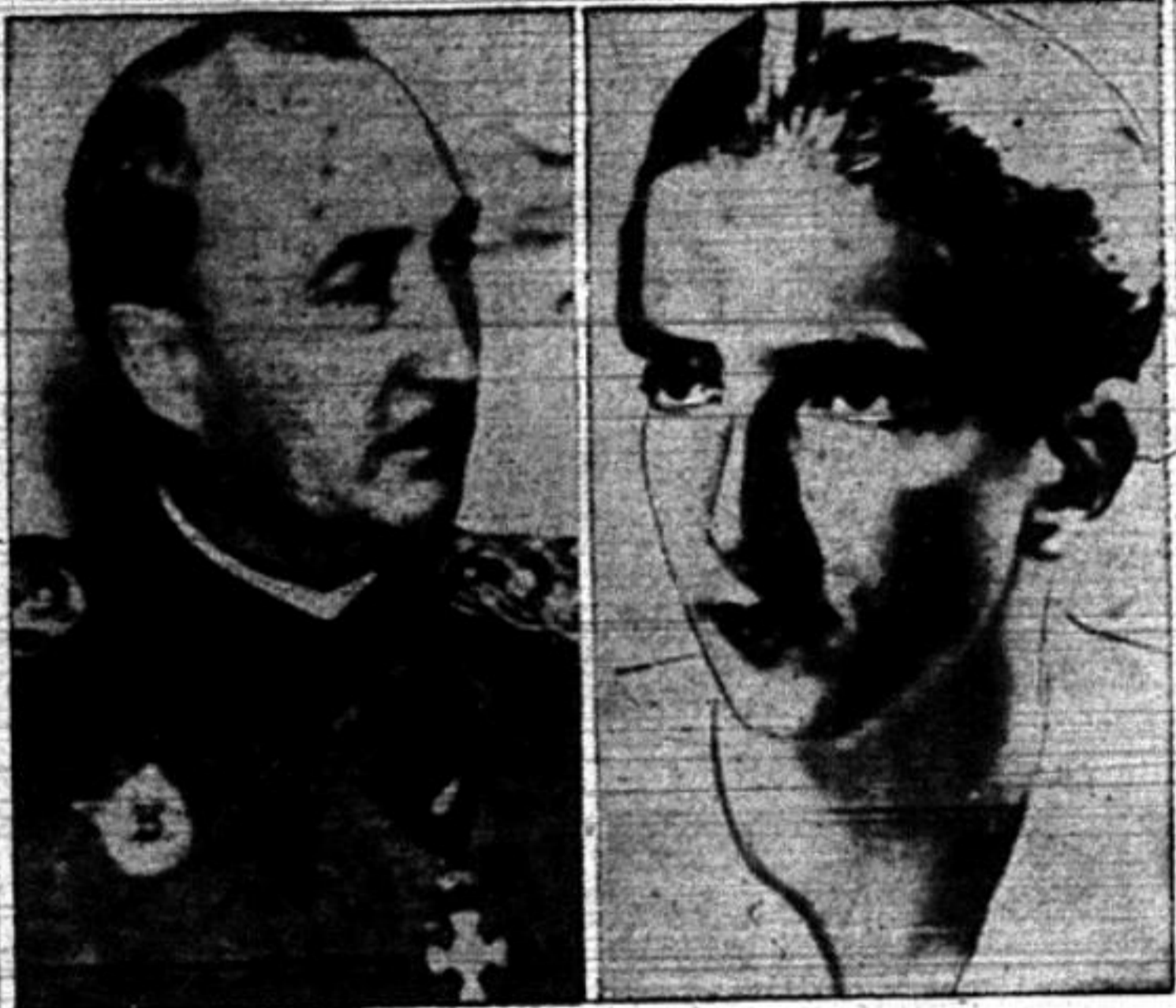
Two main figures in the Balkan crisis are GEN. RICHARD DUSAN-SIMOVITCH, left, new pro-British premier of Yugoslavia, and 17-year-old KING PETER II.