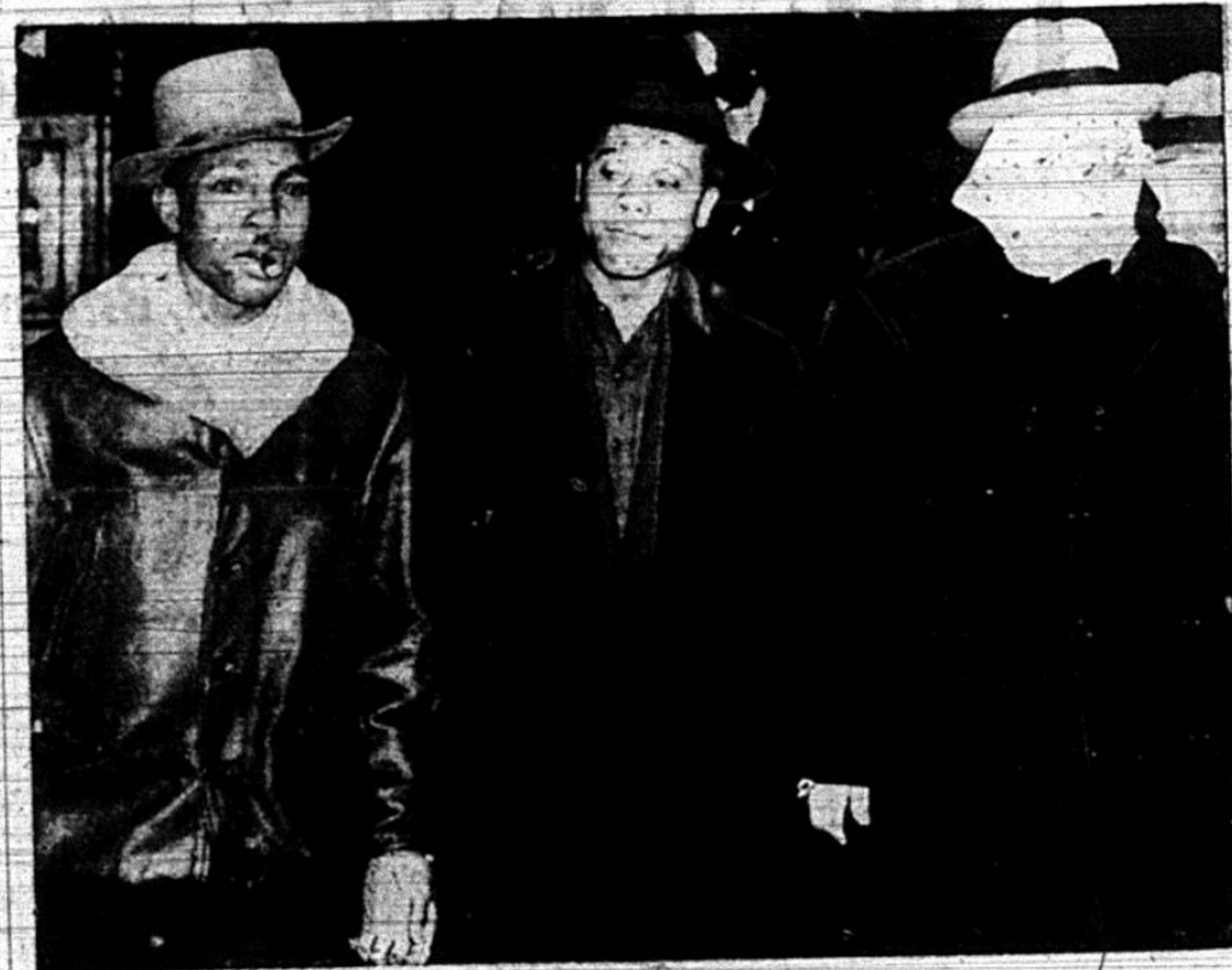
EARL BROWDER, leading Communist in the U.S., is shown on his arrival at Atlanta, Georgia, where he will serve a four-year term on a charge of using a fraudulently obtained passport. Browder wore a mask at his own request to avoid being pestered by cameramen.