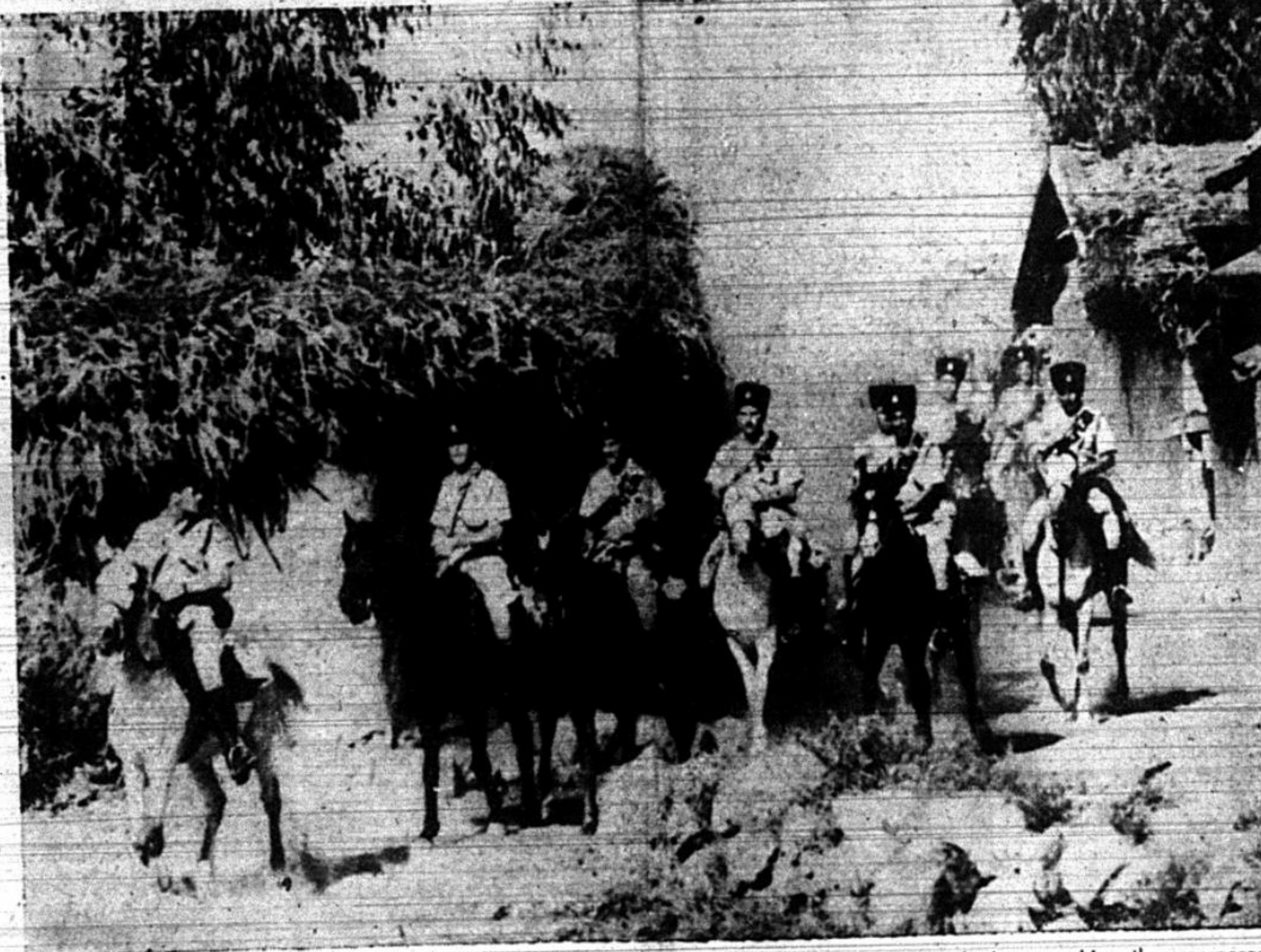
The alliance between these Jews, Arabs, and Britons against Fascism for the war these three groups had engaged in a three-cornered racial conflict, but now it's all settled.