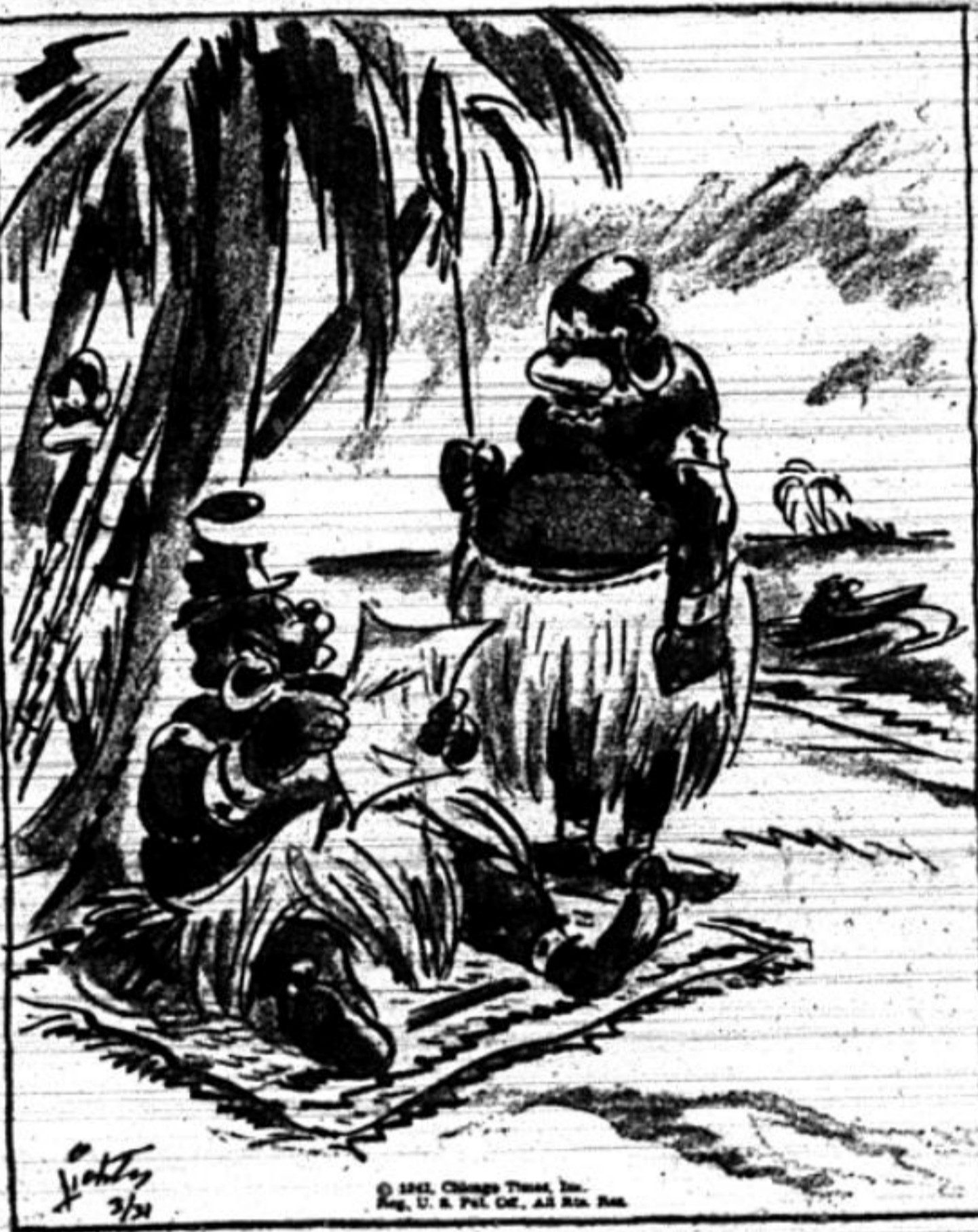
"It's from Hitler!—he wants me to visit him at Munich!"