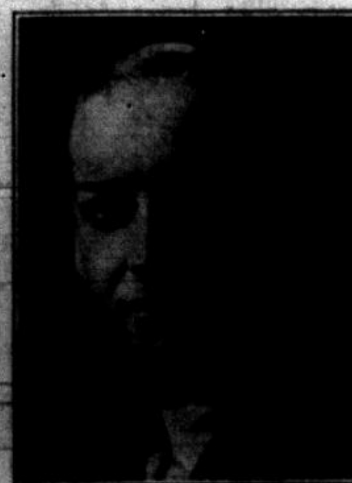
HENRY MORGENTHAU See Column 2