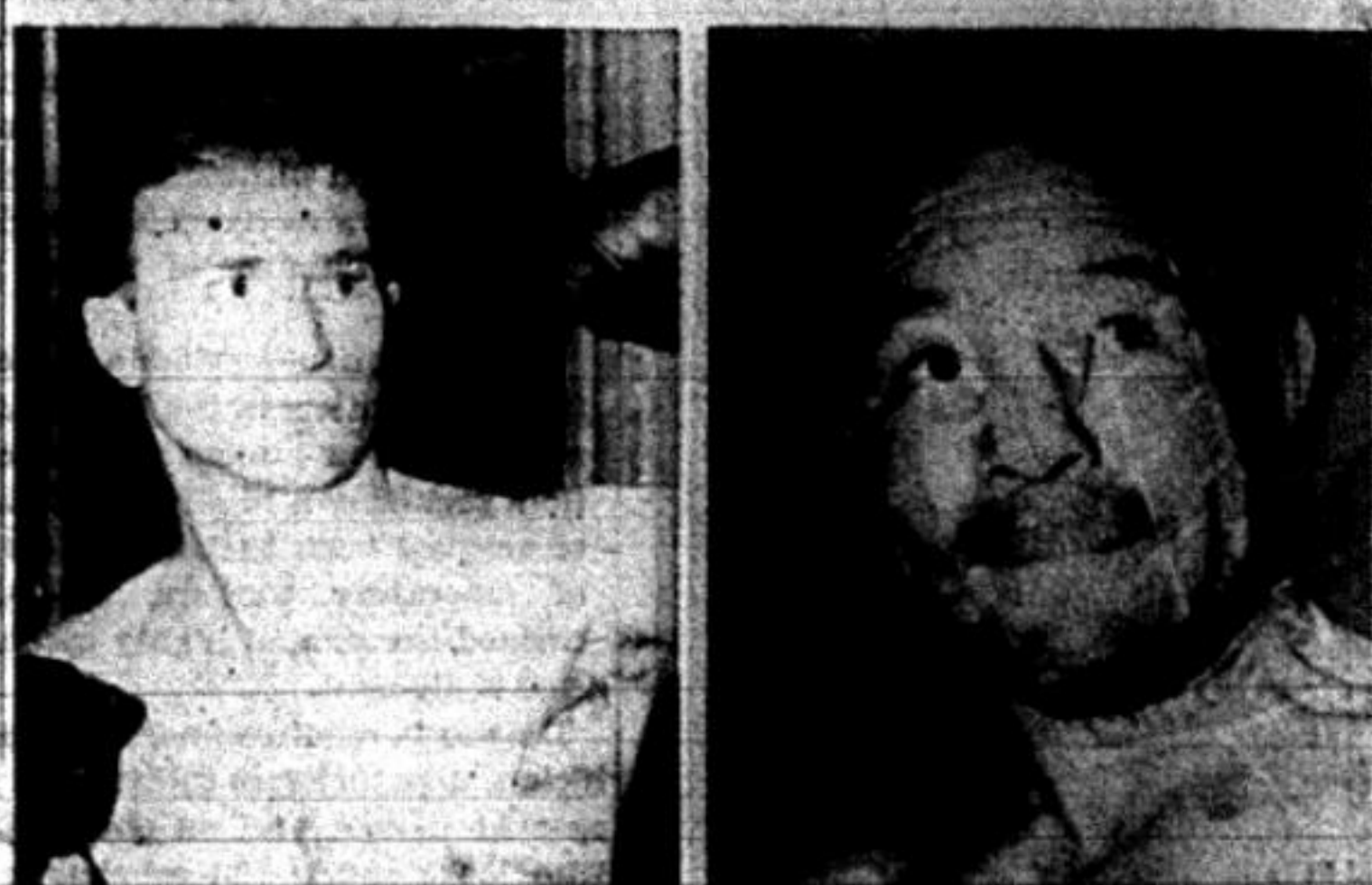
The comeback trail is a rough road, but FRED STEELE, left, former middleweight champion, and MAX BAER, former heavyweight champ, are both getting back into condition for another try at their old titles. Baer fights Lou Nova Friday night at New York.