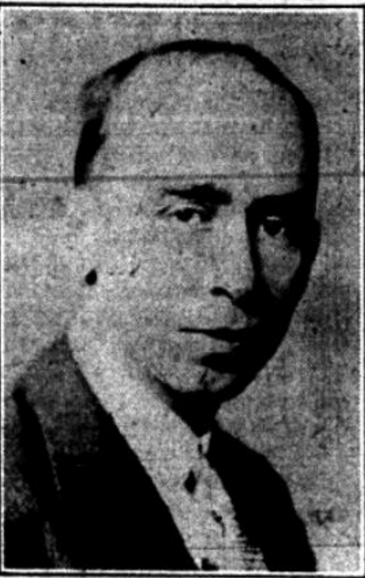
JULIEN BRYAN See Column 4