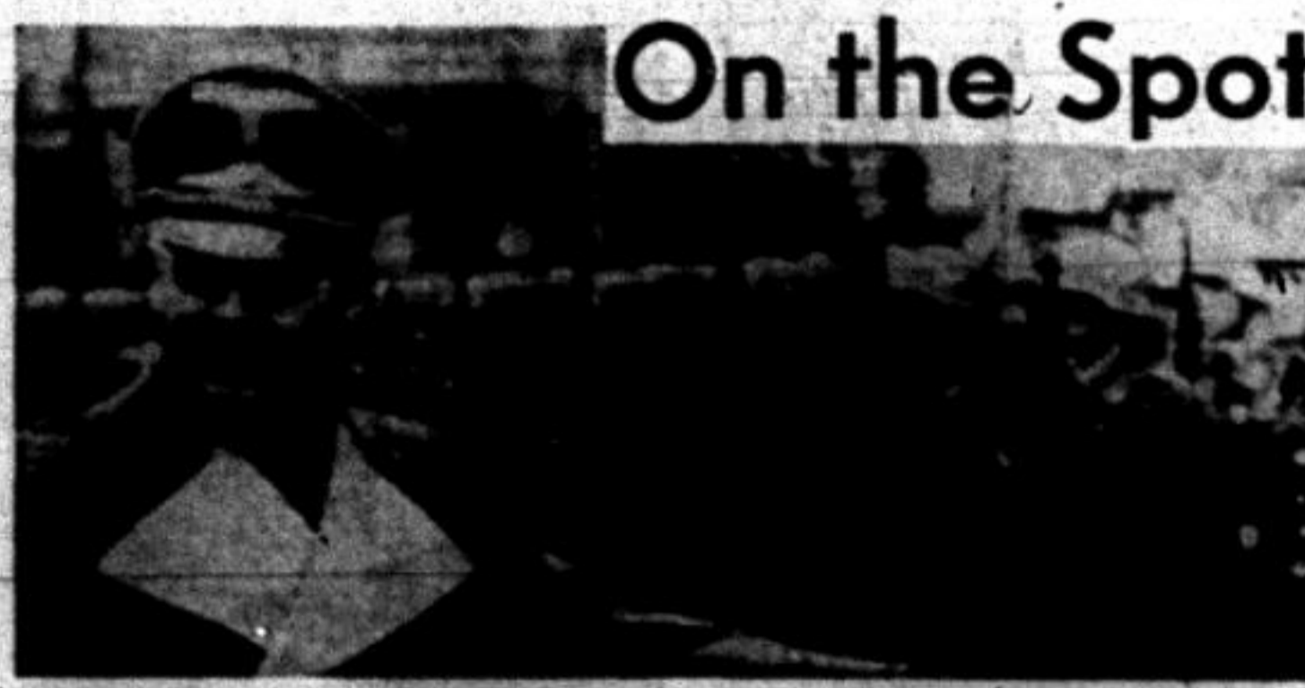
On the Spot

No charge will be made for registration, though faithful attendance must be pledged. Students may sign in room 207 South hall, room 202A Stephens Union, or room 207 Haviland hall.