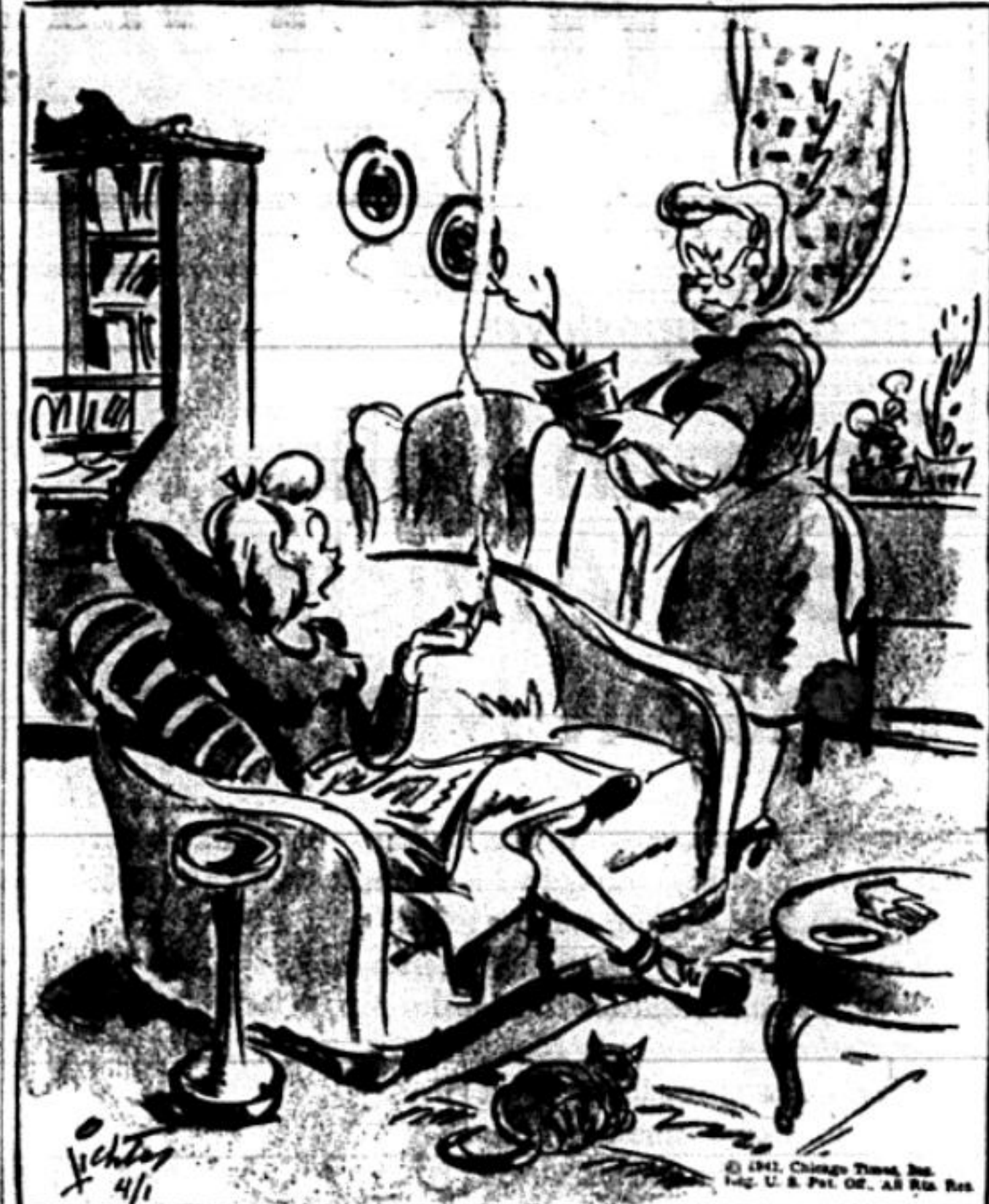
"Don't tell me you didn't smoke when you were a girl, mother!— what did you do whenever you felt you couldn't live another minute without a cigarette?"