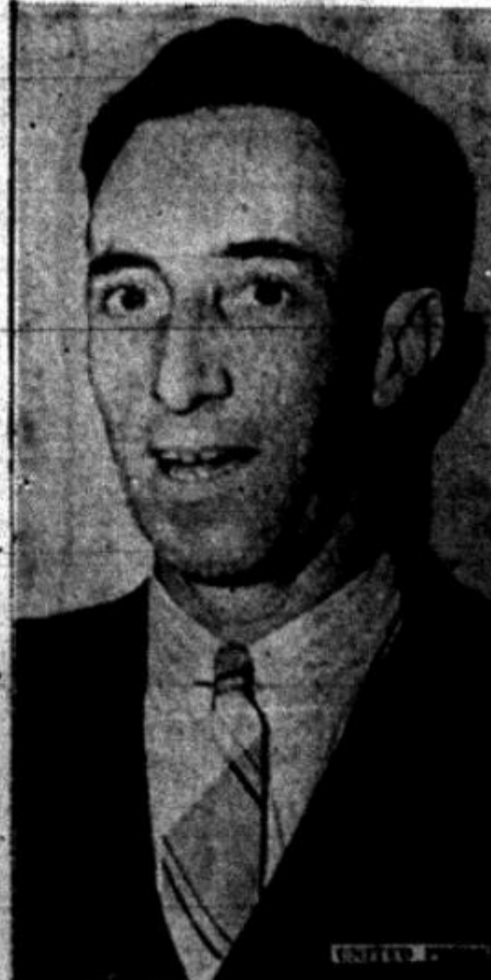
HARRY BRIDGES See Column 2