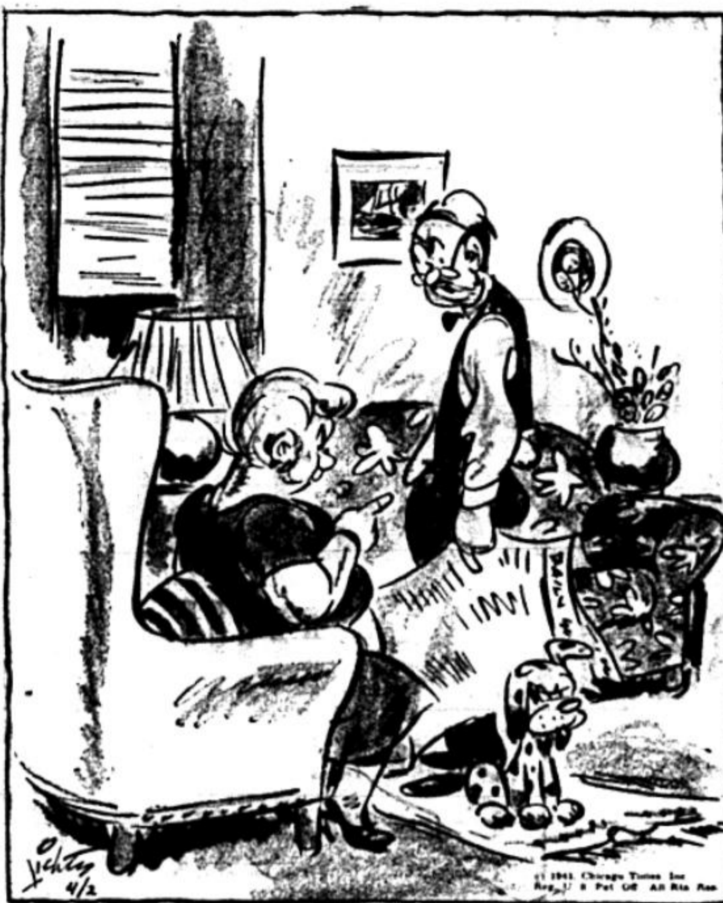
"It's only a matter of patience, training him to obey, dear—remember all the trouble you had with me at first?"