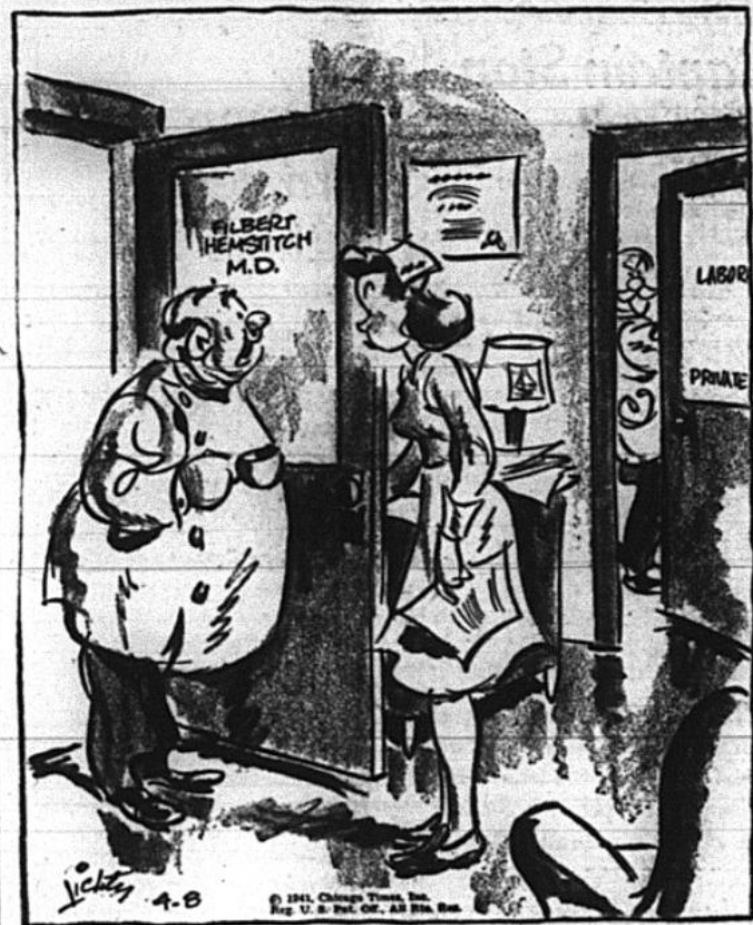
"I'm your neighbor, Dr. Truffle, from across the hall—could I borrow a pinch of SULFANILAMIDE?"