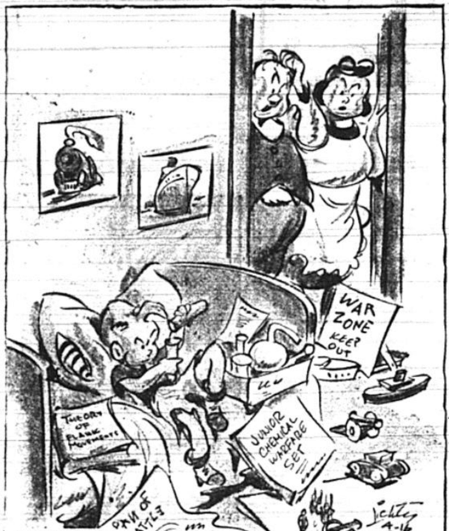
"I dunno! When I was his age I played war games with a stick on my shoulder, shouted 'Bang! Bang!' and let it go at that!"