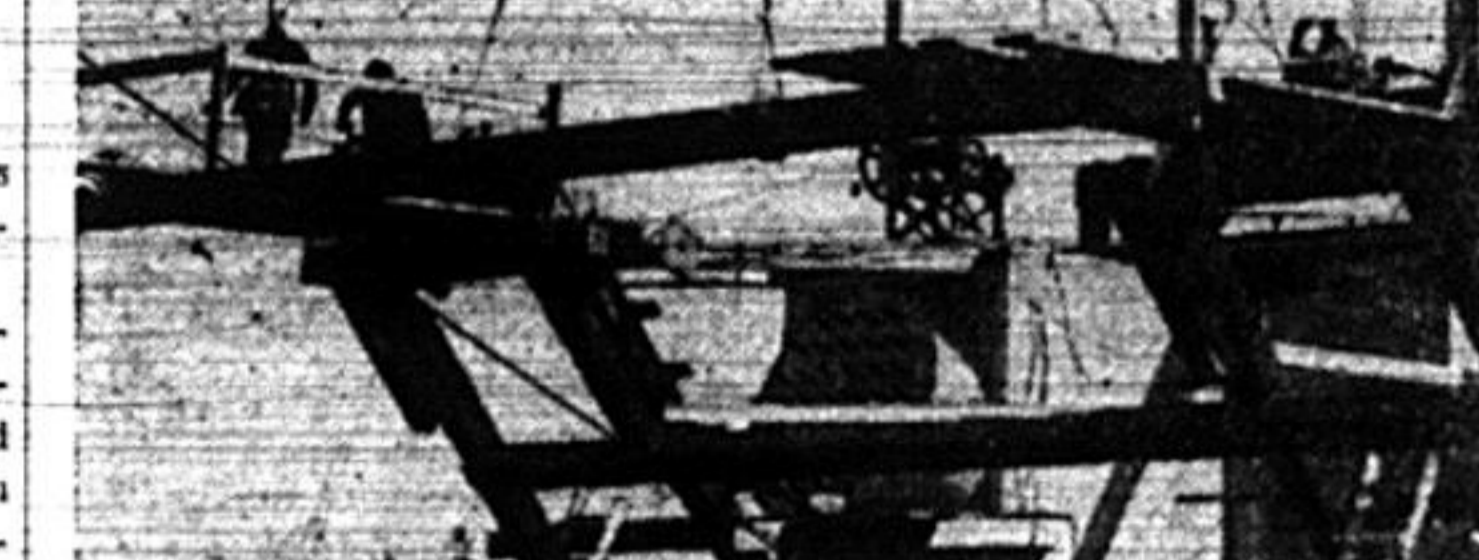
NOTES ON THE NEWS by Bill Jones '41

IN A SENSATIONAL move, the government last night froze steel prices at levels prevailing during the first quarter of 1941 to forestall a general upward price trend of other commodities "which would lead the nation in disastrous inflation."