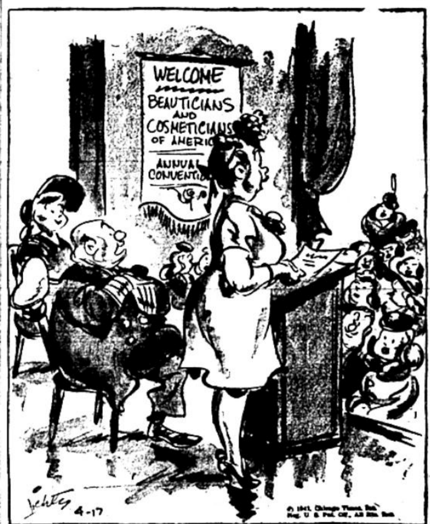
—and now Admiral Duffie, who kindly consented to address us on the subject of camouflage!