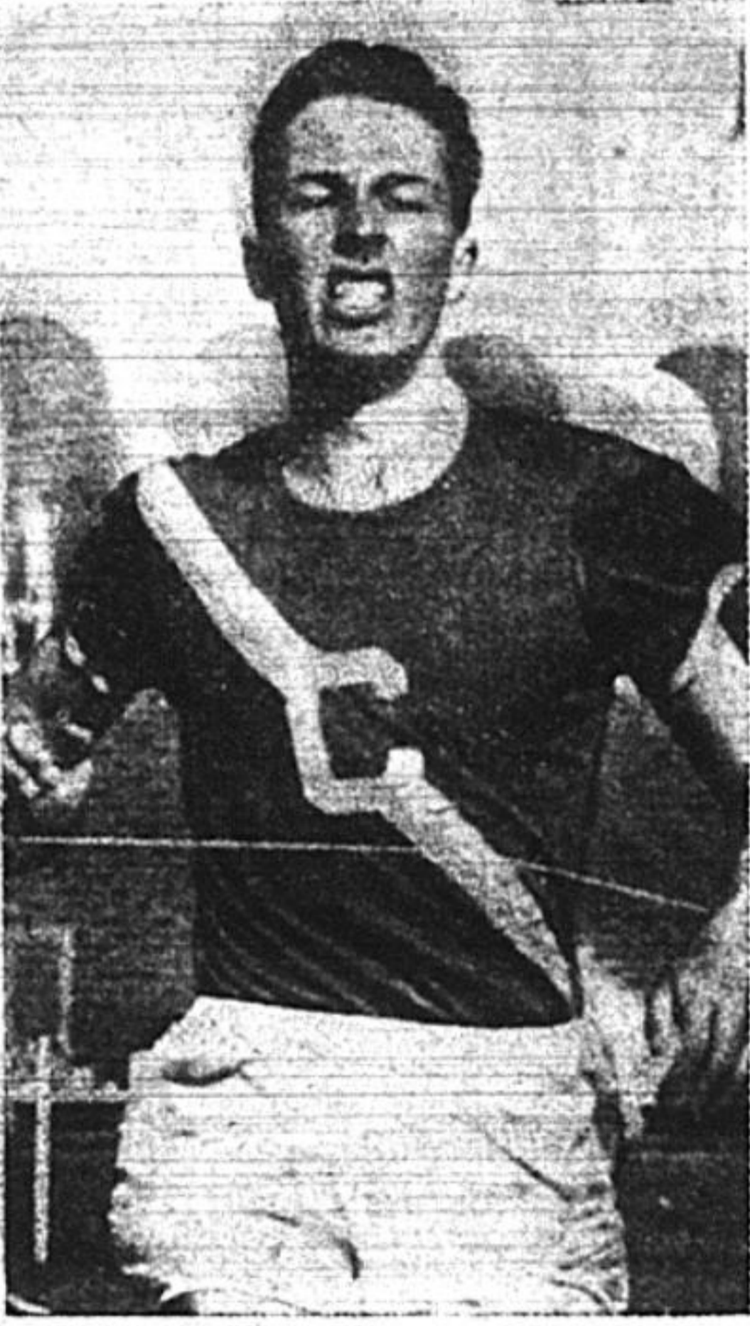
California, Here They Come!