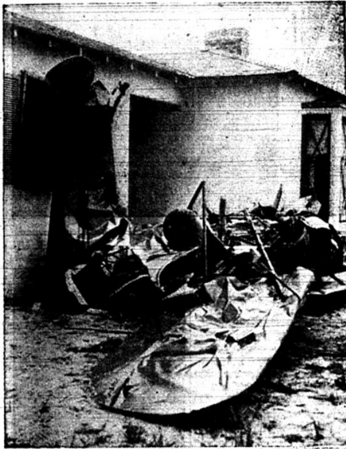
Two student pilots escaped with minor injuries when the motor of their light plane "conked" over a North Hollywood residential district, crashed, and attempted to dive through the window of a nearby house.