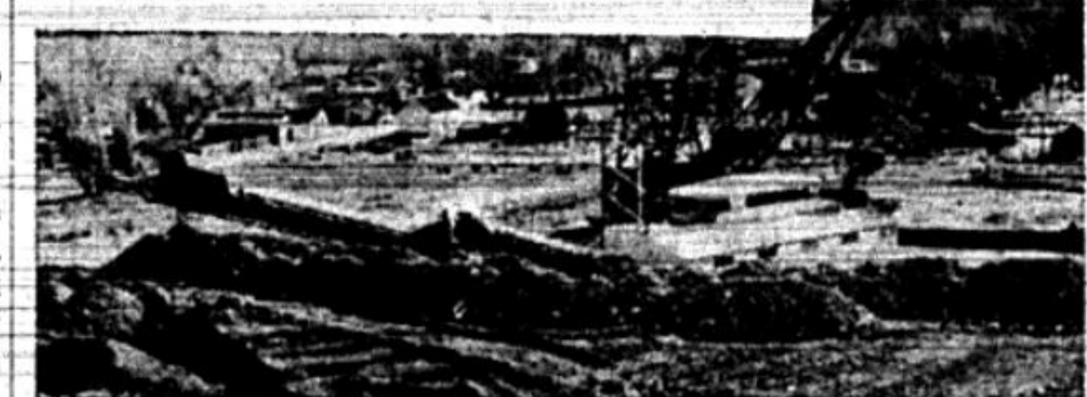
NOTES ON THE NEWS by Bill Jones '41

MORE government acts earned the headlines yesterday as the Administration sought to bring the nation more under centralized control.