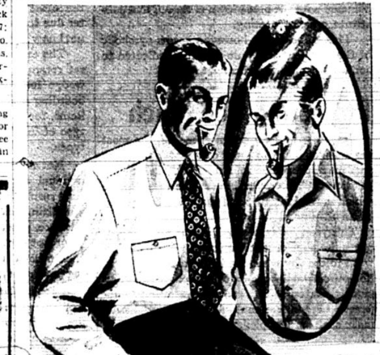
Sports Shirt Dressy Shirt