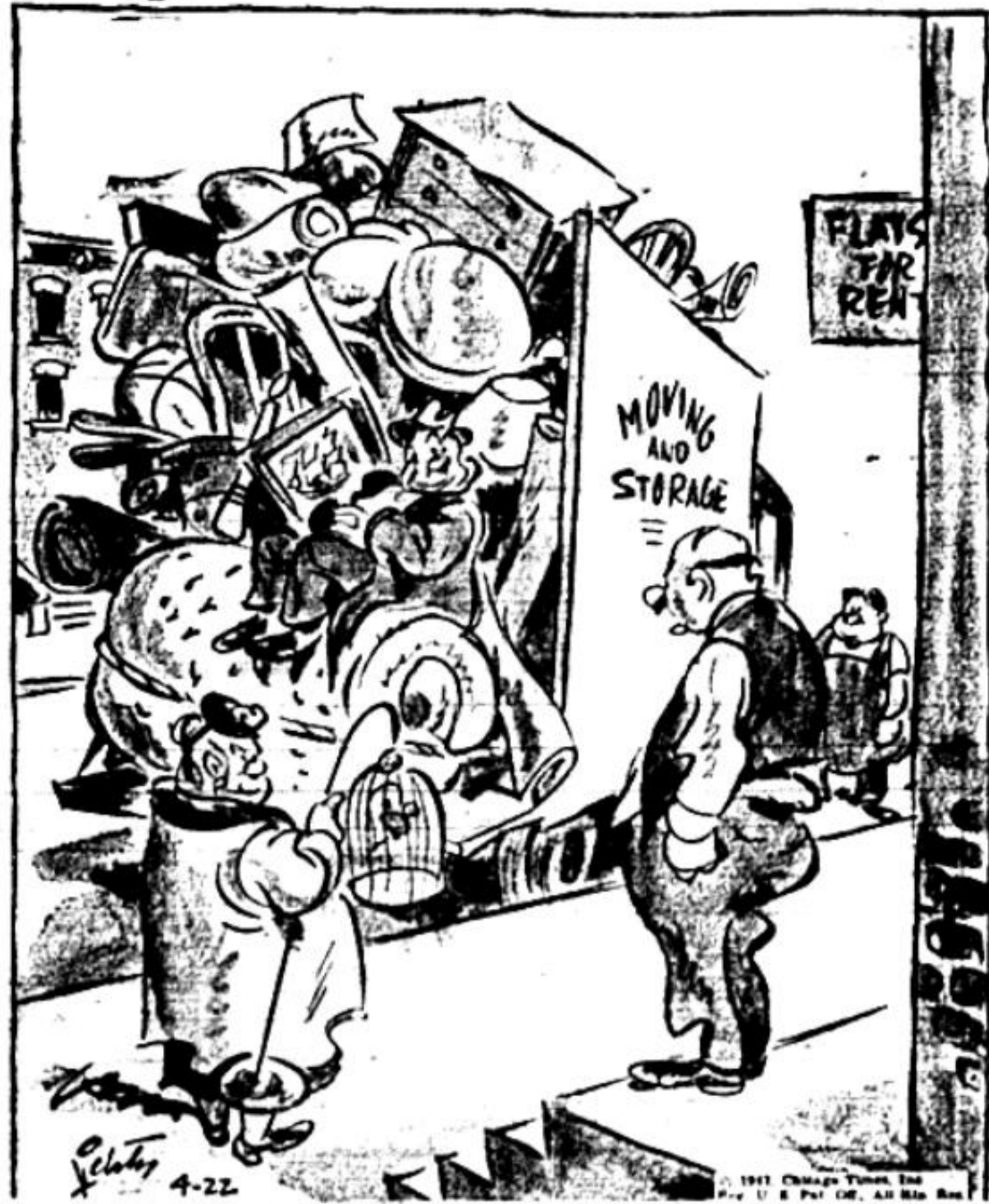
"Okay! You win—I'll paper the dining nook!"