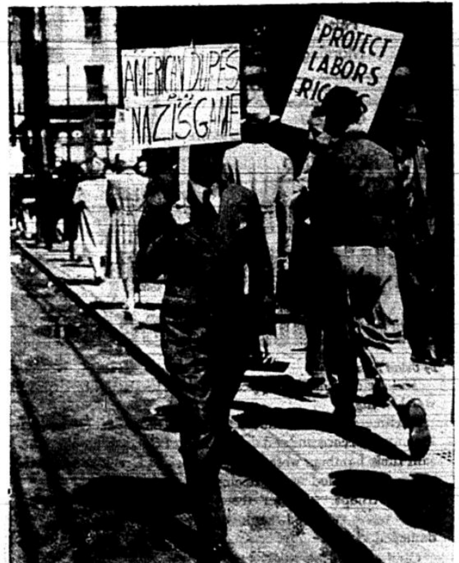
Proclaiming "American Dupes Play Nazi Game," a picket is shown above picketing members of the American Peace Mobilization group as they in turn picketed the San Francisco Chronicle. The latter has advocated navy convoys for arms-carrying U. S. ships.