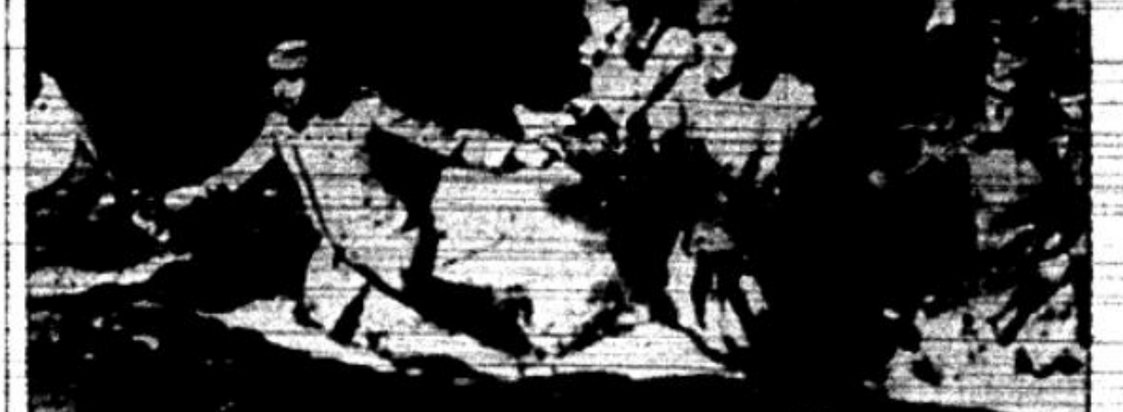
NOTES ON THE NEWS by Bill Jones '41

WITH even London admitting that British forces are facing overwhelming odds, observers are watching with interest to see how British soldiers can again make a rout in "Glorious Defeat." Along with the acknowledgment of imminent evacuation from Greece, came a very interesting intimation (passed by the British censor) that defeat in Greece might cause the American public to act with greater caution in their aid to Britain.