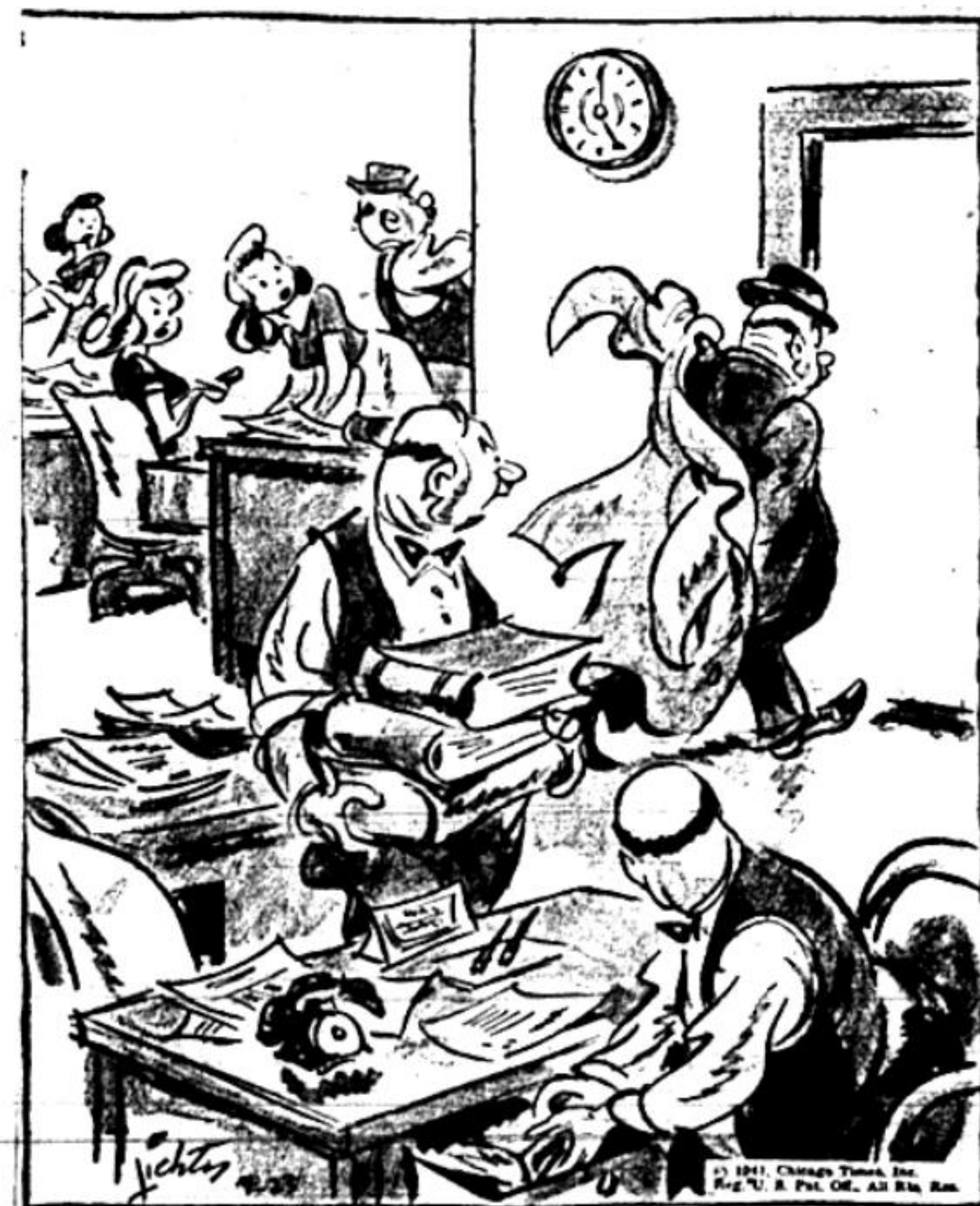
"That new efficiency expert is really good—he's first one out again, tonight!"