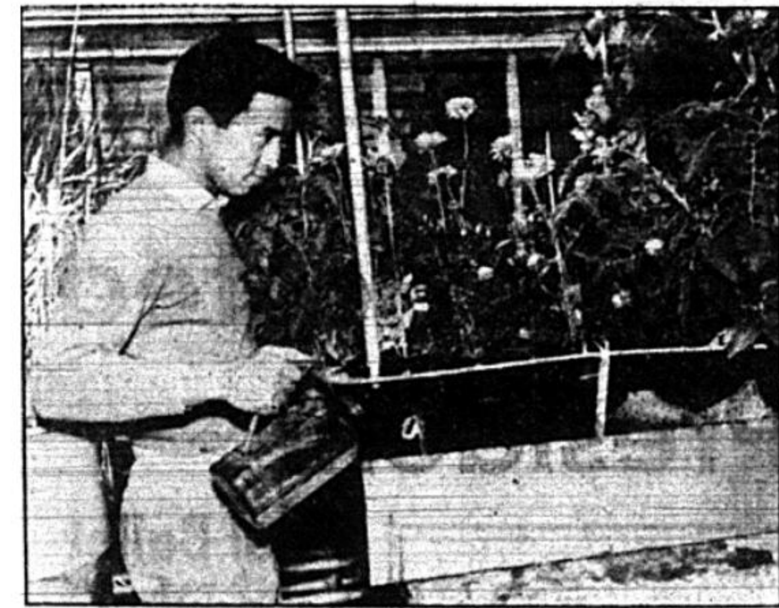
Plants grown in scientifically controlled solutions are tended by an NYA worker in the plant nutrition greenhouse. This water culture method is called hydroponics.