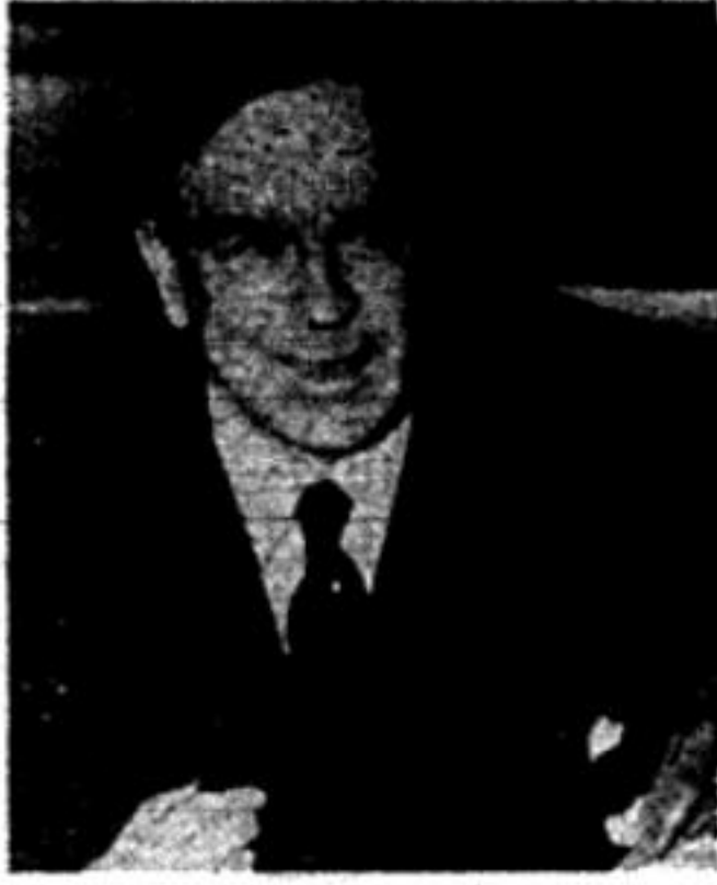
W. L. MacKENZIE KING, Canadian prime minister, who recently conferred with President Roosevelt.