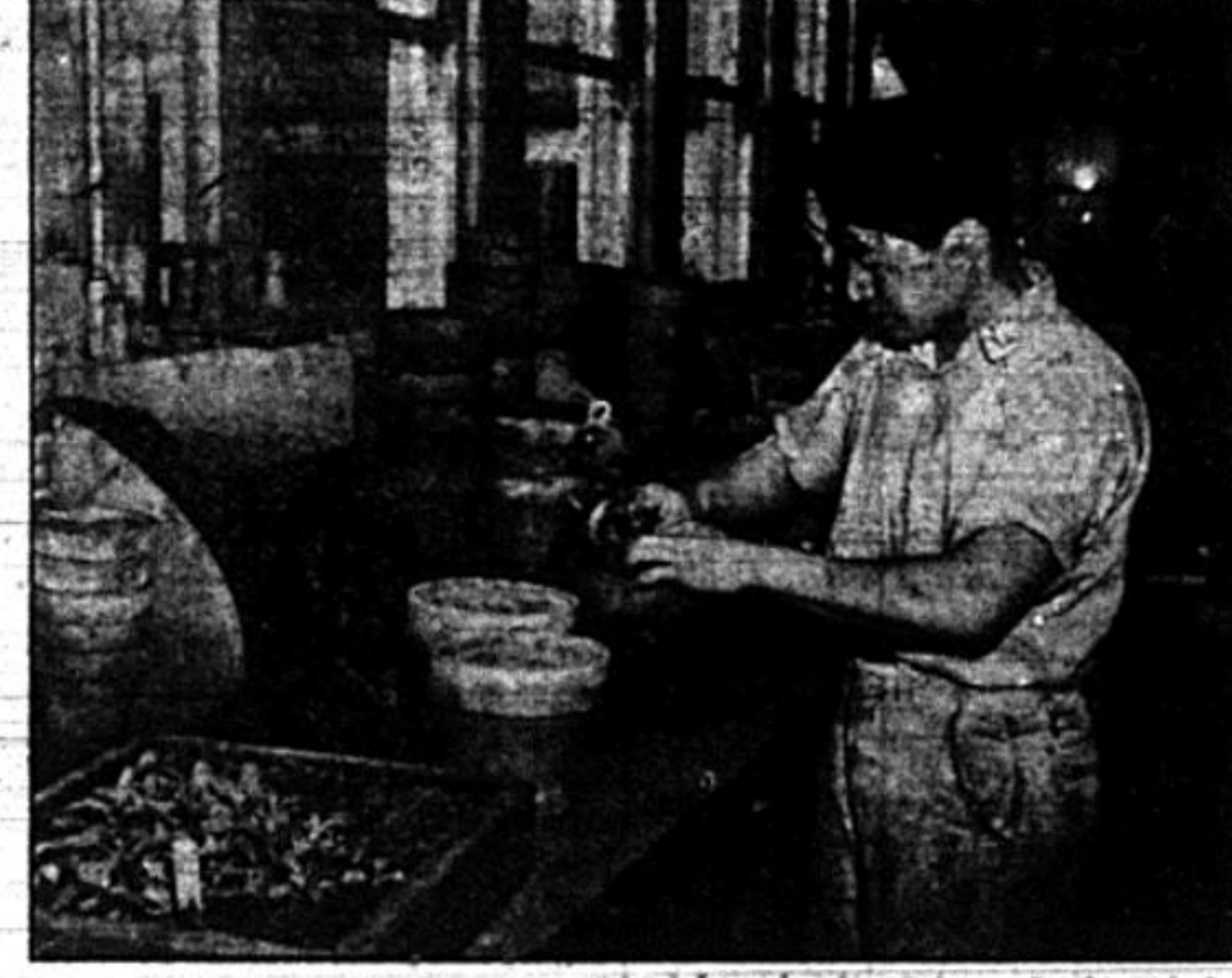
An NYA student worker is shown transferring calery plants from seed boxes to pots in the entomology headhouse. The plants are used for research on virus diseases.