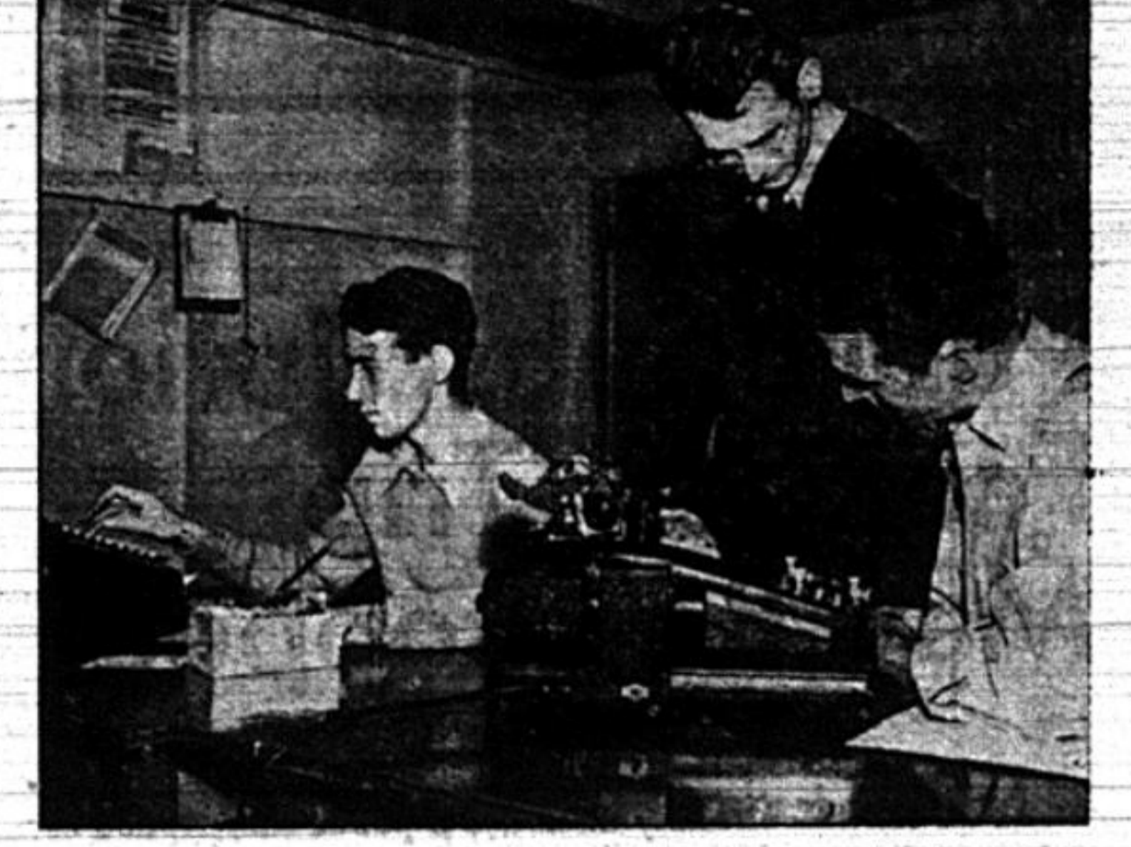
NYA students with calculators compile figures for a lumber logging and milling study directed by the USDA forest experiment station on the campus.