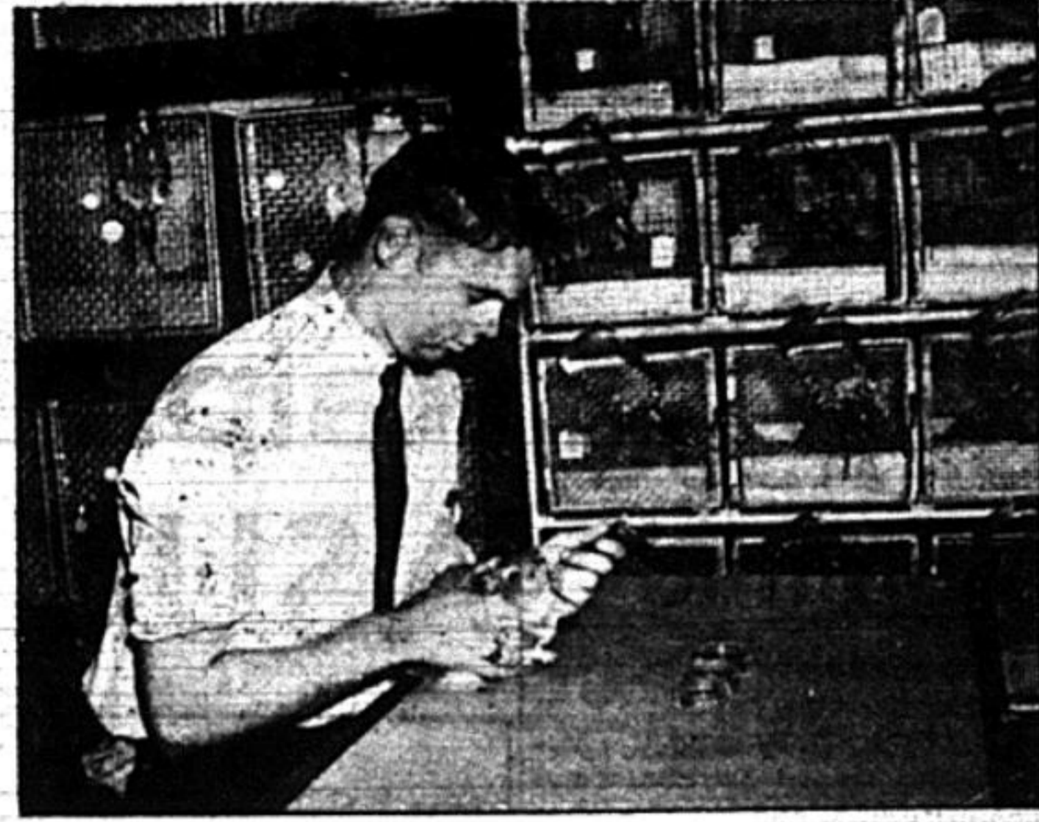
A guinea pig is given its afternoon cod-liver oil by an NYA worker in the home economics department. The animals are used in nutrition experiments.