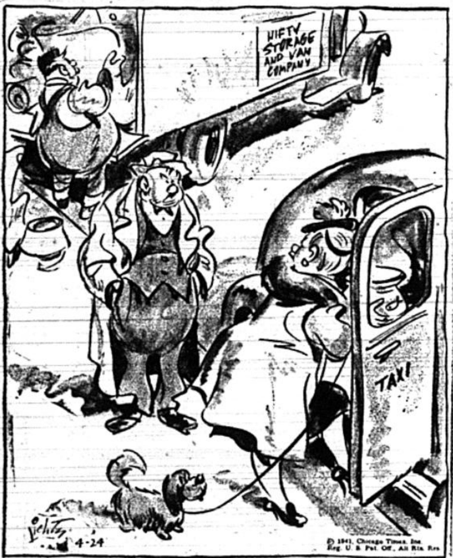
"I'm taking the valuable things in the taxi—you can ride with the movers!"