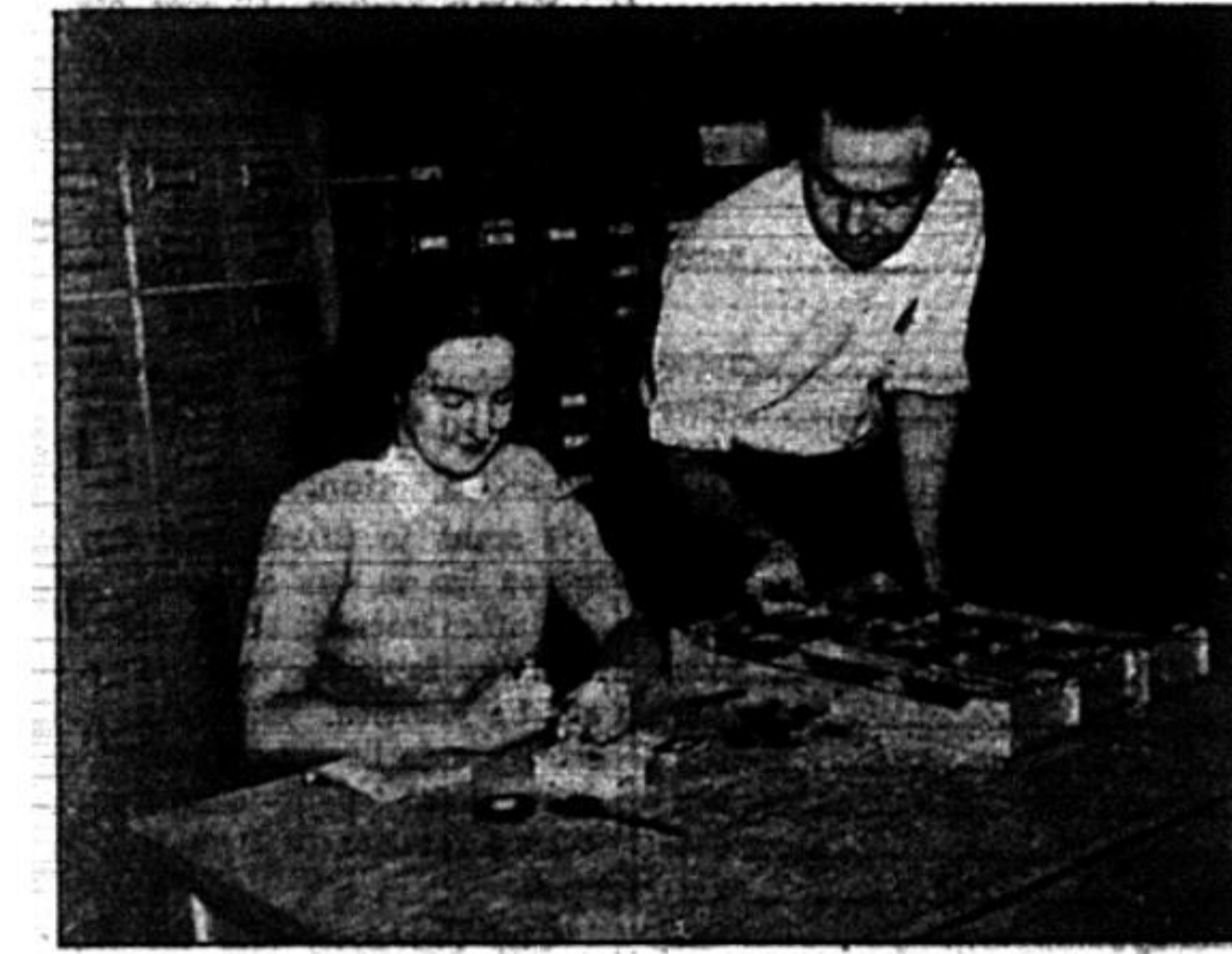
NYA workers in a slide-making project mount reproductions of famous works of art for use in University classes and art appreciation lectures.