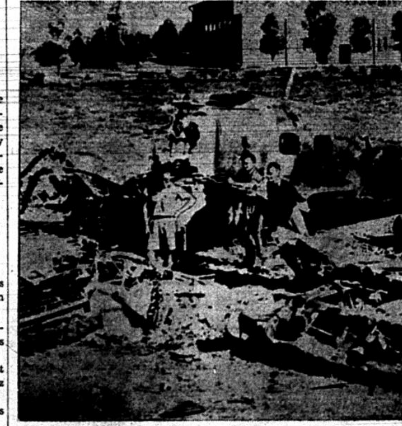
Here's the first picture to reach the United States indicative of Germany's participation in the war in the desert—a German bomber downed by RAF fighters "somewhere in Africa."