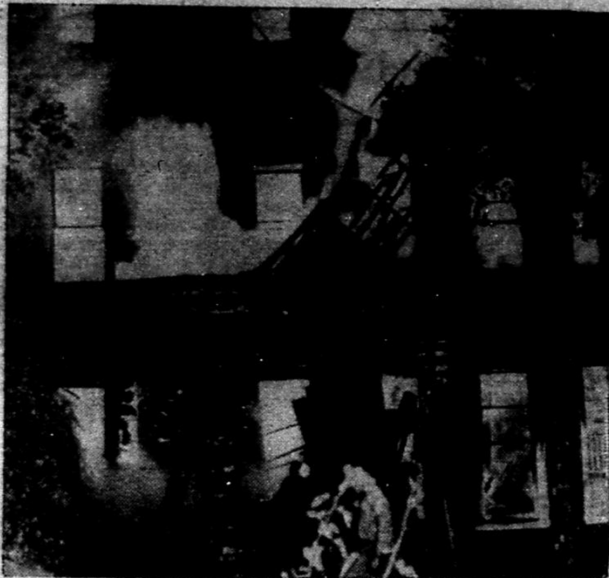
A veteran was burned to death and nine persons were injured in a two-hour blaze at Piedmont lodge, 2240 Piedmont avenue early Monday morning. Police believe the fire might have been started by a carelessly thrown cigarette.