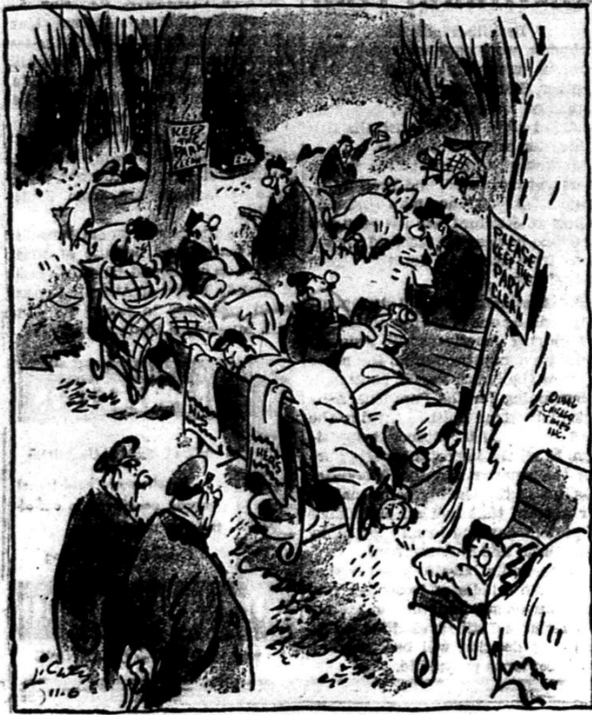
"It's the same old stuff every night. Arguments about who got the biggest profit from the sale of their houses!"