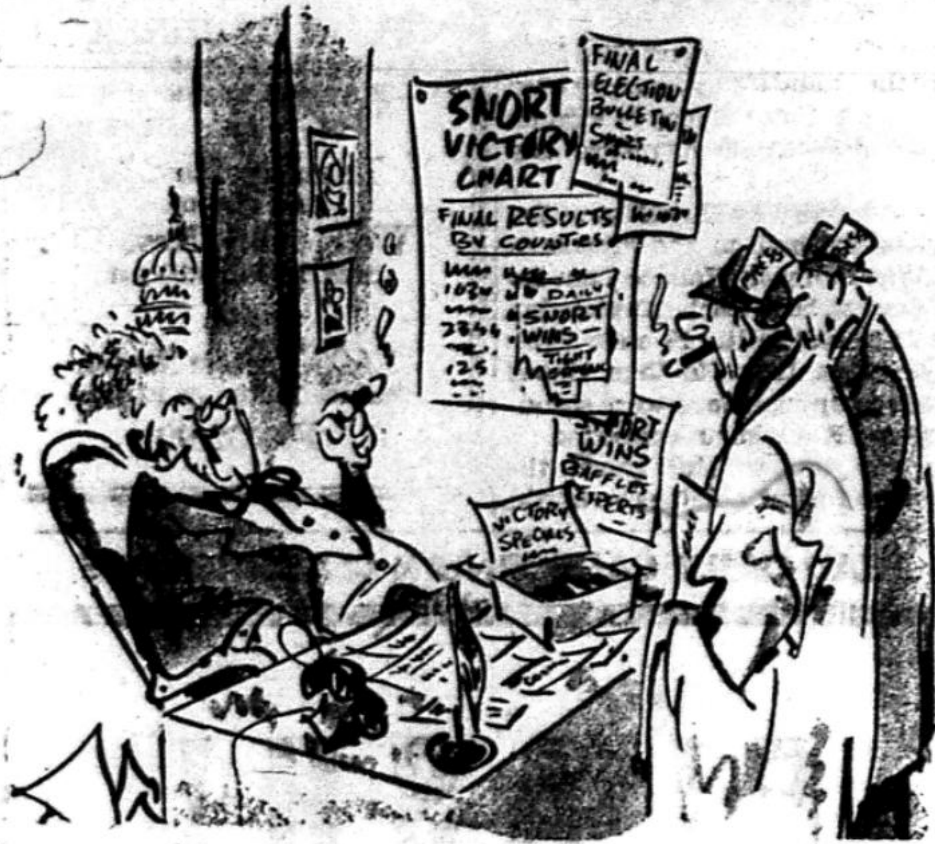
"In the interest of national unity, I shall drop my investigations of un-American activities of everybody who voted against me!"