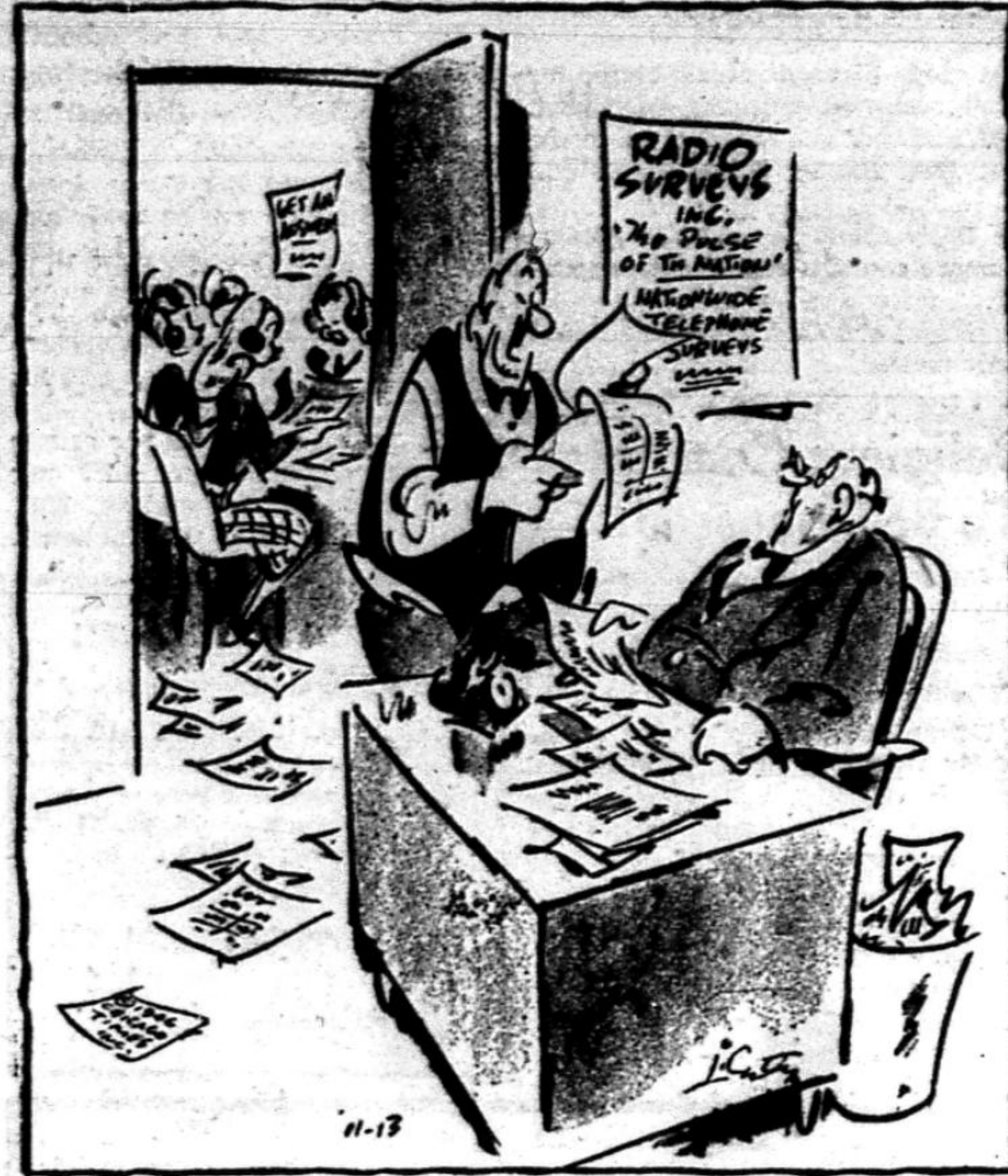
"Our latest survey shows 11% of the men were listening to the sudsy wudsy hour, 8% were listening to the Hosanna Herring program—and 81% were listening to their wives!"

Republican Sen. Joseph H. Ball's statement yesterday that he would have legislation prepared to outlaw the closed shop and secondary boycott when the new Congress convenes in January appears only the first step of many to come in the undoing of hard-earned legislation favorable to labor.