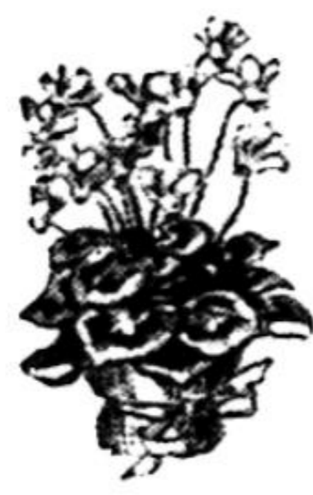
(Sorry no phone yet)

LIPSTICK ROGER & GALLET Perfume • Dry Perfume • Lip Aids • Toilet Soap