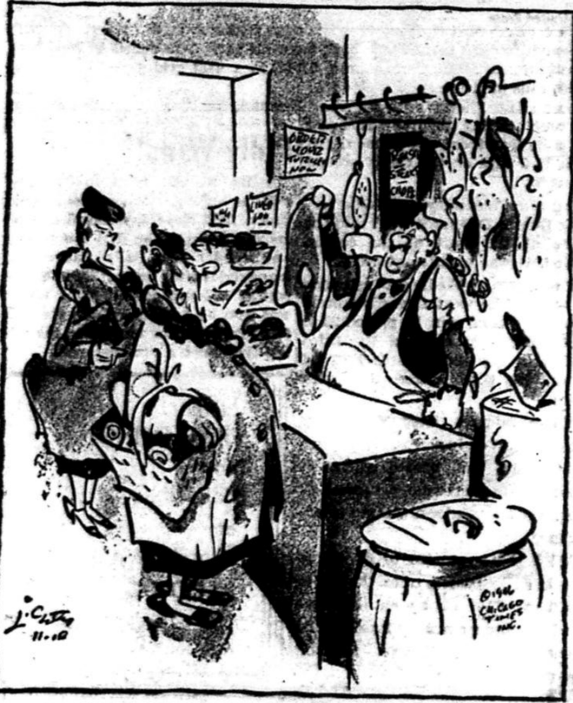
"Well! Are you selling it or holding it for ransom?"