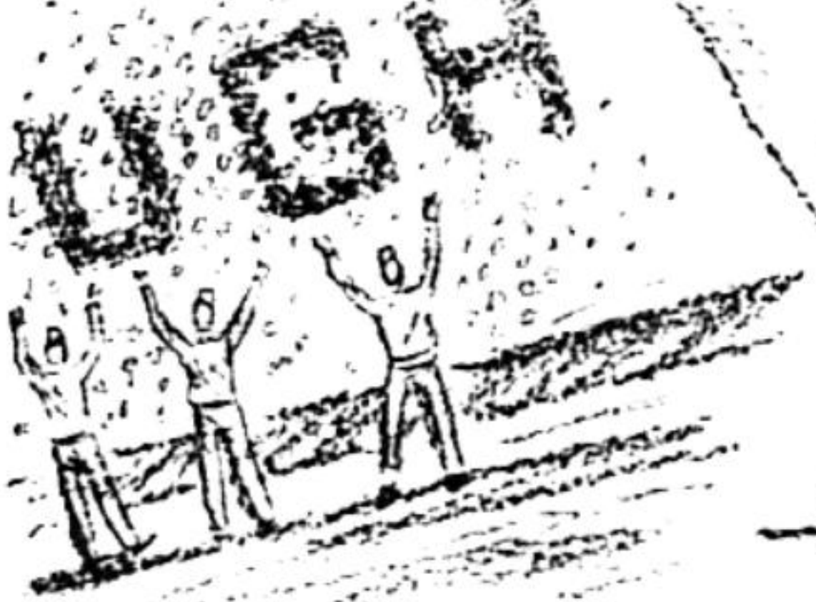
PAGE RIPLEY! 17,000 ROOTERS WEARING WHITE SHIRTS

what a game...the first since '41 and wow! what a time. Yep, we moore scouts were present at Saturday's Grid Classic and frankly had a heck of a lot more fun watching the rootin' sections, alumnae and stray spectators than the score board... (e.g. these on-the-spot sketches) And the darndest thing...some of the best dressed were Moore attired. We know---- we peeked at the labels!!