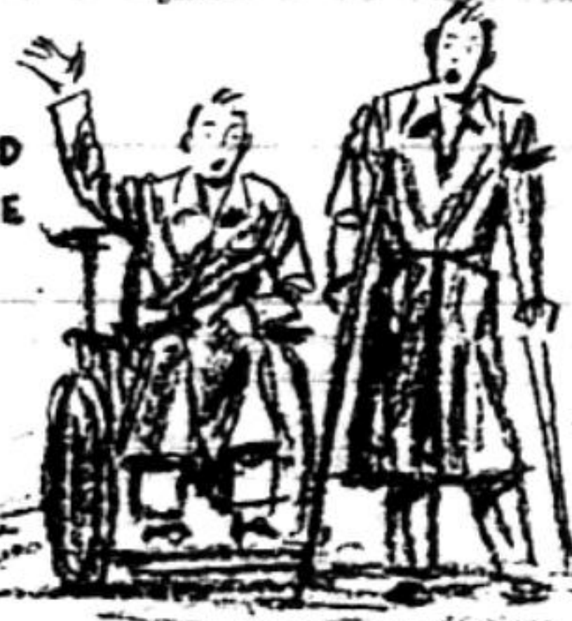
BEST DRESSED GEES AT GAME IN MAROON ENSEMBLES