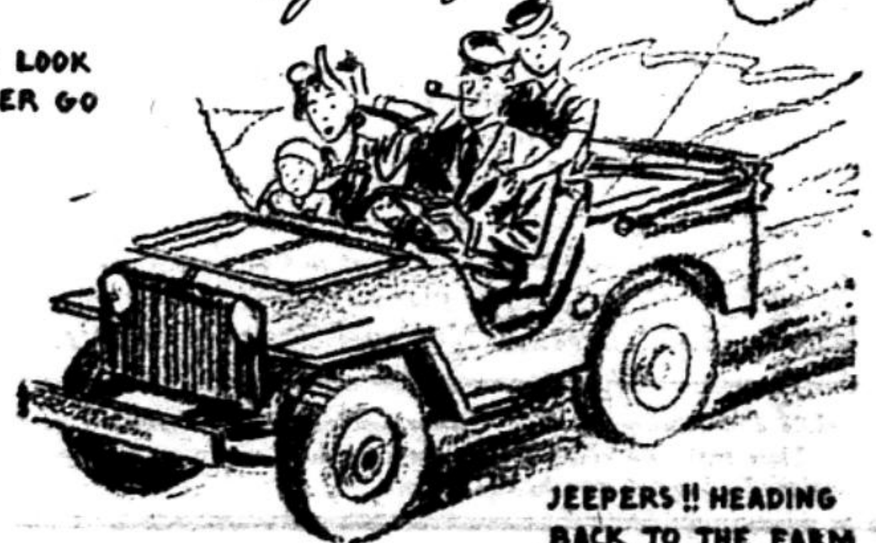
JEEPERS!! HEADING BACK TO THE FARM