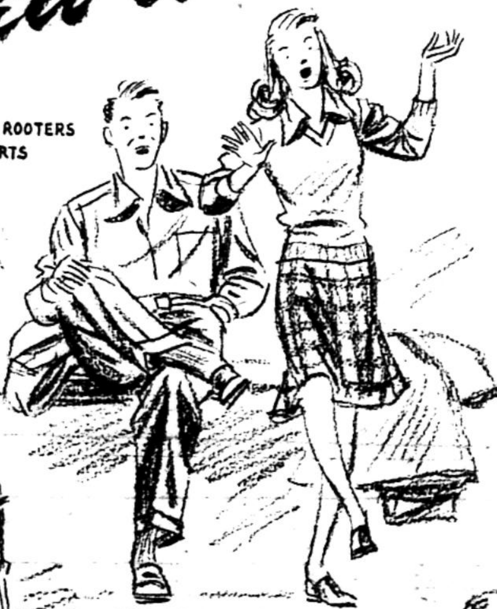
BEAR GET-TOGETHER. HERS IS MOORE'S SAFETY PIN SKIRT.