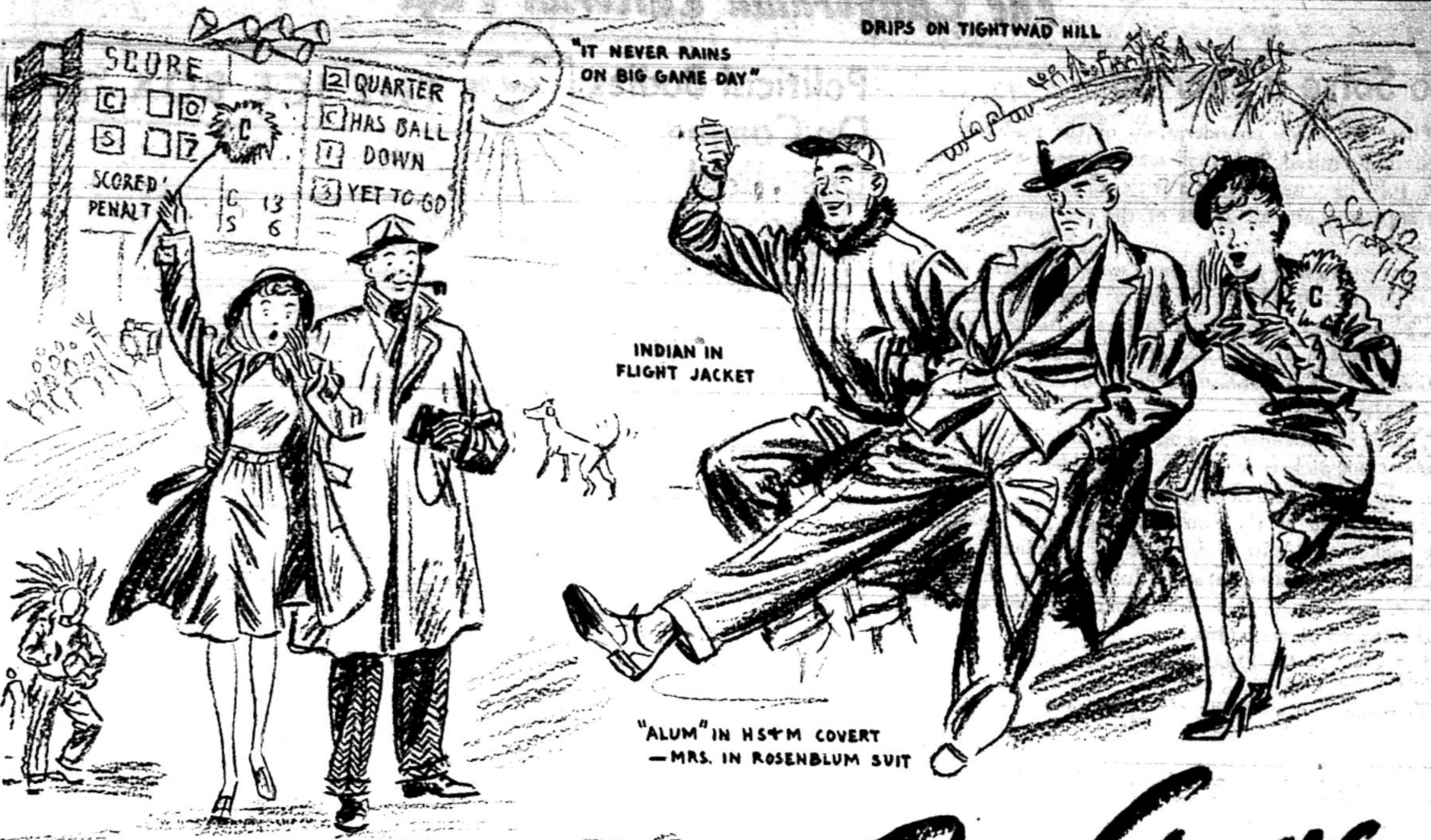
"IT NEVER RAINS ON BIG GAME DAY"