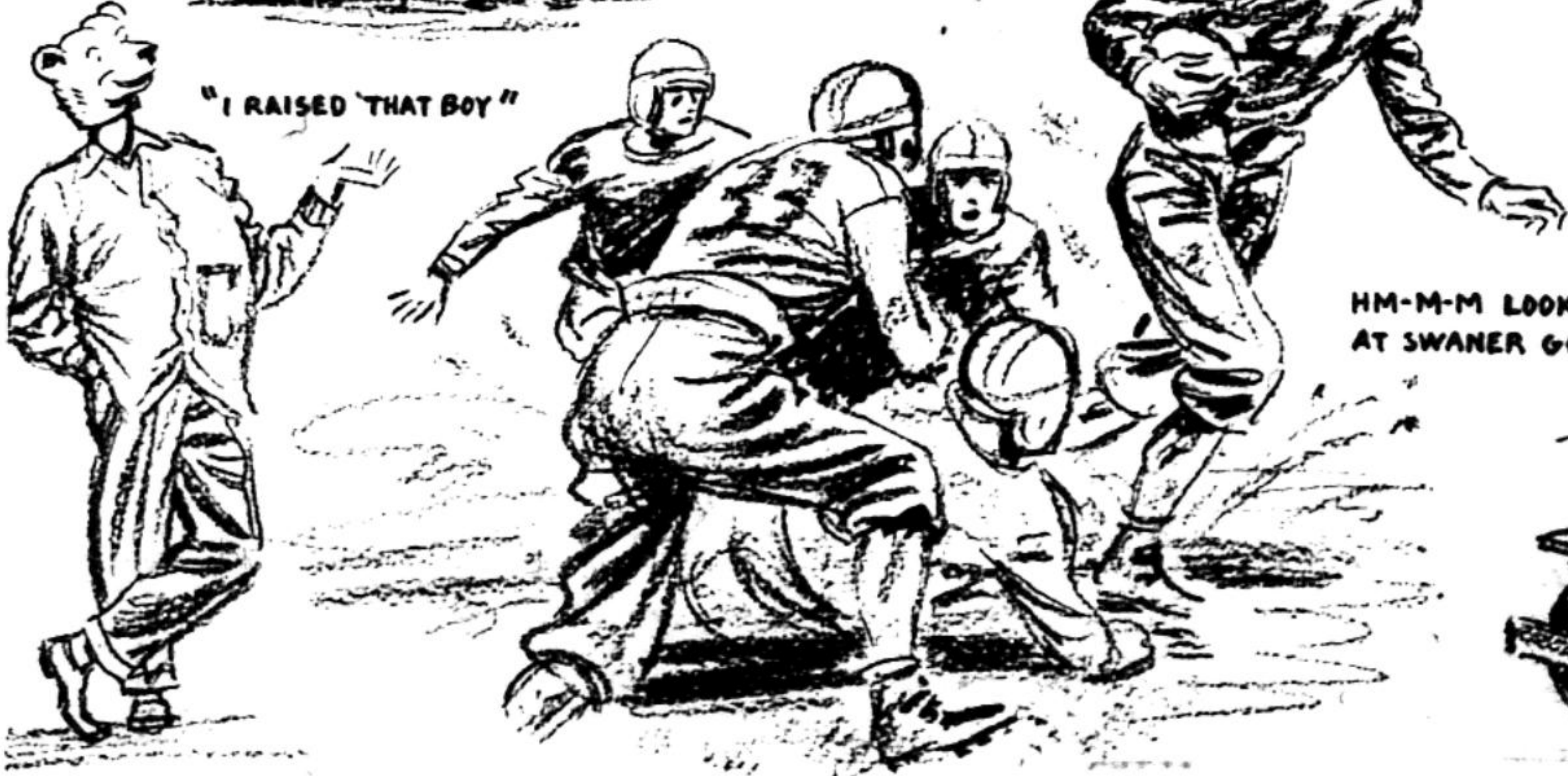
"I RAISED THAT BOY"