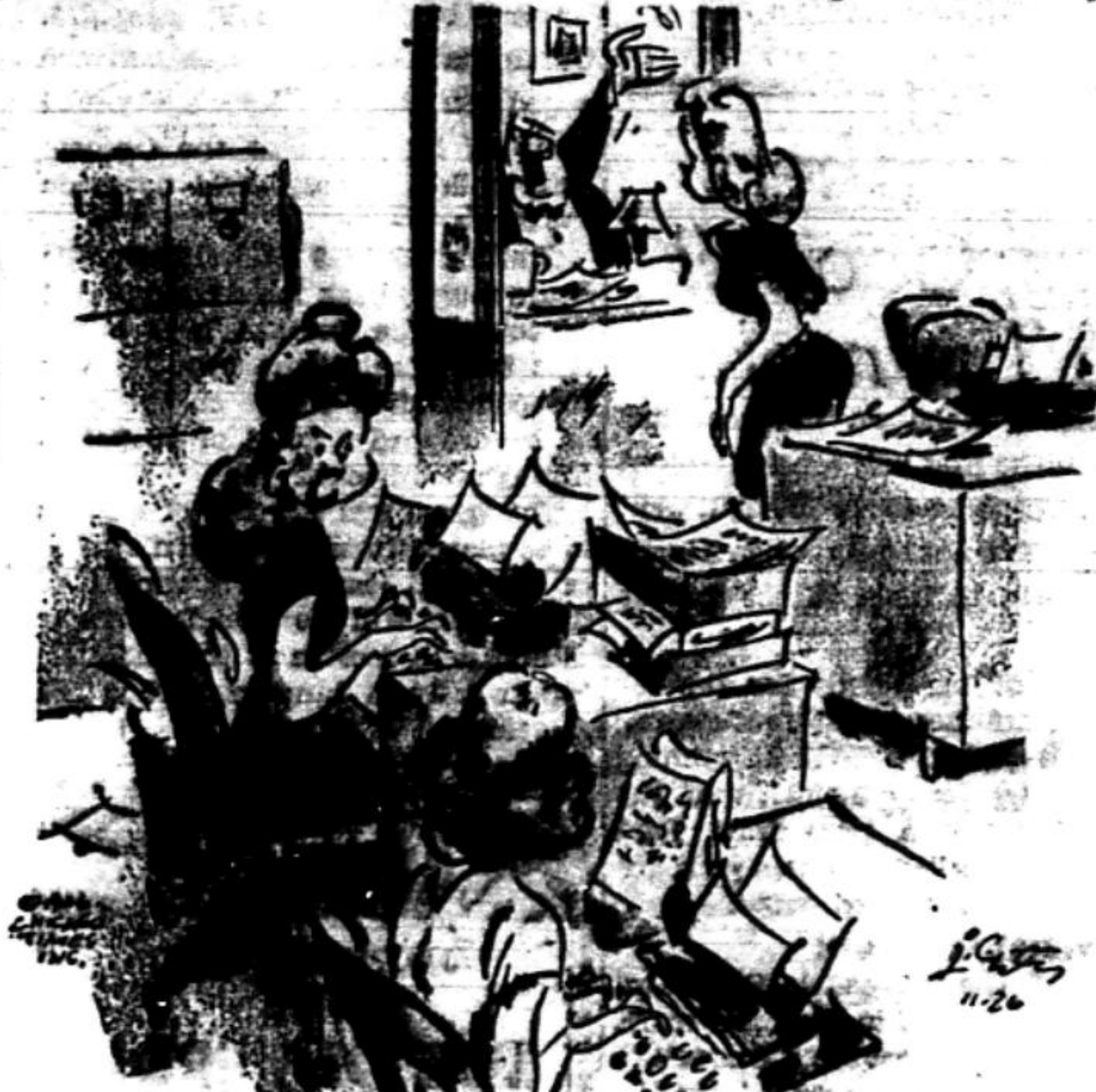
"It's too bad the OPA folded up. Now the boss is back to blaming everything on us!"