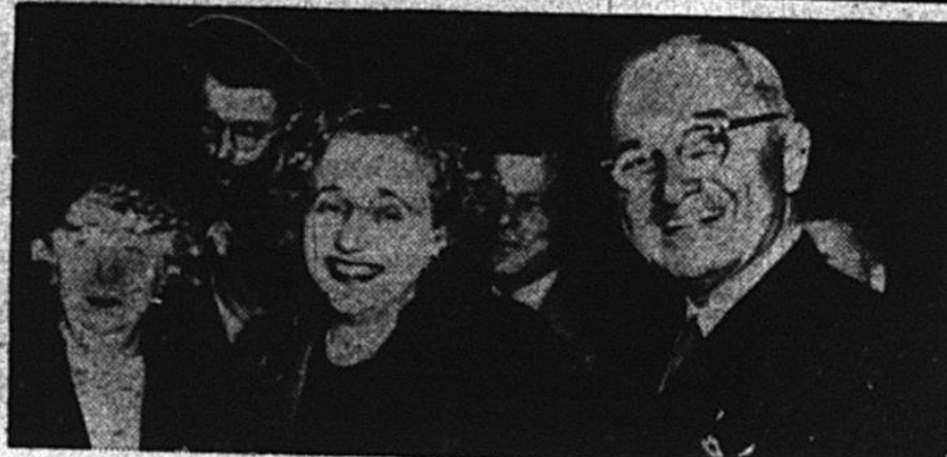
PRESIDENT TRUMAN, MRS. TRUMAN and MARGARET smile confidently as they cast their ballots in their home precincts in Independence, Missouri. (For election news, see pages 2 and 3; for campus comment, see pages 5, 8 and 9).