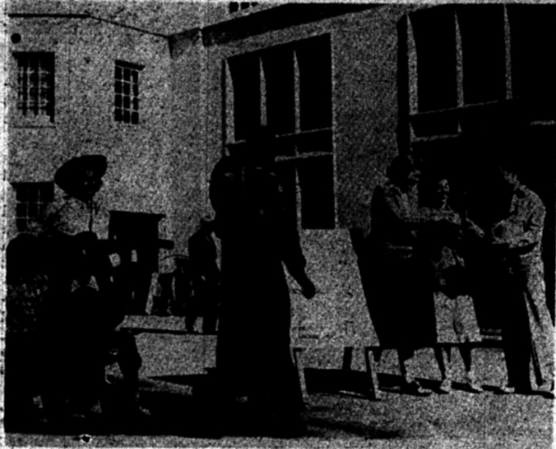
In order to boost tonight's "Forty-Niners' Fiesta," seniors give entertainment preview and sell tickets in Eshleman court. (See story below.)