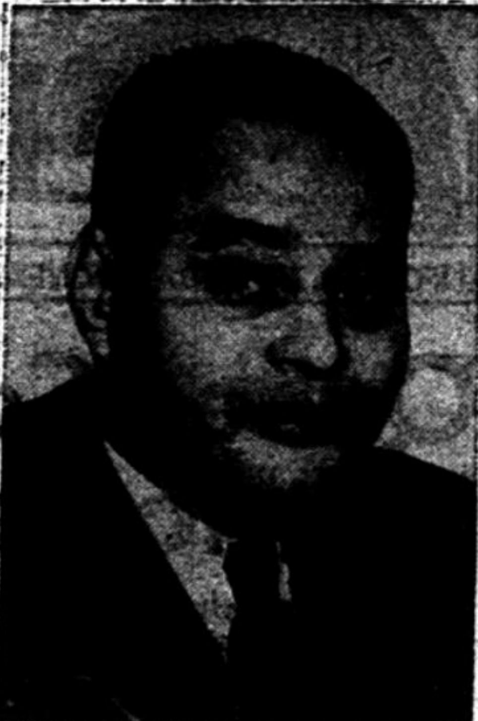
RALPH J. BUNCHE Palestine plan studied.

Semi-official dispatches claimed government successes on both the east and west flanks of the battle for Hsuehchow. Government General Huang Pao-Tao reportedly routed five Red columns east of the city.