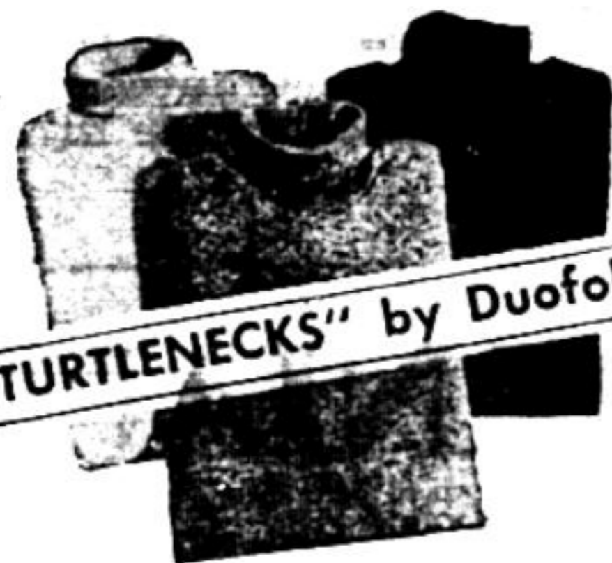
"TURTLENECKS" by Duofold

The central vacuum system at the Comb & Scissors, the first of its kind in Berkeley. I swear! It's the equivalent of a dry shampoo. Goodbye itchy feeling.