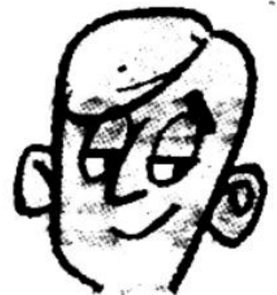
"I'm In Orbit"

Bowling equipment is available at 30 per cent discount during our inventory close out.