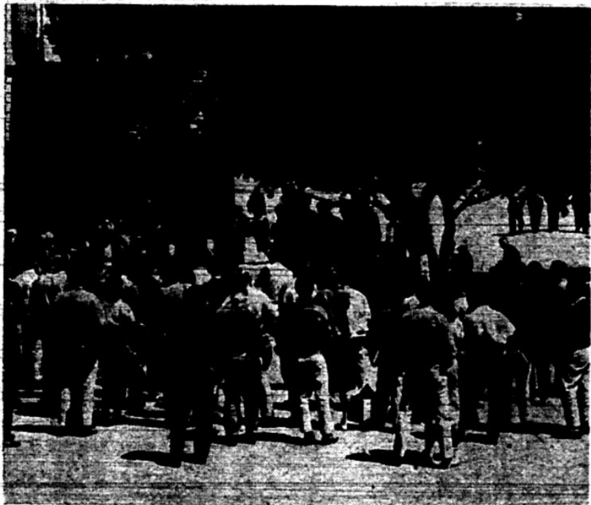
Dwinelle Plaza, campus rally center in the days before Hyde Park was established.