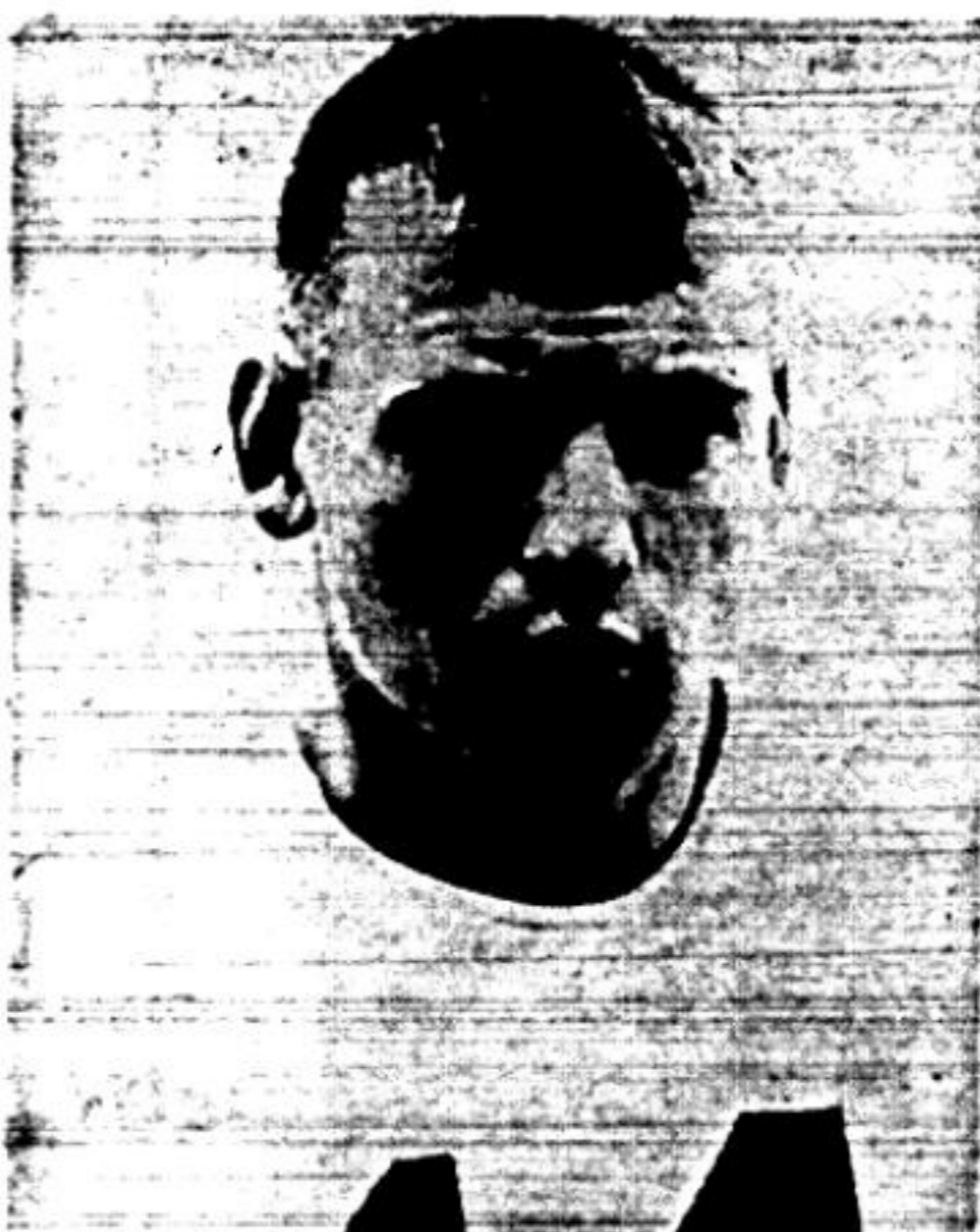
JIM TRAFICANT . . . intrepid Pitt QB