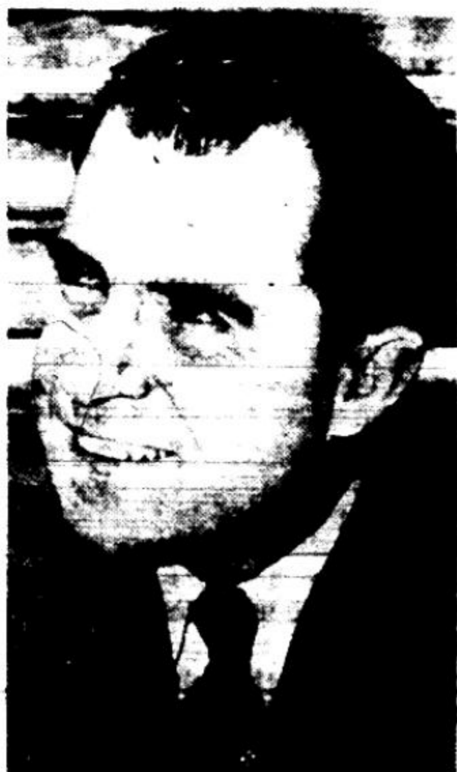
RICHARD M. NIXON