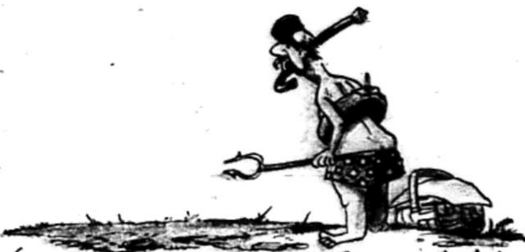
This would not help make you NATO-minded!

1444 was, incidentally, notable for many other things. It was, for example, the year in which the New York Giants played the Philadelphia Athletics in the World Series. As we all know, the New York Giants have since moved to San Francisco and the Philadelphia Athletics to Kansas City. There is a movement afoot at present to move Chicago to Phoenix—the city, not the baseball team. Phoenix, in turn, would of course move to Chicago. It is felt that the change would be broadening for residents of both cities. Many Chicago folks, for example, have never seen an iguana. Many Phoenix folks, on the other hand, have never seen a frostbite.