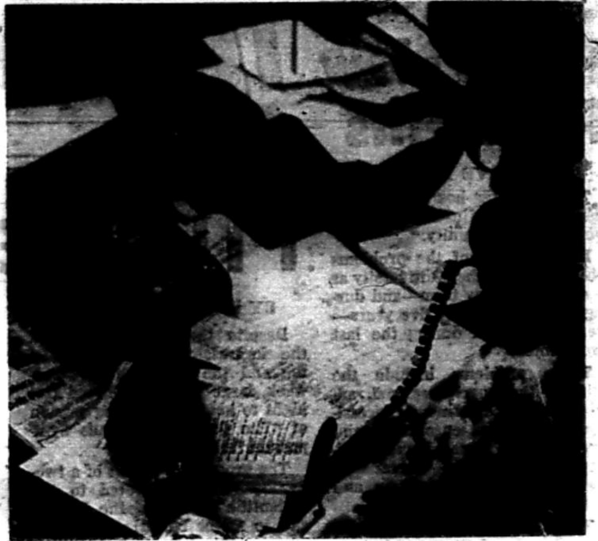
DING DING DING DING DING? Next, a hot line to Moscow?

SAN FRANCISCO STATE COLLEGE SAN FRANCISCO