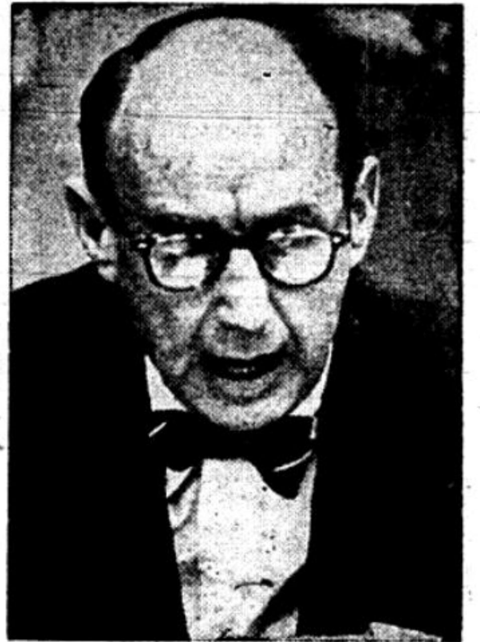
ADLAI STEVENSON To appear with U Thant

Following his speech he was honored at a luncheon arranged by members of the University political science department.