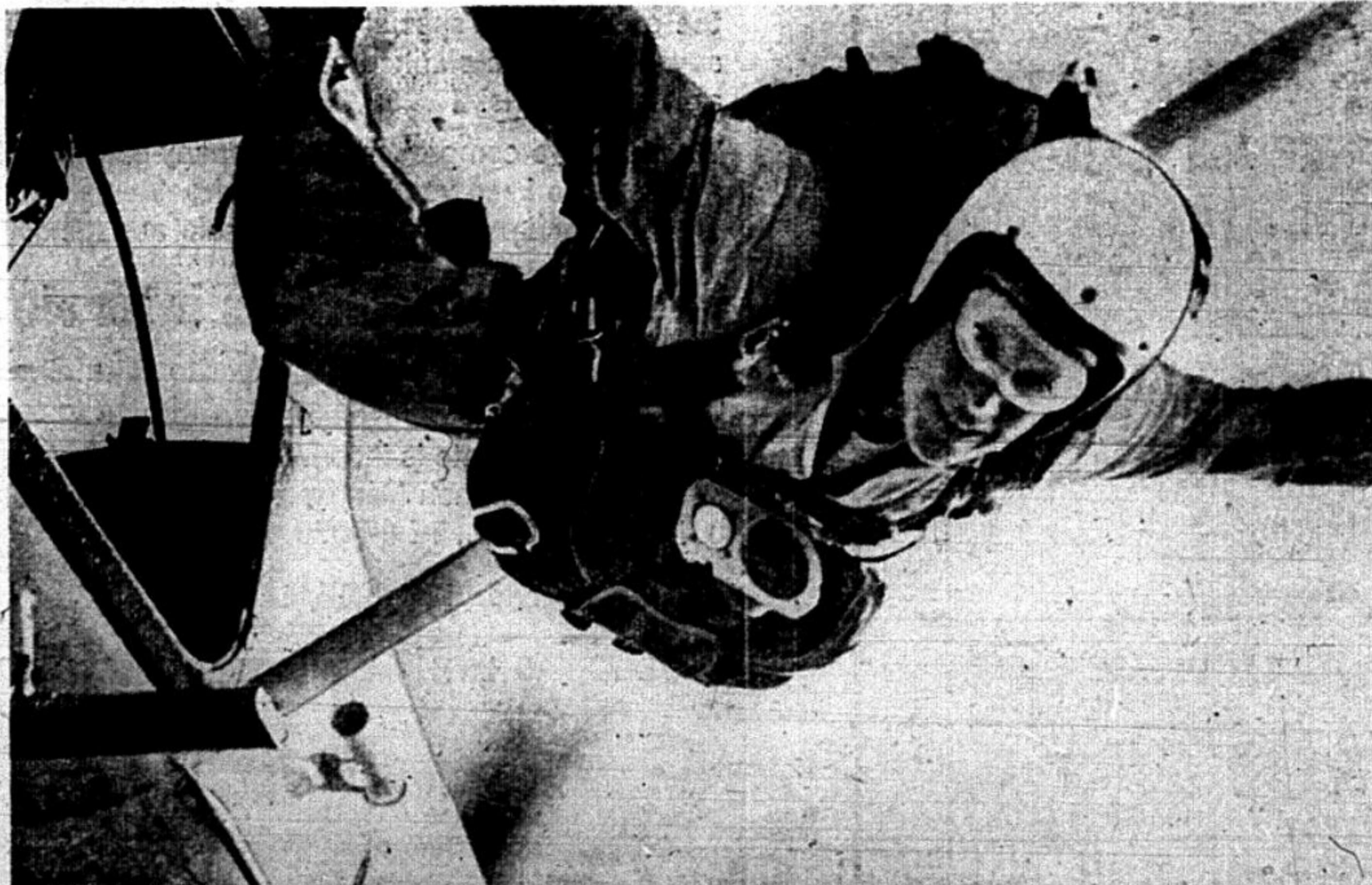
AWAY HE GOES . . . A California skydiver leaps into space.