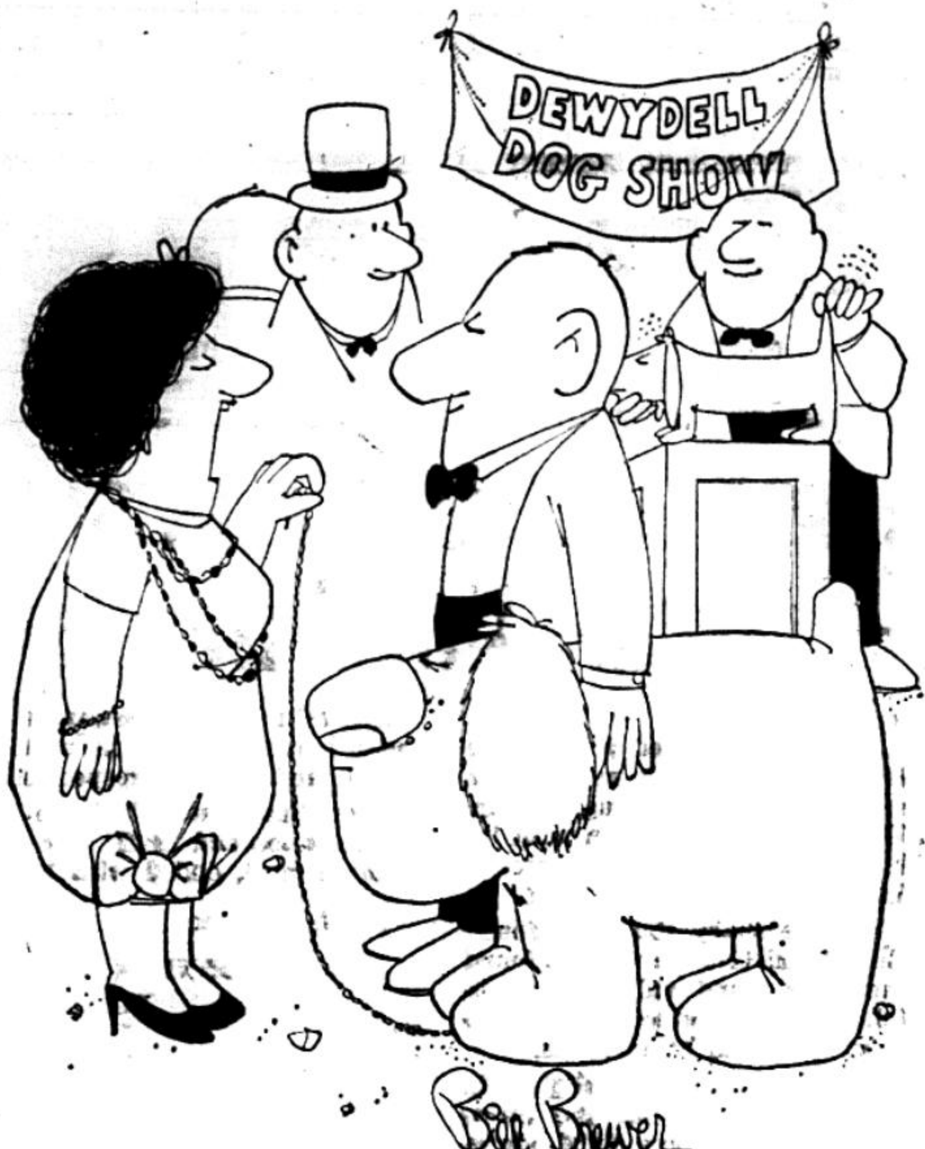
"Your dog is standing on my dog."

As a University student, Brewer drew cartoons for almost all campus publications. He was on the editorial board of the Pelican, campus humor magazine. Tomorrow's Pelican contains a three page story on Brewer with some original cartoons sent to them especially for the current edition.