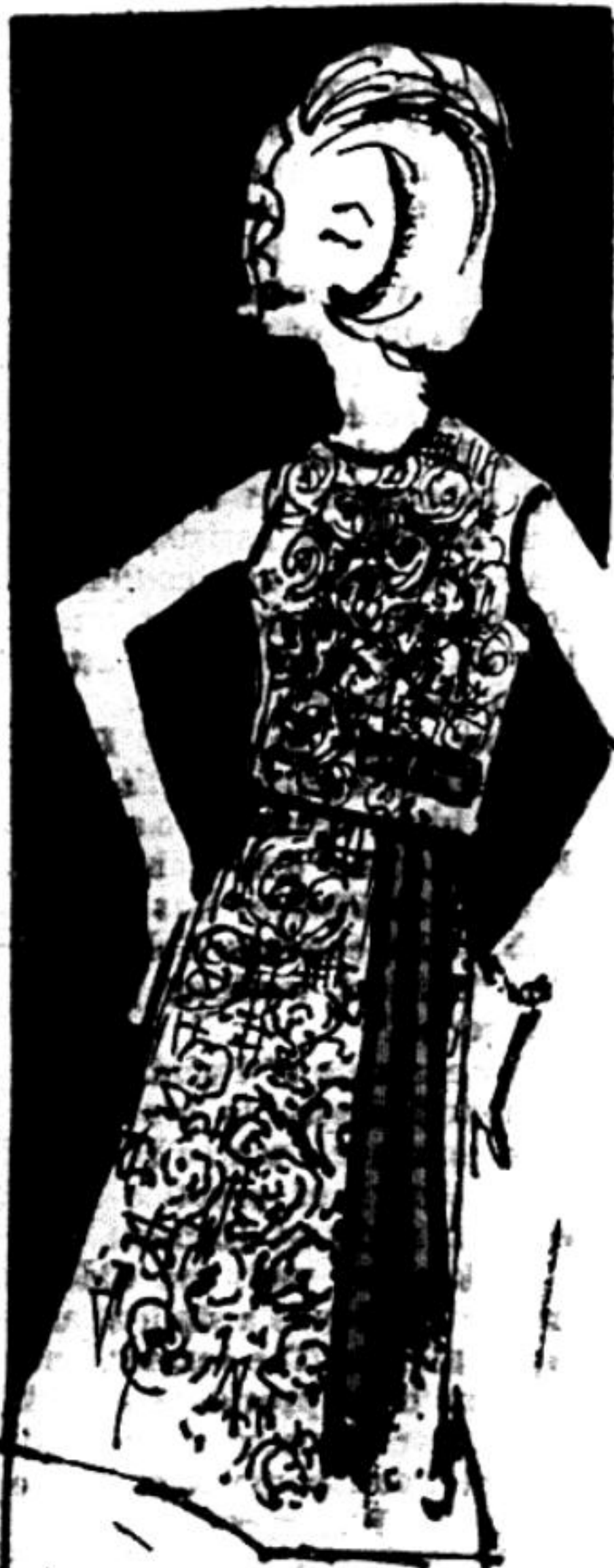
cotton lace 5 to 13 $26

Thirteen scientists from other branches of the University also received awards.