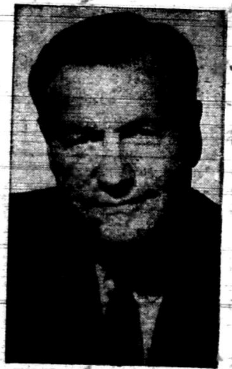
GOV. NELSON ROCKEFELLER On the hustings

"One strategy for primaries—the write-ins—offers the maximum possibility of gain with the minimum possibility of loss. If a candidate gets virtually no votes, he can easily explain this by saying that he did not campaign and that it is difficult for people to write in names. If he receives 10 per cent of the vote, he can't (Continued on page 8)