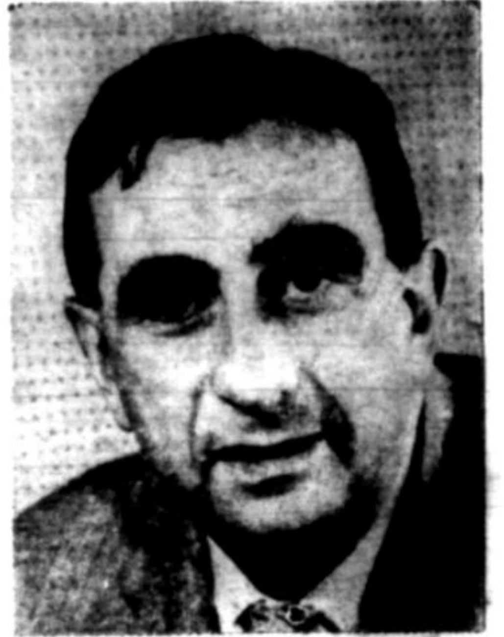
EDWARD TELLER "No comment"

Present stocks of radioactive cobalt are still considered grossly inadequate for such a plan, warfare.