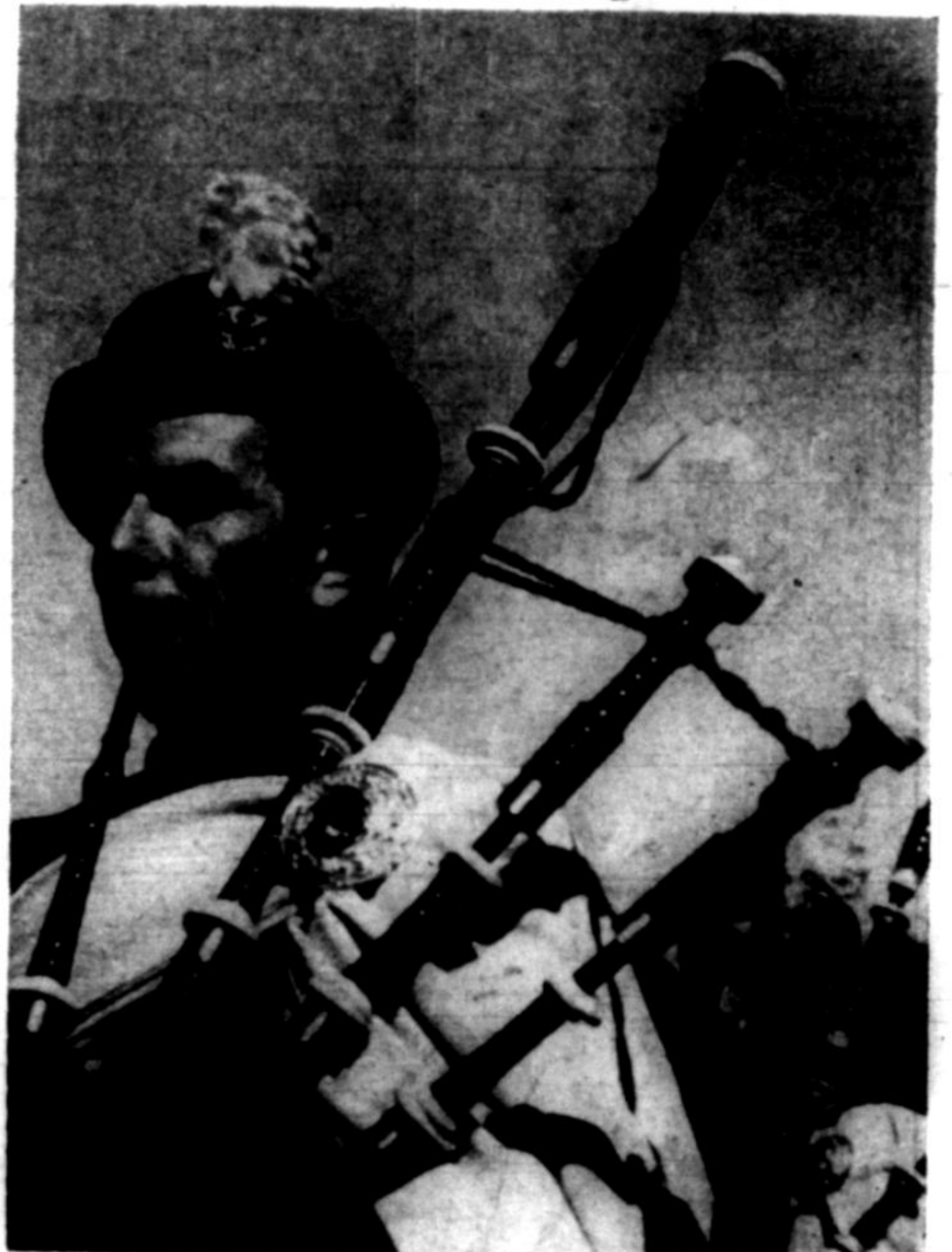
ERIN GO BRAGH? . . . these Irish Bagpipers will perform at 8 p.m. tonight in front of the Student Union as part of International Week festivities. For more on I-Week, see page eight.

of Chinese and other Oriental students to Russian Universities since the 1950's.