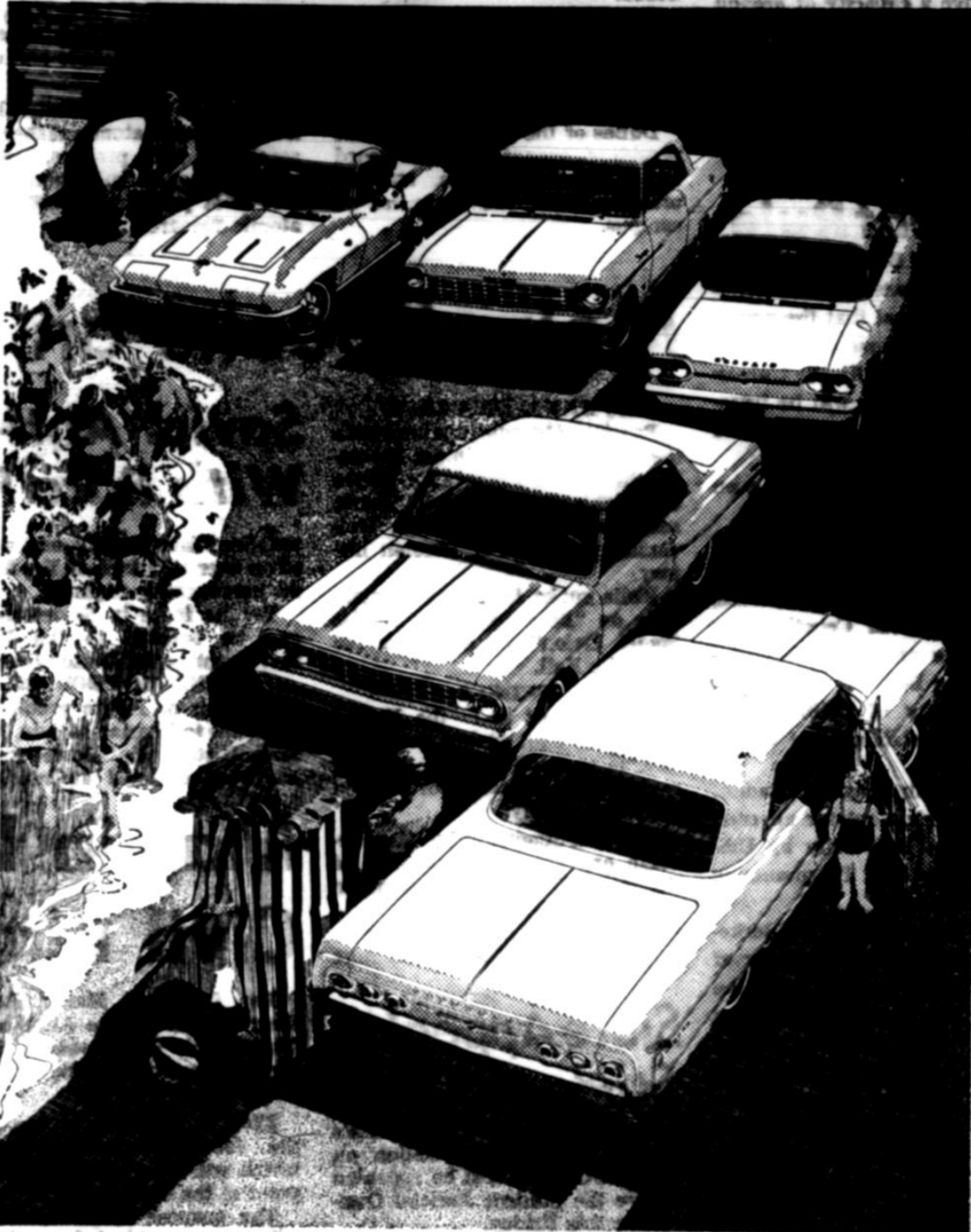
Sport Coupes above: Corvair Sting Ray, Chevy II Nova, Corvair Monza, Chevelle Malibu, Chevrolet Impala.