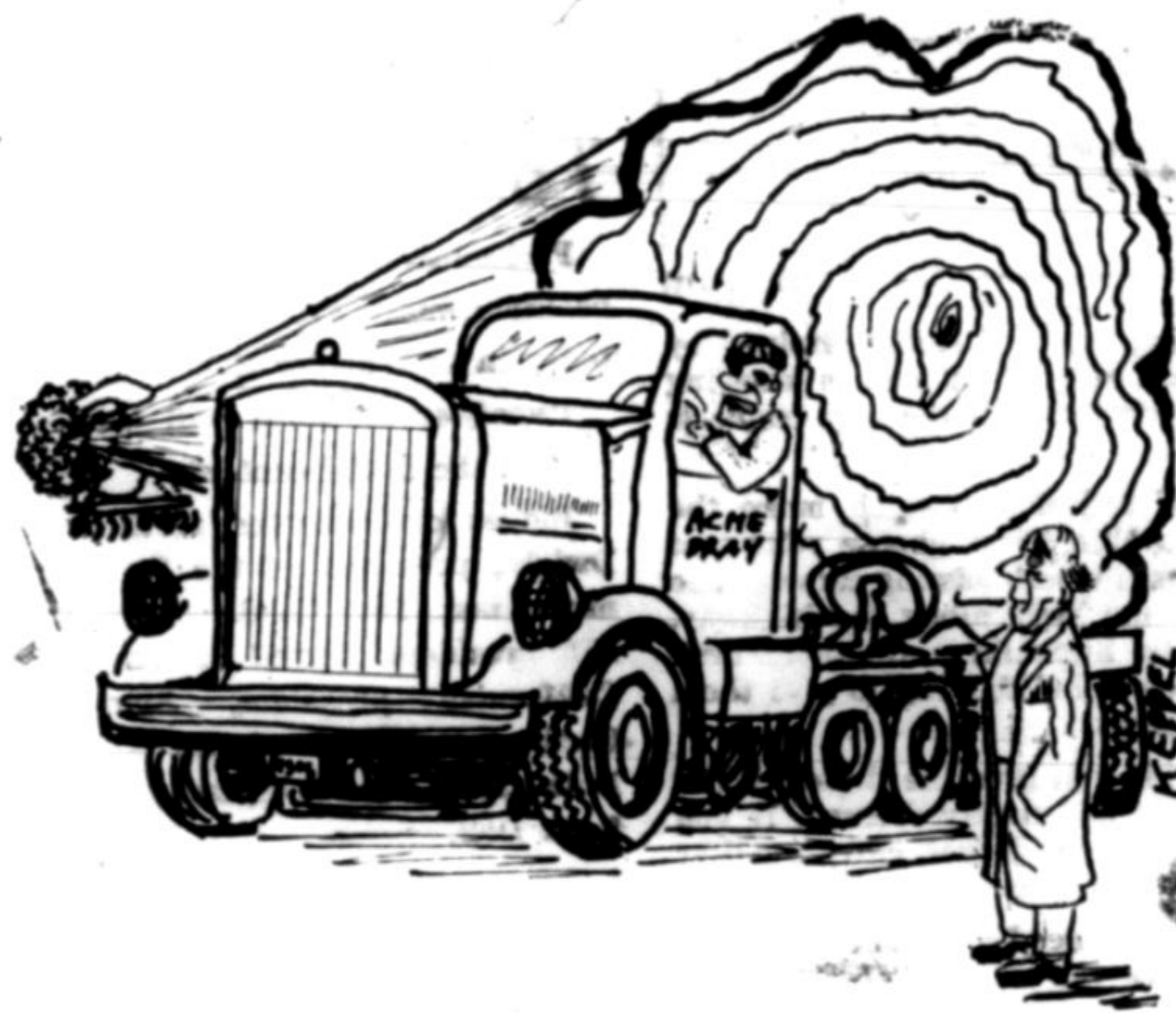
"Botany Lab COD"

Grade point average is only one measurement of achievement, and then only when it validly measures a student's creative and reasoning abilities, not merely his retention abilities. As no uniform standards for grading exists, either at the University or at the high school level, the emphasis on grades is overrated.