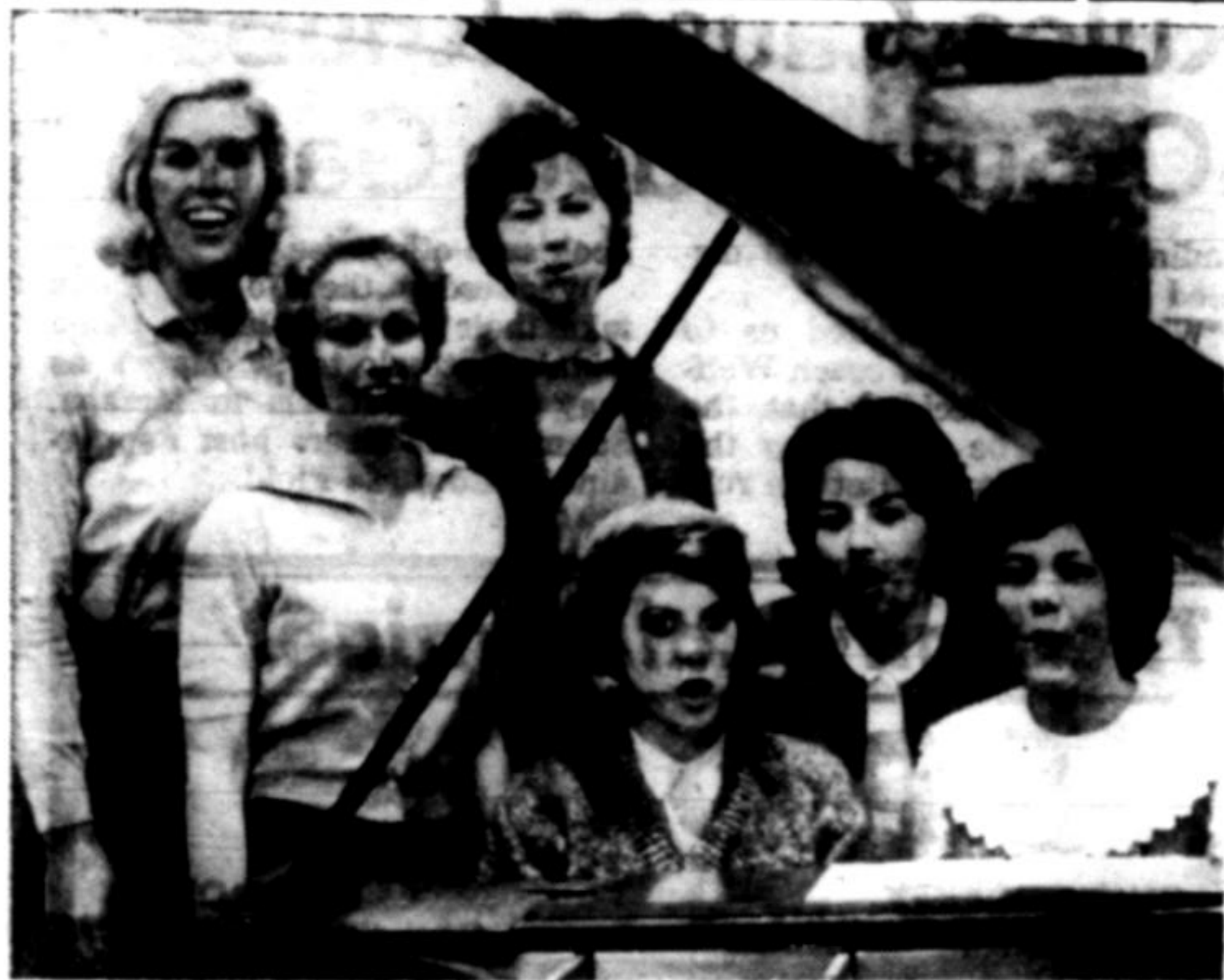
TREBLE CLEFFERS Tuning Up for Spring Concert