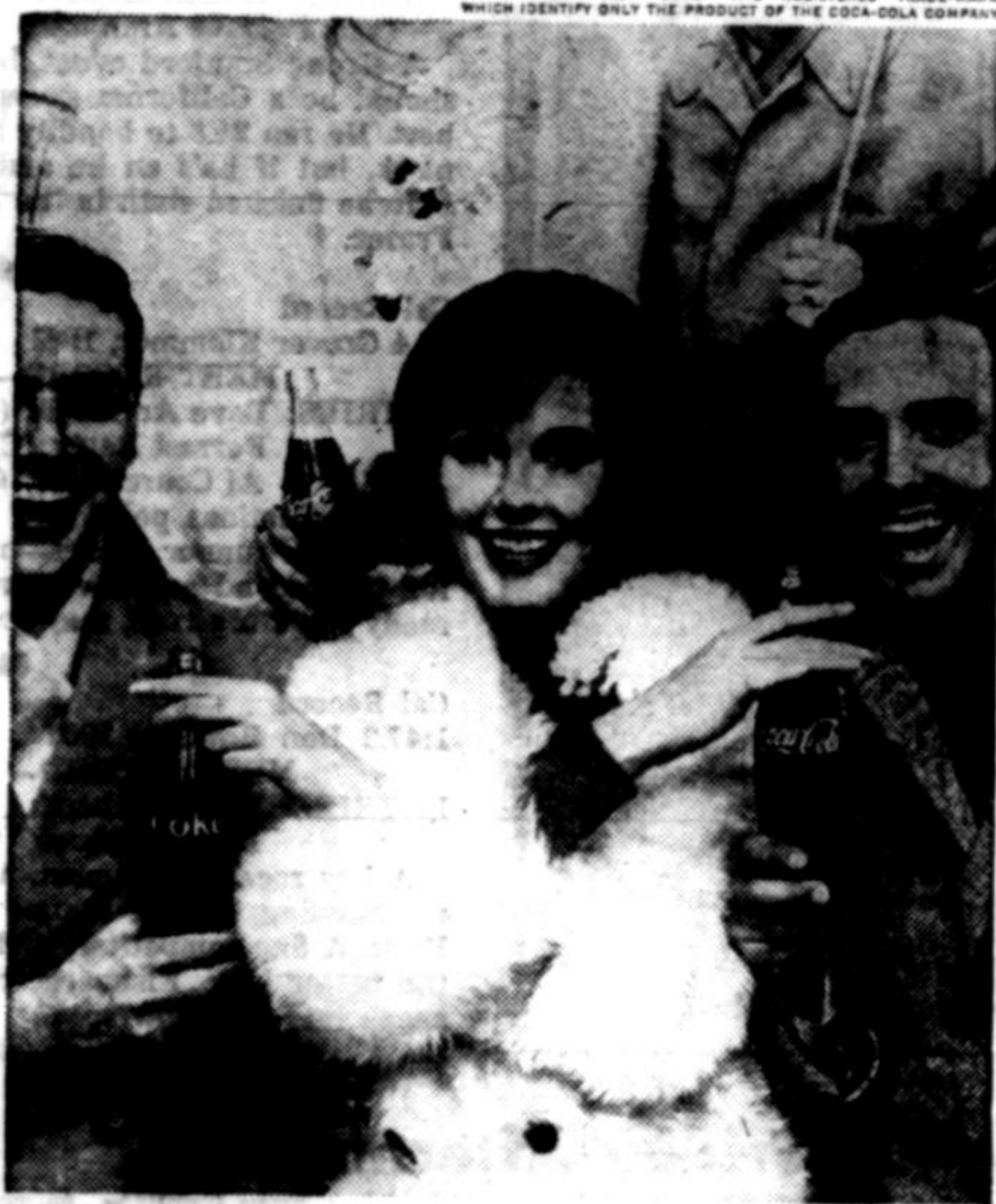
"COCA-COLA" AND "COKE" ARE REGISTERED TRADE-MARKS WHICH IDENTIFY ONLY THE PRODUCT OF THE COCA-COLA COMPANY.