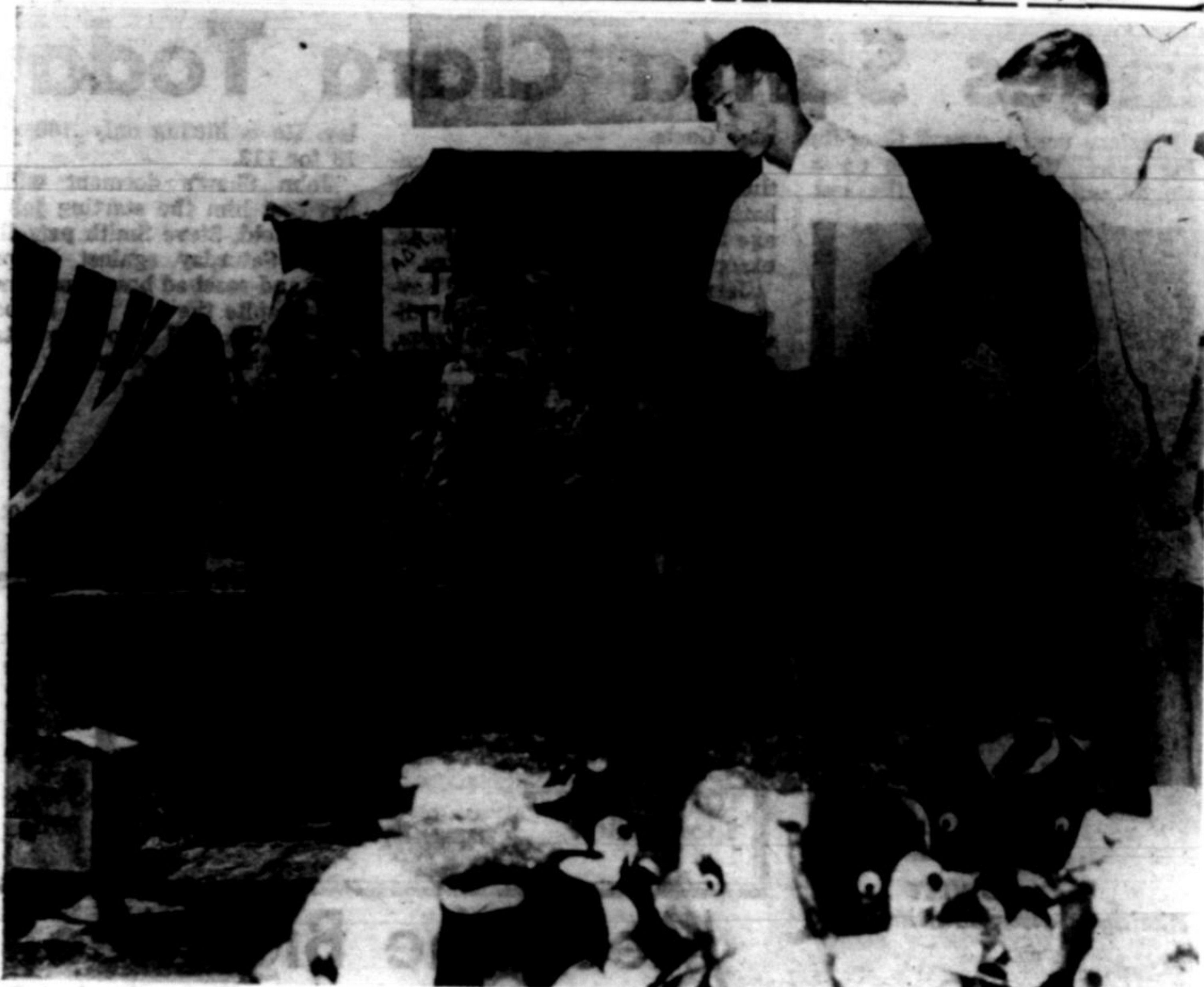
LAST YEAR AT BIG 'C' SIRKUS Annual event for Cal Camp