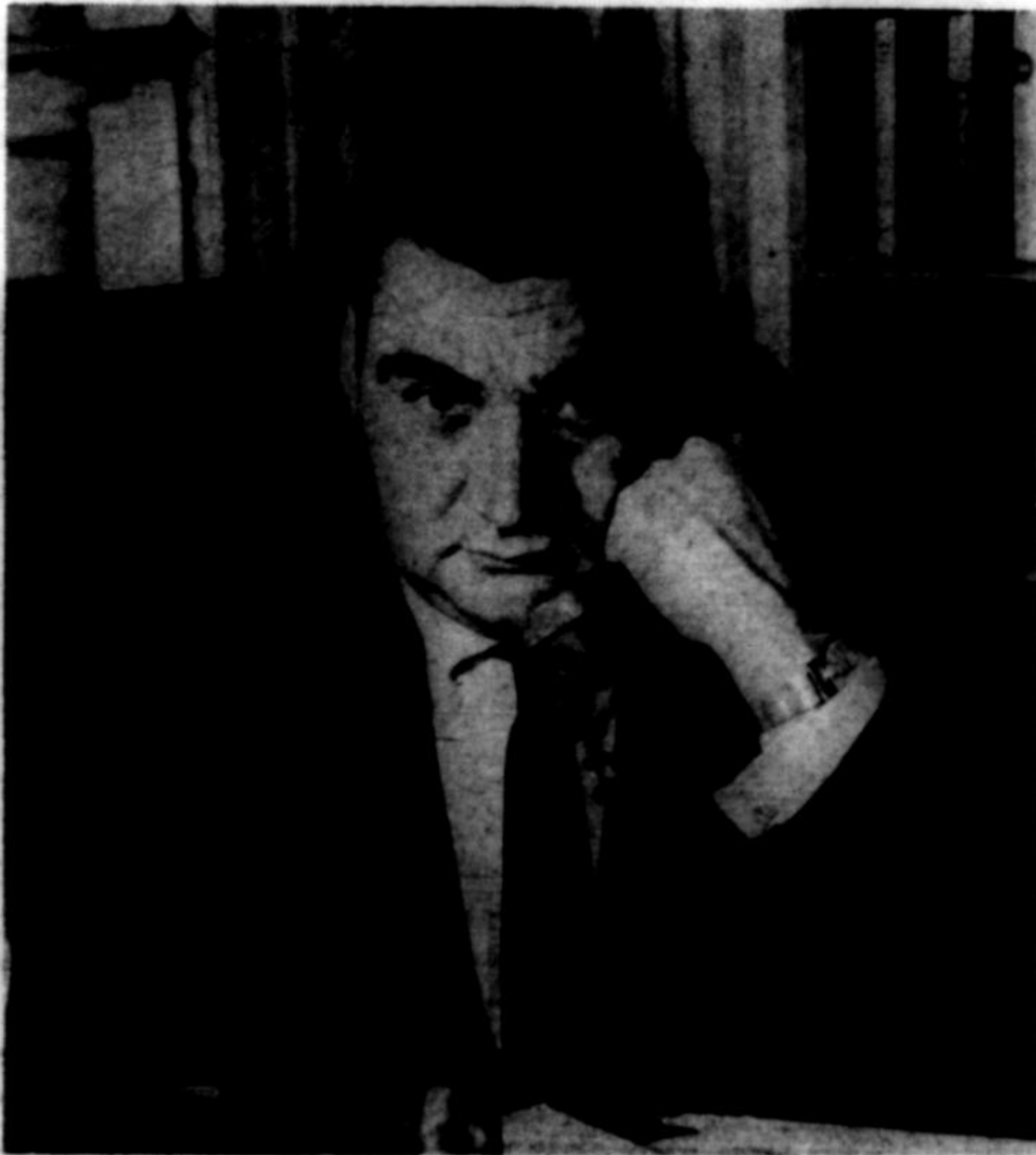
SENATORIAL CANDIDATE SALINGER Portly Pierre to speak

In the past Salinger has supported federal aid to education, continued conservation of natural resources, government improvement of birth control methods, and the civil rights bill presently in Congress. He opposes repeal of the Rumford Fair Housing Act.