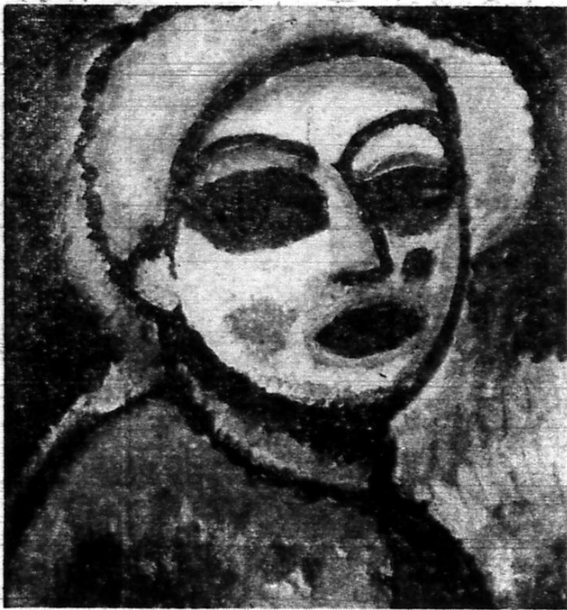
DOES SHE OR DOESN'T SHE? . . . Currently exhibited at University Art Gallery are the works of Alexei Jawlensky. Above is one of the exhibited works, titled "Blonde."