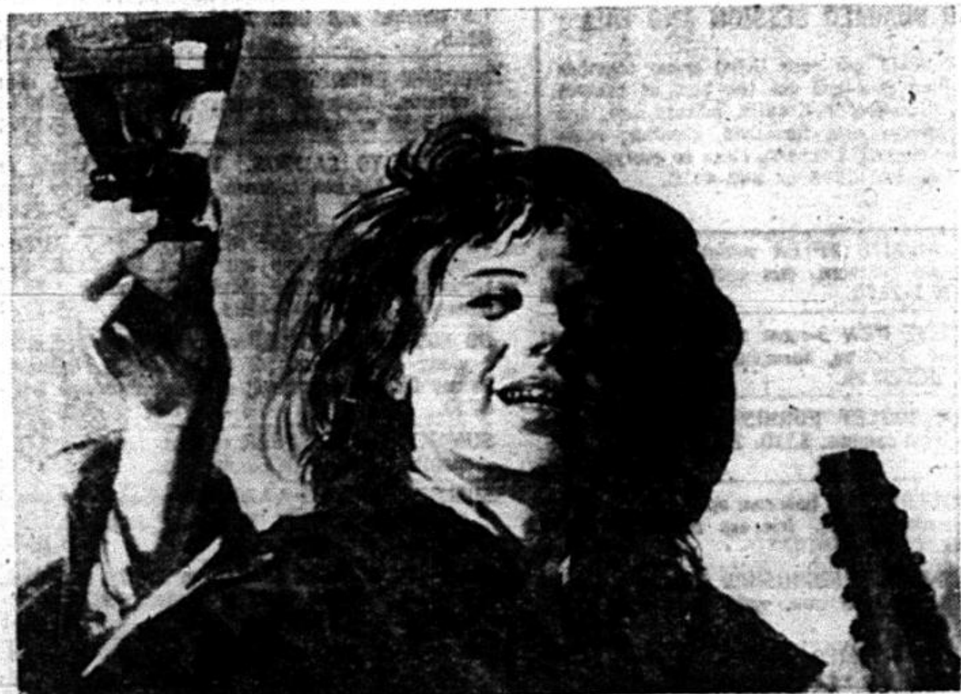
"A salute to those great TINGOBURGERS"

Tickets: B.H.S. Accountant's Office; Lampard-Otter Travel, 2181 Shattuck Ave.; By Mail—Check payable Berkeley High School—list date, enclose return envelope; At Door on night of performance.