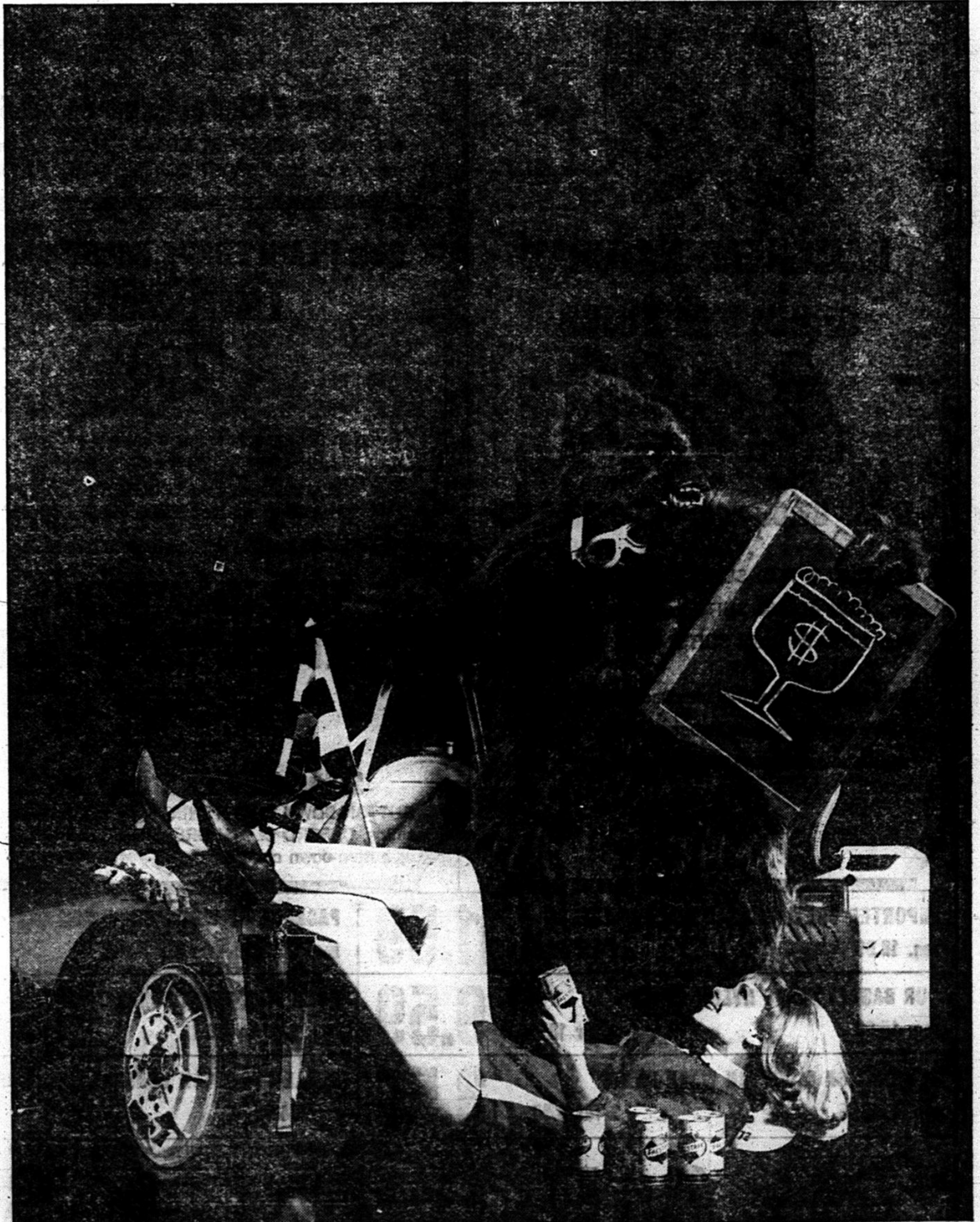
Advt. for Falstaff Brewing Corp. of San Jose, Calif., celebrating the taste of victory and great beer.

Home Office: Bloomington, Illinois Automobile Insurance Company