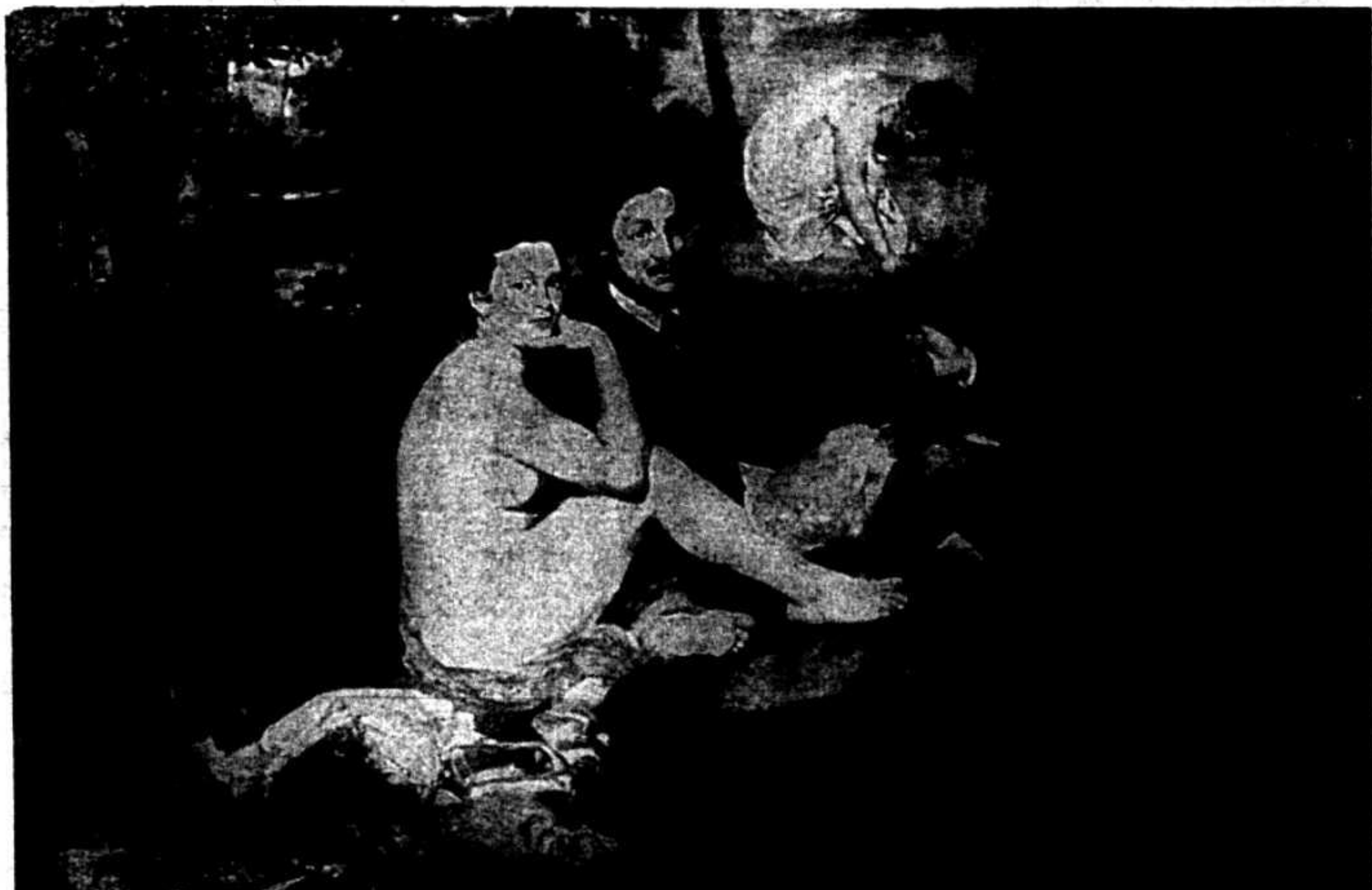
"We Will Have Our Picnic in the Next Copse . . ."