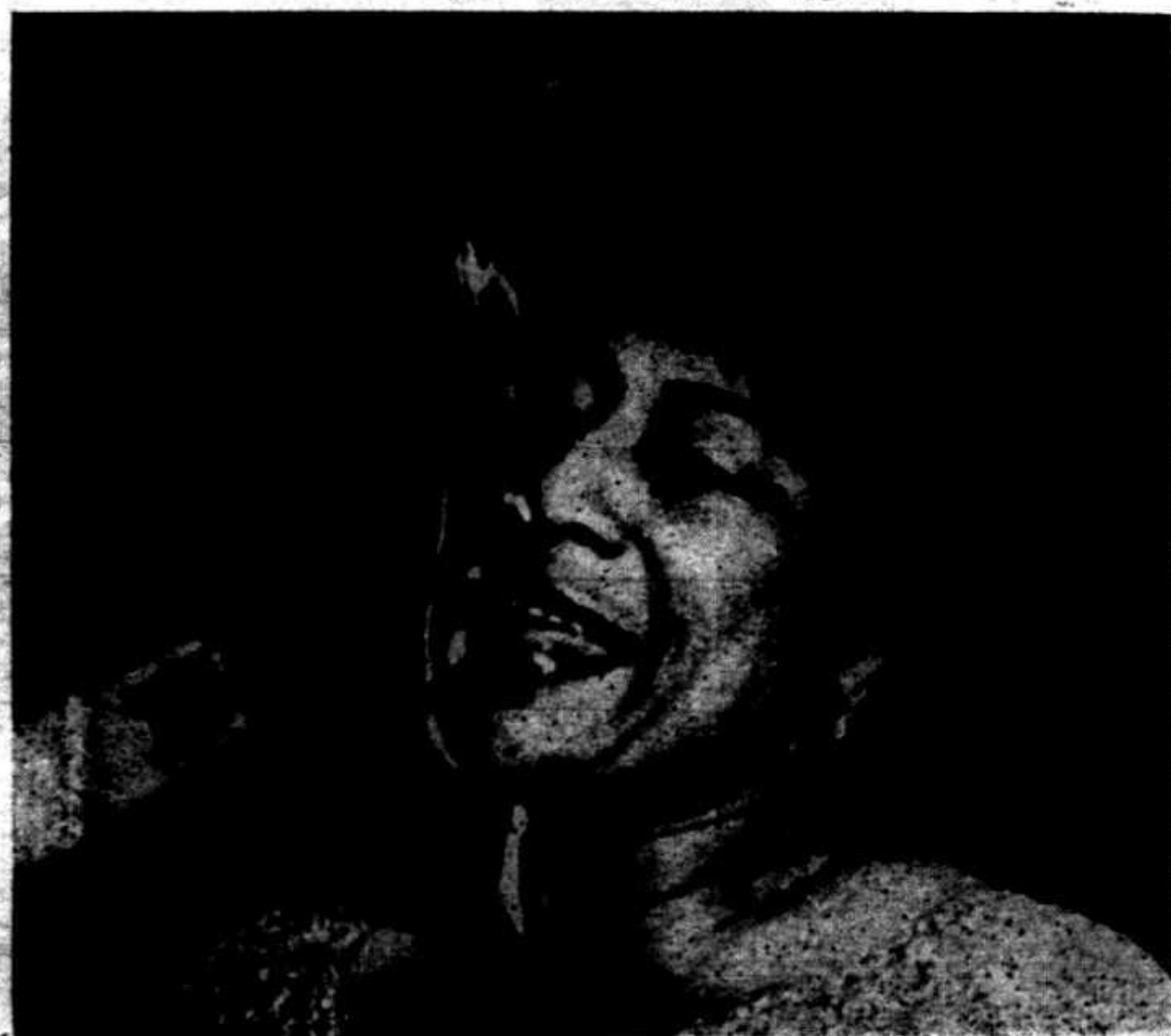
ELLA FITZGERALD Here for Big Game Concert

Ella Fitzgerald, long-heralded as jazz's foremost female vocalist, will appear at this year's Big Game Concert at 8 p.m. Nov. 13 in Harmon Gymnasium.