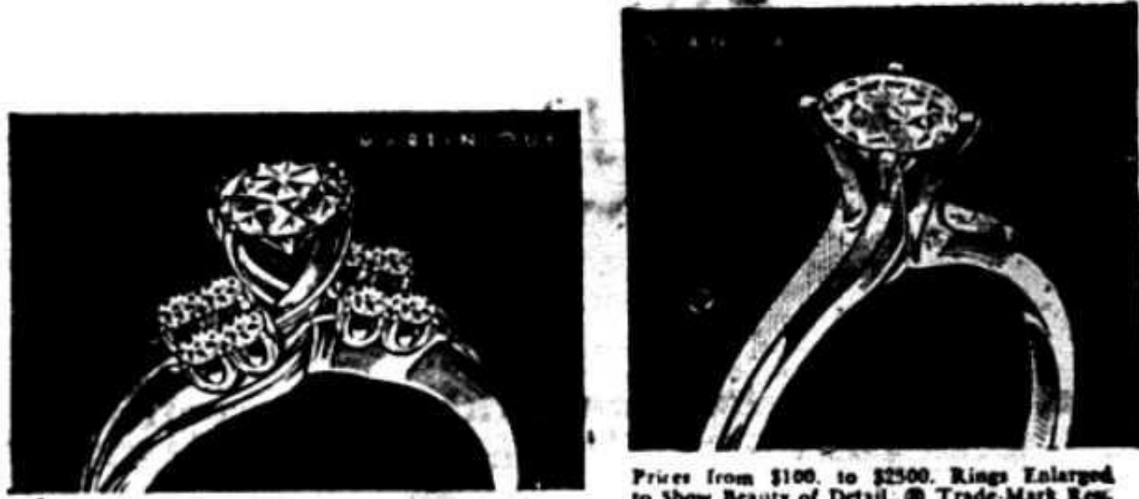
Prices from $100. to $2500. Rings Enlarged to Show Beauty of Detail. © Trade-Mark Reg.

Each Keepsake setting is a masterpiece of design, reflecting the full brilliance and beauty of the center diamond . . . a perfect gem of flawless clarity, fine color and meticulous modern cut. The name, Keepsake, in the ring and on the tag is your assurance of fine quality. Your very personal Keepsake is now at your Keepsake Jeweler's store. Find him in the yellow pages under "Jewelers."