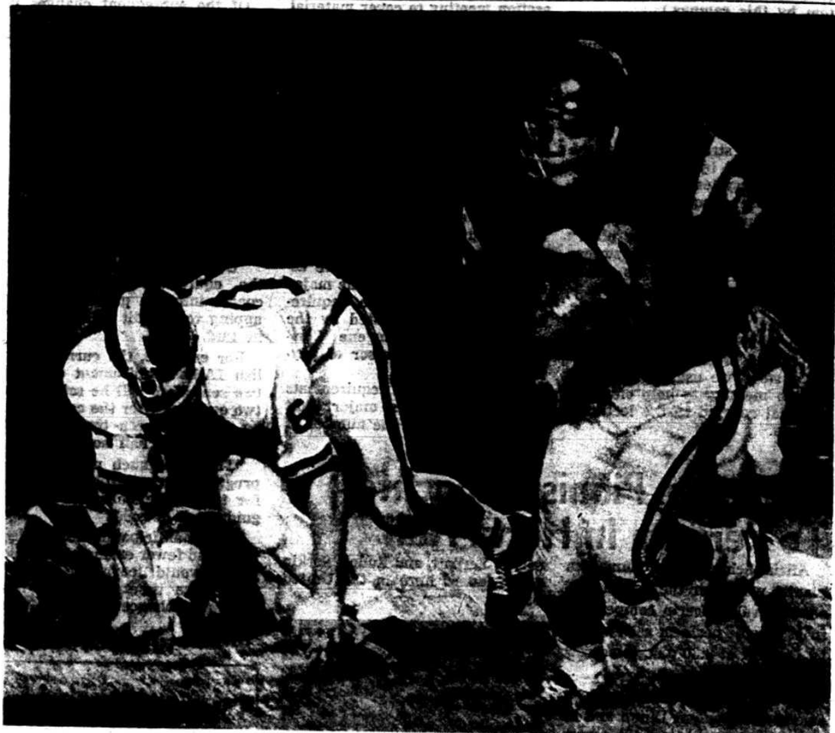
MARVELOUS MIKE . . . Heisman Trophy candidate Mike Garrett will lead the Trojans when they invade Memorial stadium Saturday. Here Garrett is seen reeling off a huge gain against Oregon State.