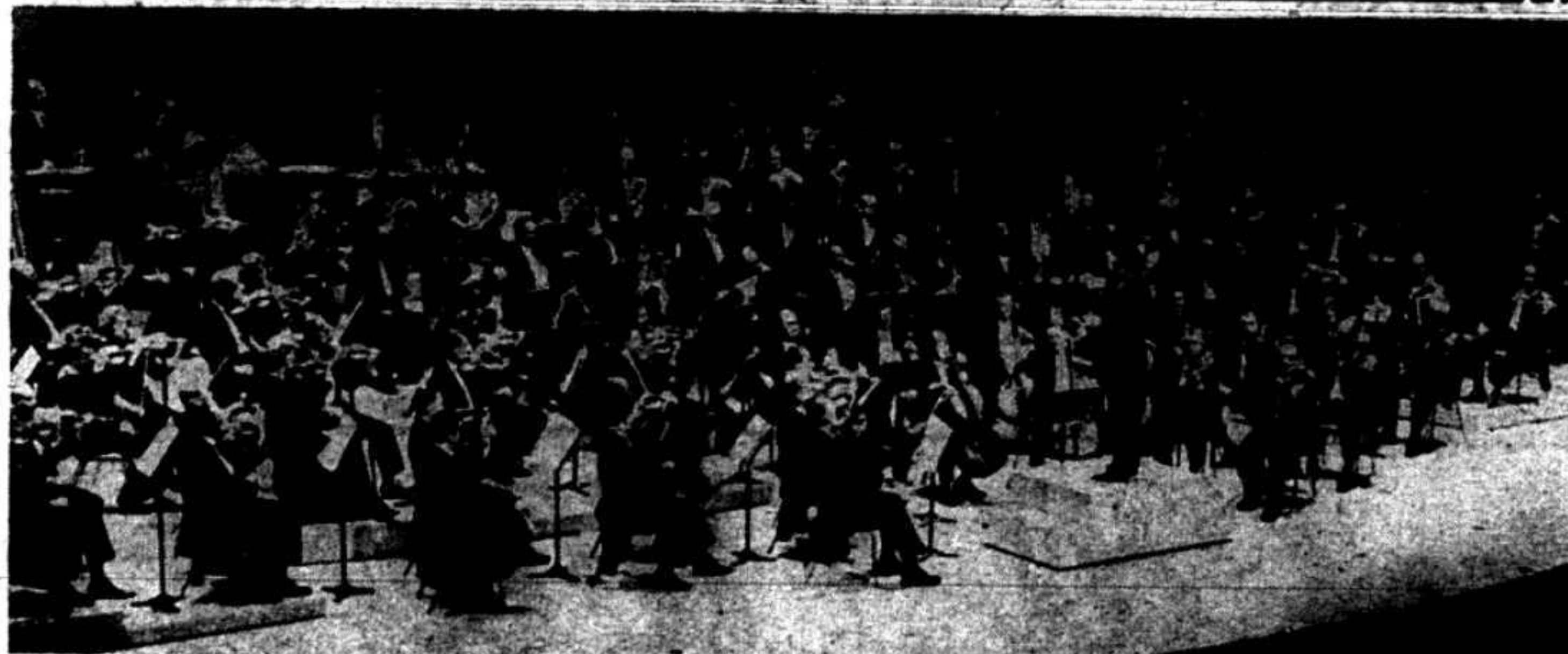
COMING SOON . . . The Los Angeles Philharmonic Orchestra under the direction of Zubin Mehta will perform next Thursday in Harmon Gym.