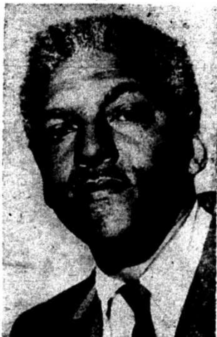
BAYARD RUSTIN, Civil Rights Leader

When the conference recon- (Continued on page 7)