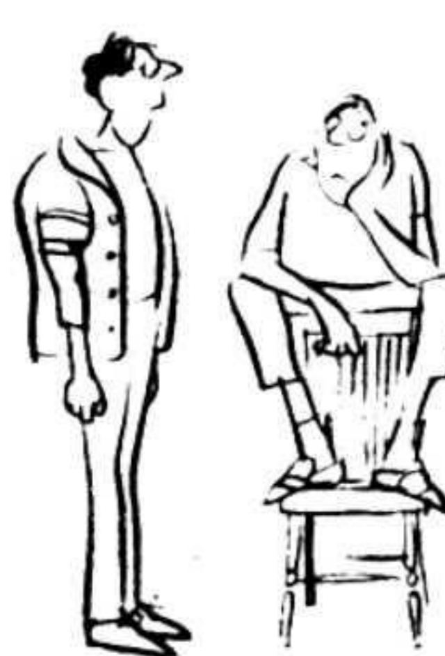
4. A month ago you left your clarinet on the bus to Boston.