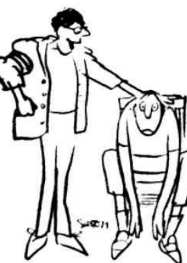
6. If you want to start hanging on to your money, I'd suggest Living Insurance from Equitable. The premiums you pay keep building cash values that are always yours alone. And at the same time, the Living Insurance gives your wife and young solid protection.

They don't call me Hot Fingers for nothing.