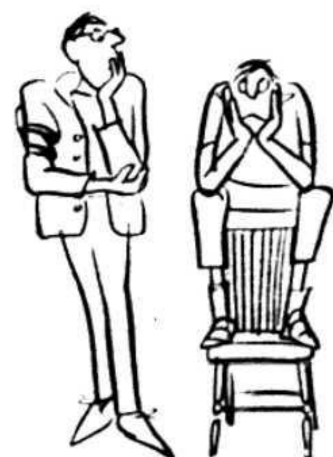
5. How come you have so much trouble keeping your hands on your capital?

They don't call me Hot Fingers for nothing.