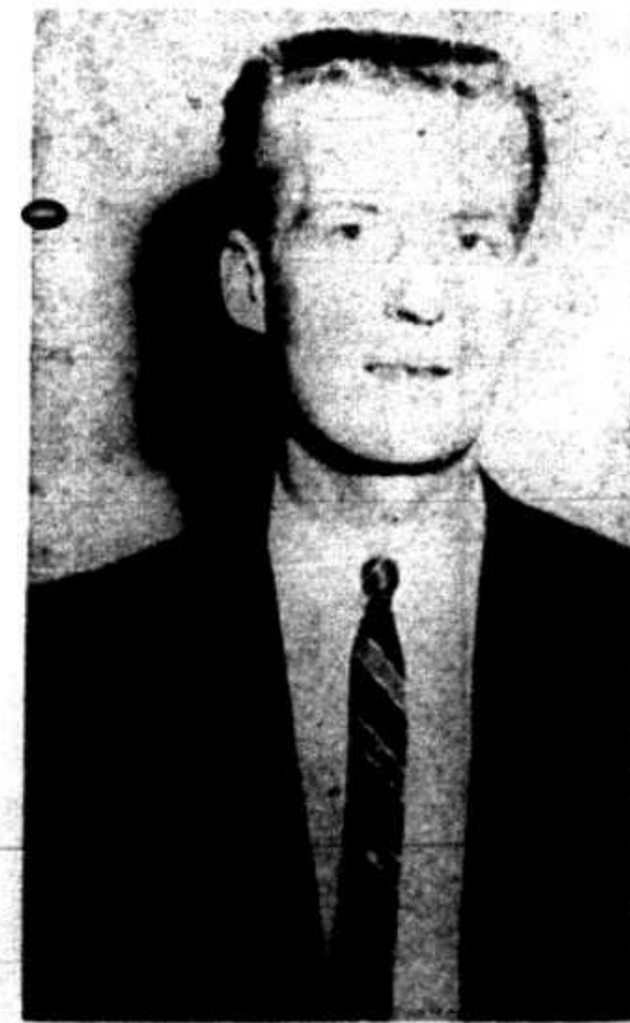
DICK RIEMANN "Inside Cuba . . ."

The series is sponsored by the Academic Senate's Select Committee on Education.