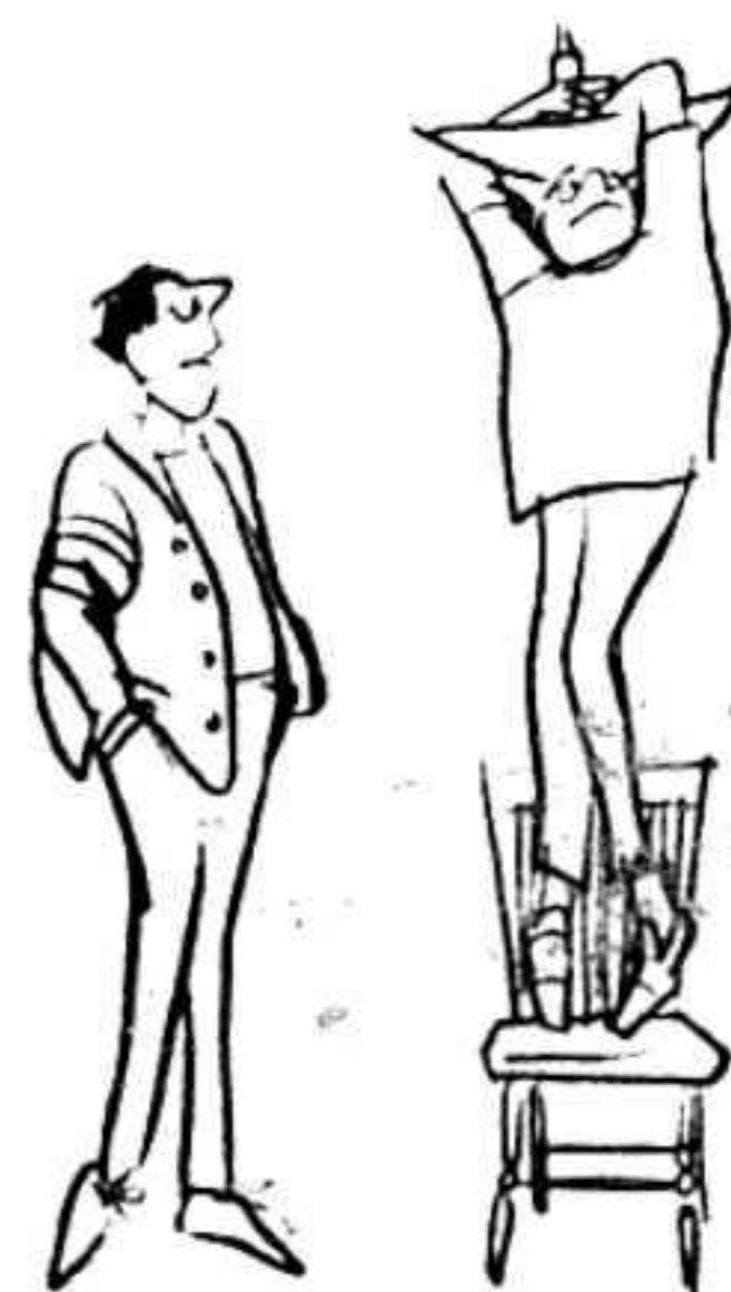
1. What's up?