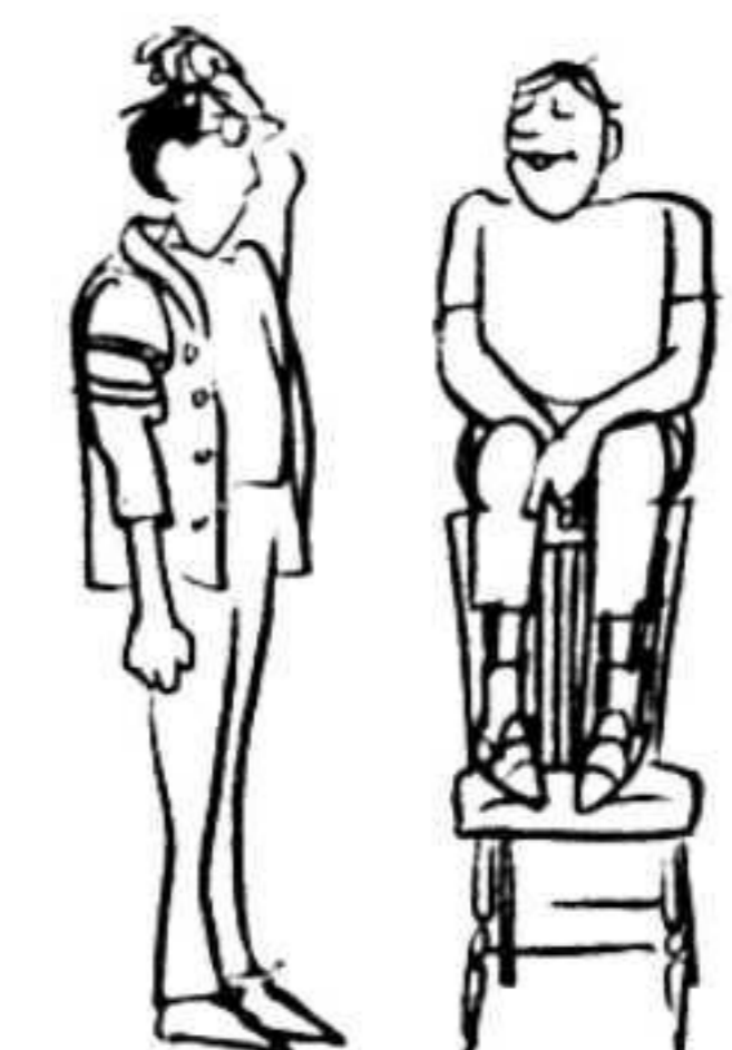
3. The last time I dropped in you were taking the sink apart to get at your tiepin.