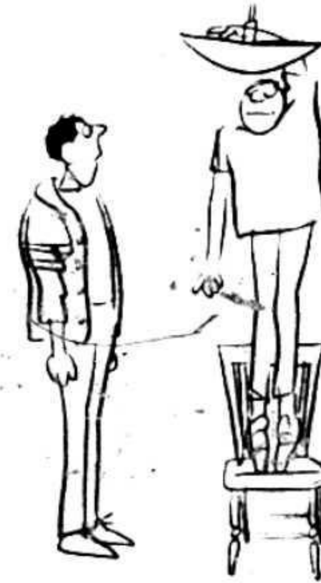
2. In the lighting fixture?