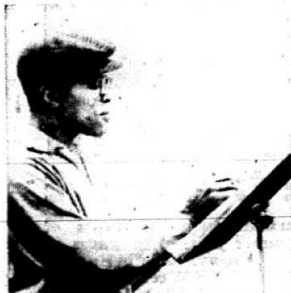
Jon Hendricks will be appearing at the Bear's Lair Cabaret this Friday, November 19, after the rally, at 9:15 and again at 10:30. Admission will be $1.00. Refreshments will be available.