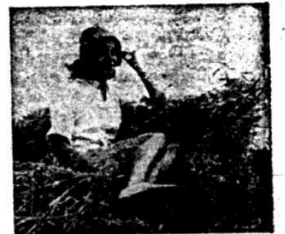
HAVE FUN WORKING IN EUROPE.

Contemporary Christians on Campus Box 11791, Palo Alto