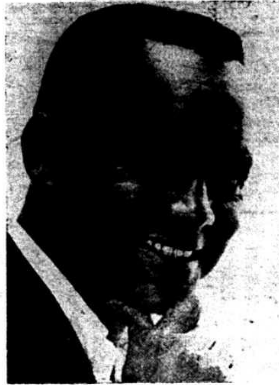
JOHN CONYERS, JR.

The sole Negro member of the U.S. House of Representatives Judiciary Committee will speak on voting rights legislation at noon today in 120 Boalt Hall. John Conyers, Jr., a Detroit attorney,